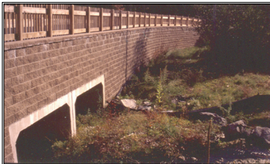
Figure 8. Example of vertical headwater that reduces length of culverts.

Corrugated culverts are preferred over smooth culverts since the corrugations create a roughness that aids in the retention of streambed material. Metal culverts are least preferred due to longevity concerns with rusting.