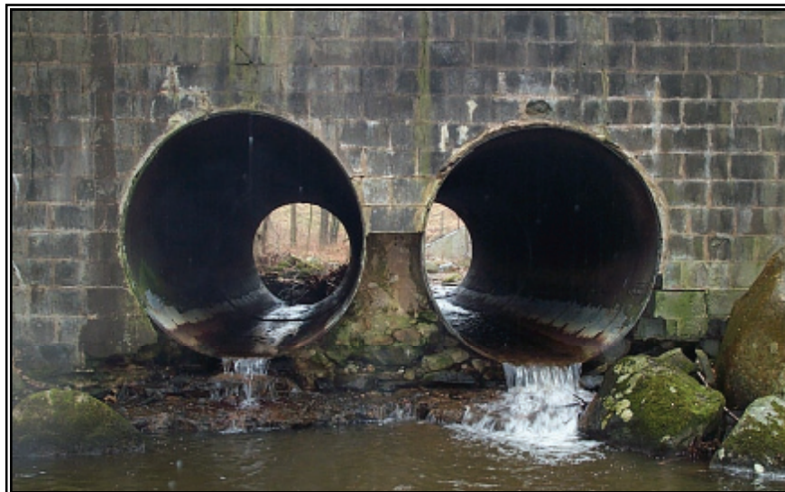
Figure 2. Example of culverts perched above streambed.

The most common stream crossing problems in Connecticut are perched culverts that are situated above the elevation of the stream bottom at the culvert outlet (downstream end) that present obvious physical barriers to upstream fish passage (Figure 2). Perched culvert conditions are the result of improper installation or are created over time by years of excessive scour and erosion of the streambed at the culvert outlet. Freeze-thaw conditions can also lead to culvert perching.