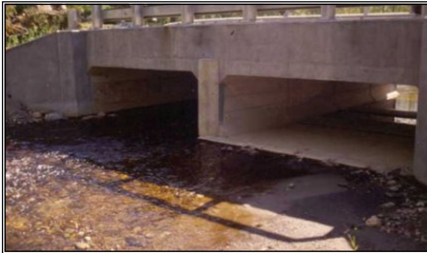
Figure 7. Culvert on left is sunken 1 foot below grade. Culvert at right, installed “at grade” accommodates high stream flows.

Multiple culverts are discouraged where design criteria can be met with a single culvert. For multiple culvert situations, one or more of the culverts should be installed as per the guidelines for single culverts (Figure 7). Deflectors may need to be installed in the stream to concentrate low streamflows into and through the recessed culvert. Recessed culvert(s) should be installed in the thalweg or deepest section of the channel and be in alignment with the low flow channel.