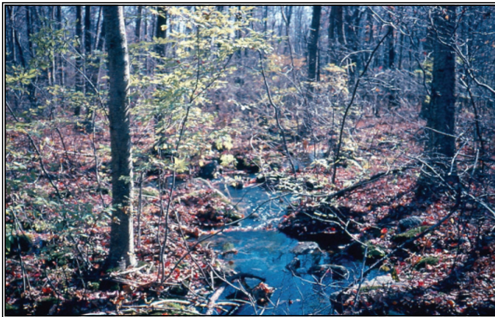
Figure 1. Example of small stream in Connecticut that supports a fish community.

Guidelines focus primarily on fish and fish passage, but incorporating the suggested practices will also benefit other wildlife. This document is not intended to be a technical design manual. Readers should consult specific guidance documents provided by municipal, State, or Federal regulatory offices having permitting authority over a stream crossing project. Also, scientific and technical manuals produced by other agencies, including those of the States of Vermont (VDFW 2005), Washington (WDFW 2003), Oregon (Robison et. al. 1999) and California (CFGD 2003) can provide additional guidance on fish passage design and related issues.