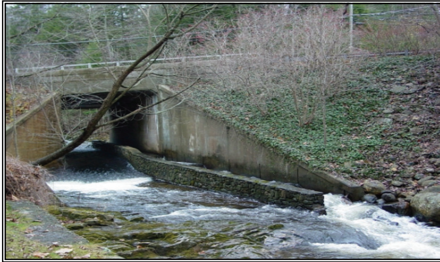
Figure 13. Example of fishway installed within a culvert.