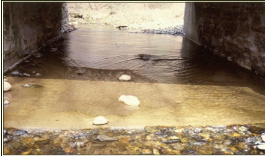
Figure 3. Example of shallow water conditions in a concrete box culvert.