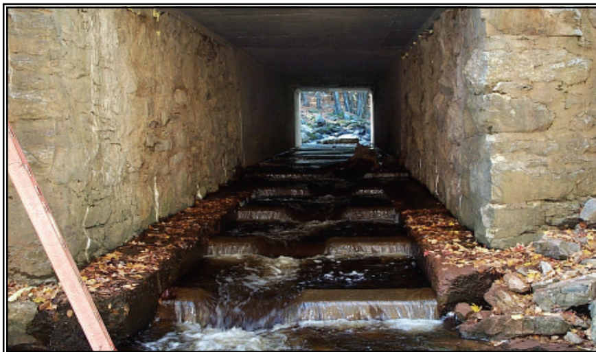
Figure 12. Example of concrete weir system.