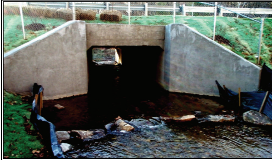
Figure 11. Example of boulder weir installed at outlet to create backwater into a culvert.

baffle configuration designs (Robison et. al. 1999, VDFW 2005). Baffles can increase debris clogging and accumulation and therefore require periodic maintenance. Installation of an engineered fishway can be utilized where the above retrofit options are not viable (Figure 13). Culvert retrofit design can be complicated and will usually require the services of a qualified civil engineer as well as review by HCE fisheries biologists. Culvert retrofits are never a substitute for full replacement and in some cases, full replacement can be more cost effective.