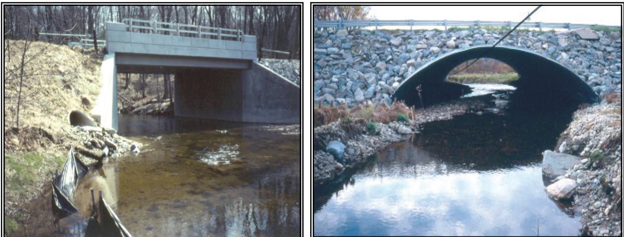
Figure 6. Clear span bridges and bottomless arch culverts are preferred stream crossing structures.

Many of the standards in these guidelines have been adopted from and are consistent with U.S. Army Corps of Engineers Connecticut Programmatic General Permit guidance. Refer to http://www.nae.usace.army.mil/reg/ctpgp.pdf for more details relative to general permit requirements and also contact the DEP Inland Water Resources Division for permit guidance.