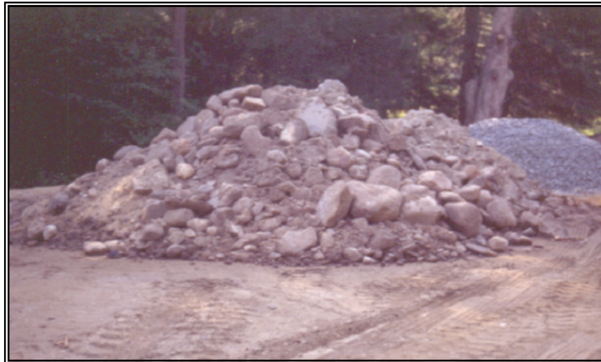
Figure 9. Streambed materials stockpiled for installation within sunken culverts.

Native streambed material excavated for culvert placement should be stockpiled and replaced within the culvert following its installation. (Figure 9). Streambed material should be replaced in a manner replicating the original stream cross section with a well-defined low flow channel contiguous with that existing in the stream.