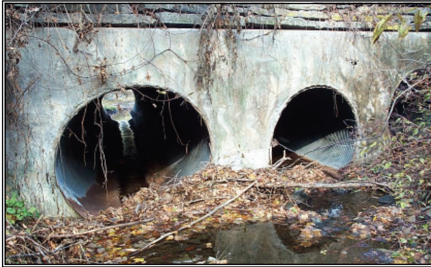
Figure 5. Debris blockage at culvert inlets that blocks fish passage.