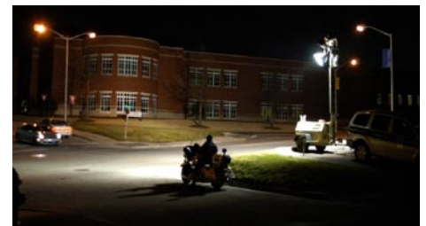
Pitt County, NC, nighttime enforcement effort