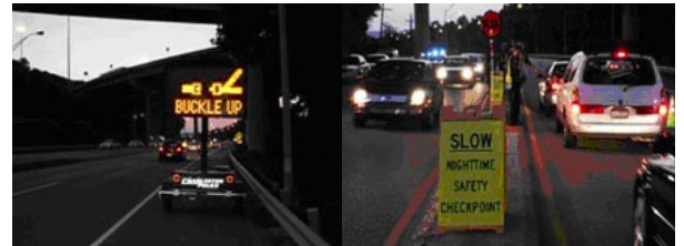
Charleston, West Virginia's Safety Enforcement Zones

explained as “safety zones” and “belt zones” or “belt checkpoints,” given that the focus here was on seat belts and West Virginia is a secondary law State. This seat belt operation resulted in significant increases in impaired-driving arrests and other criminal arrests. Several officers were engaged in the operation since the zones were conducted in high-traffic and highly visible locations. A great deal of earned news media was generated for this effort.