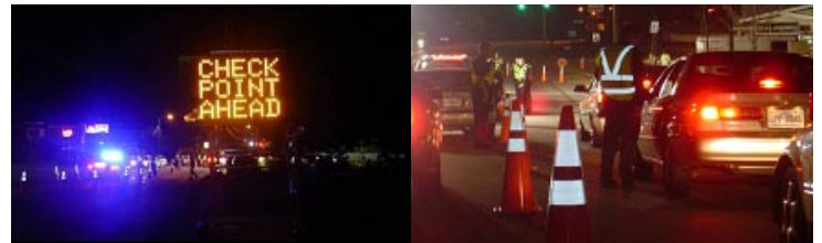
Buncombe County, NC, nighttime enforcement

used seat belt checkpoints during each of the 40 nights of enforcement. They used the NHTSA grant to pay for officer overtime and equipment needed to run nighttime checkpoints (variable message signs, reflective vests, cones, portable lights, a trailer, etc.). They partnered with several other local agencies to