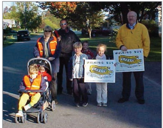
Westbrook Elementary School, Westbrook, ME

For an example letter, see Resources: Recruitment .