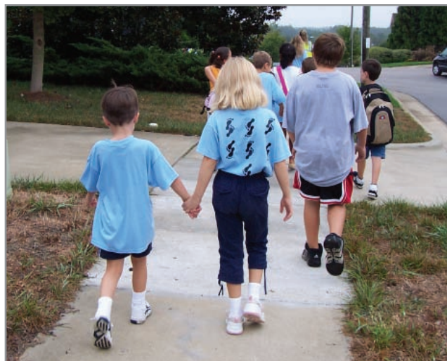
Olive Chapel Elementary School, Apex, NC

This guide outlines the benefits of starting a walking school bus as well as points to consider before launching it. Two general ways to conduct a walking school bus are described: (1) starting simple with a small group of friends or neighbors or (2) creating a more structured program to reach more children. The benefits, considerations and variations of each are detailed so that organizers can choose the approach that matches local needs. For communities with interest in starting a bicycle train, additional considerations are highlighted. Examples of real-life walking school buses and bicycle trains are included to provide ideas and inspiration.