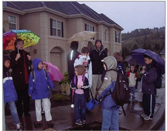
Forest Park Elementary School, Portland, OR

A law enforcement officer or local traffic engineer may also have helpful input regarding more complex routes. For more detailed guidance, see Resources: Route planning .