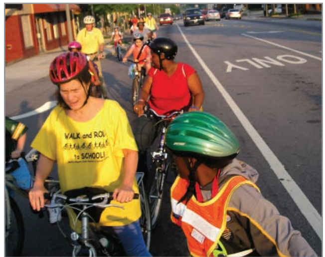
Mason Elementary School, Duluth, GA

See Resources: Bicycle trains for an example of steps to implementing a bicycle train.