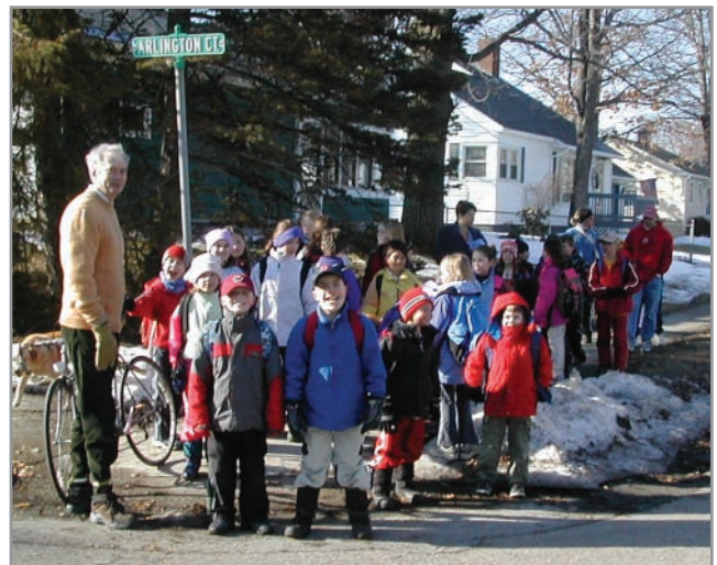
C.P. Smith Elementary School, Burlington, VT

Now, every Wednesday morning the bus departs from a walk leader's house with a small group of children. For late arriving students, a closed garage door indicates that the bus has already departed. The group continues along a major roadway picking up children along the way. Some parents join in the walk while others drop their children at the stop and leave when the bus arrives. There is no written schedule; however organizers hope to install signs along the route indicating stops and schedules.