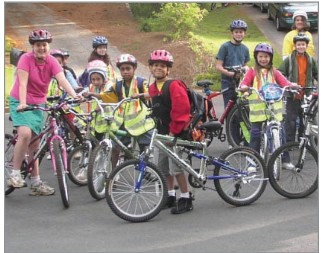
Mason Elementary School, Duluth, GA

With that overwhelming start, the Mason bicycle train has become an integral part of the school's monthly "Walk and Roll to School Day" events. The train is staffed by volunteers from the local Gwinnett County Bicycle Users Group and a few Mason parents. The "engineer" leads the group, the "caboose" brings up the rear. Additional adults are interspersed between the children with a typical ratio of 1 adult to 4 children. The train has two starting "stations" in the morning and then the two groups are intended to meet and form one large train that rides down the highly traveled road to the school. In the afternoon, the bicycle trains run back to their starting "stations."