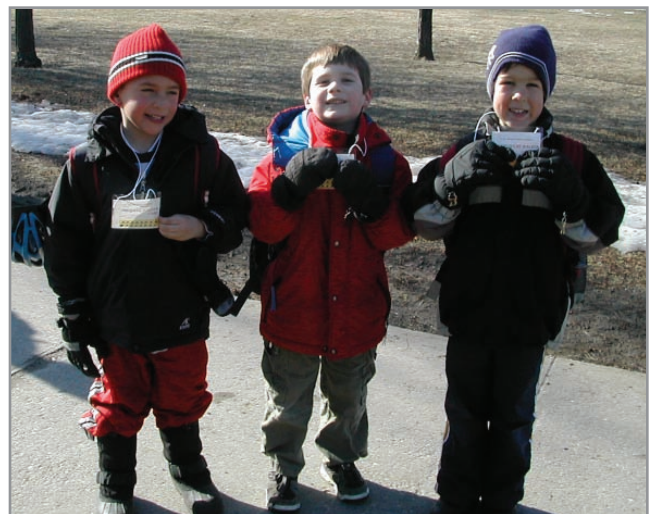
Students show off their frequent walker cards used as part of their walking school bus. C.P. Smith Elementary School, Burlington, VT