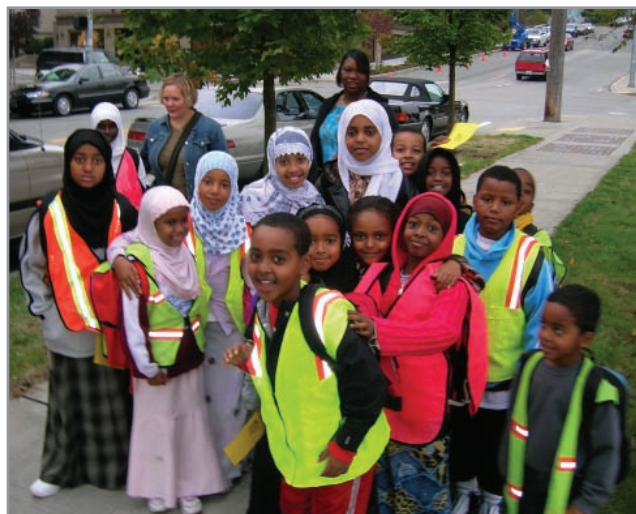
Bailey Gatzert Elementary School, Seattle, WA