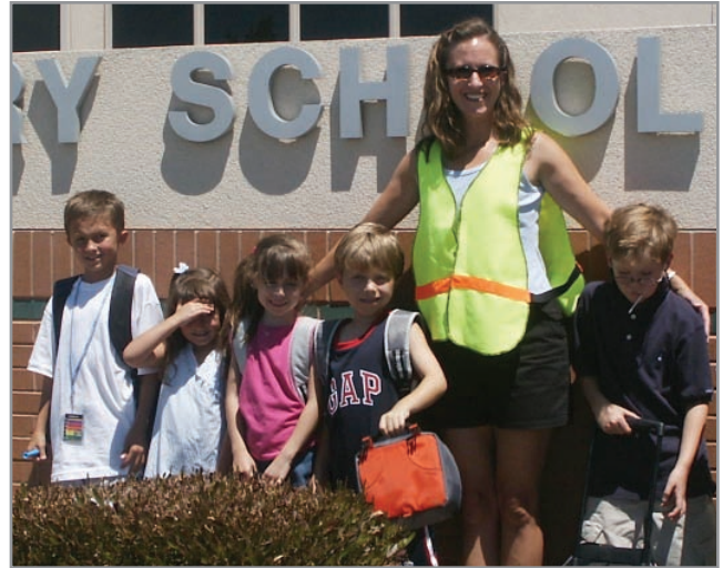
Natomas Park Elementary School, Sacramento, CA

To recognize the walkers' achievements, parent volunteers track the total number of miles walked during the school year and announce it at a year-end assembly. Walkers also receive T-shirts and certificates.