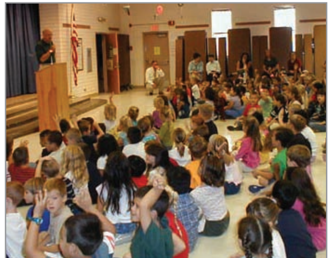
Dunham Elementary School, Tucson, AZ

Children and adults want to be a part of popular programs and enjoy being recognized for it. Share the numbers of walkers with the school and community, reward students for participating and recognize volunteers for their dedication. Whenever there is an opportunity to discuss the