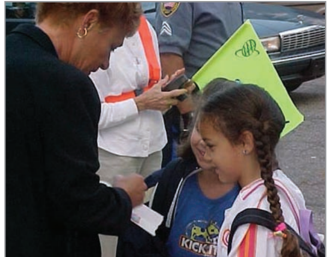
Woodsdale Elementary School, Wheeling, WV

Making the walk fun will keep children and adults involved. Below are a few examples used by other communities: