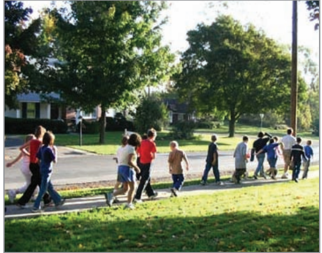
Trumansburg Elementary School, Trumansburg, NY

The structure of the walking school bus will depend on the community's interests, goals and available resources.