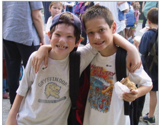
Ephesus Elementary School, Chapel Hill, NC

At Ephesus Elementary School, an informal walking school bus program with self-organized groups works well. In different neighborhoods, parents and children meet and walk to school together. Parents watch for the group to pass by their homes and join when they see them. If a parent cannot walk on a particular day, he or she contacts another walking parent to supervise their child on the way to school. Parents say that walking to school has been a wonderful way to meet other parents. 7