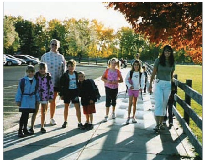
Kendallvue Elementary School, Morrison, CO