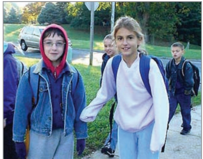
Central Elementary School, Ellicott, MD