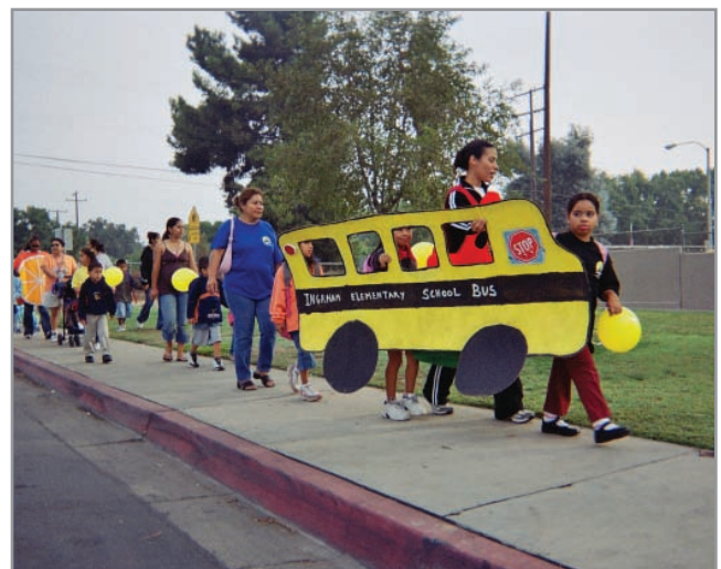
Ingram Elementary School, San Bernardino, CA