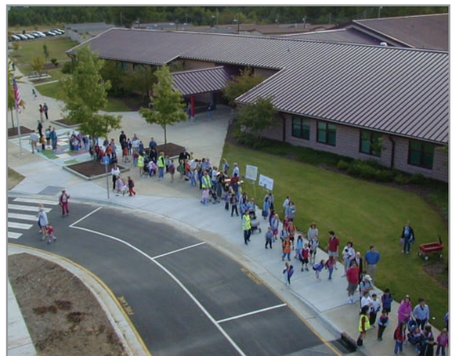
Olive Chapel Elementary School, Apex, NC

Once a month, “neighborhood captains,” parents and children walk from each of six departure points around the area. One route meets in a parking lot so that families who live too far to walk can participate. Twenty-two volunteers serve as neighborhood captains and walk with children and their parents on the six routes to school. The captains, who receive safety training prior to leading the walks, wear green vests and use whistles to communicate to children when they need to stop. Because the program is designed to be family-oriented, parents are required to walk with their children to school. Parents arrange among themselves to supervise other children. Reminders about the monthly walk are sent home on the previous Friday and children who participate receive prizes.