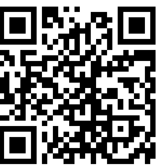
QR Code to CTDOT project page

Language assistance is provided at no cost to the public, and efforts will be made to respond to requests for assistance.