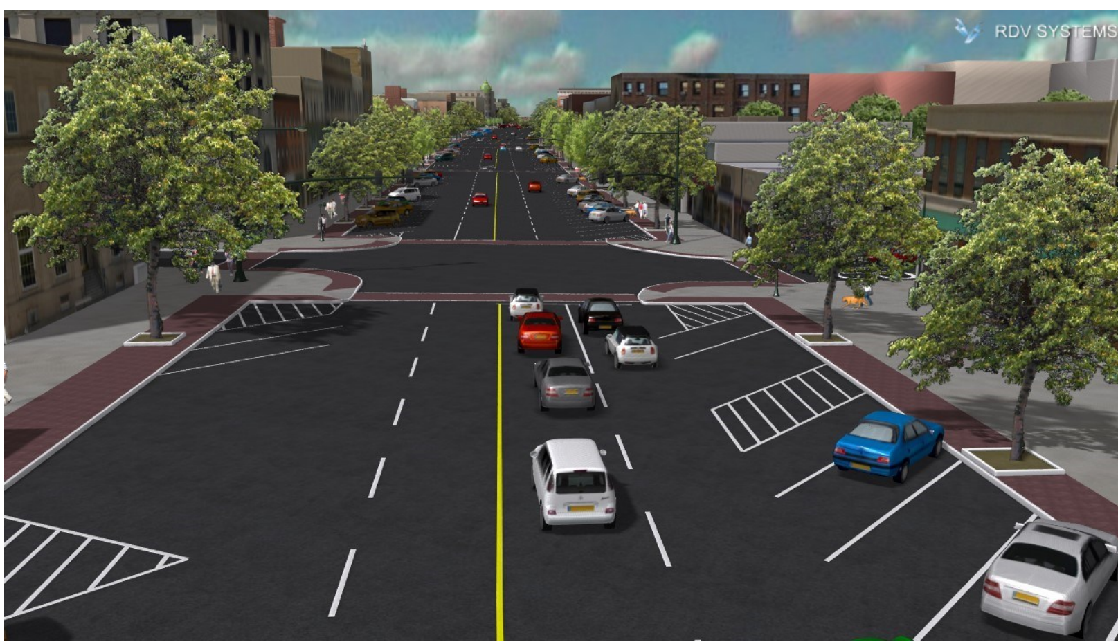
BUMP-OUTS ON MAIN STREET