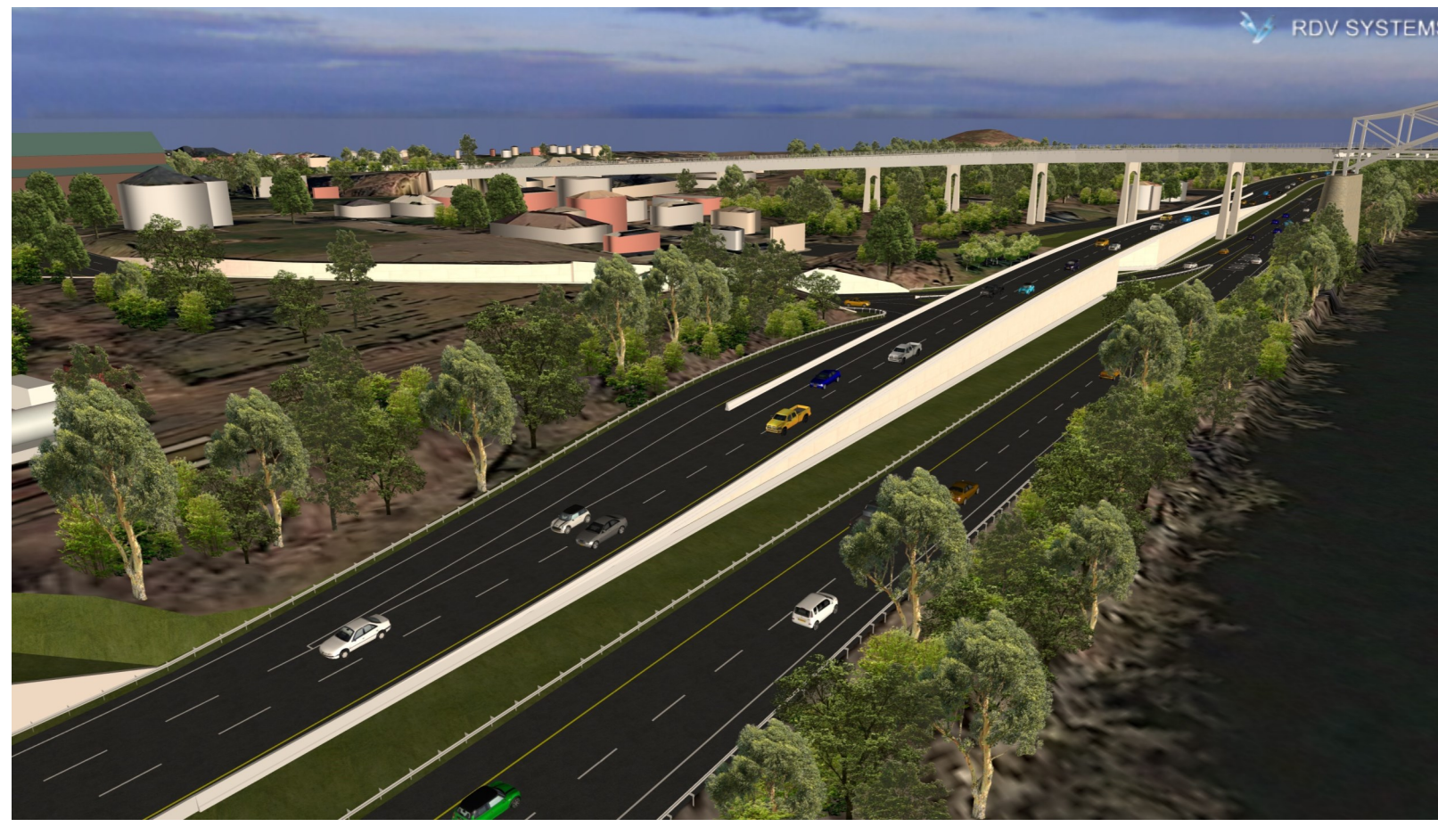
ROUTE 9 SOUTHBOUND OVER HARTFORD AVENUE