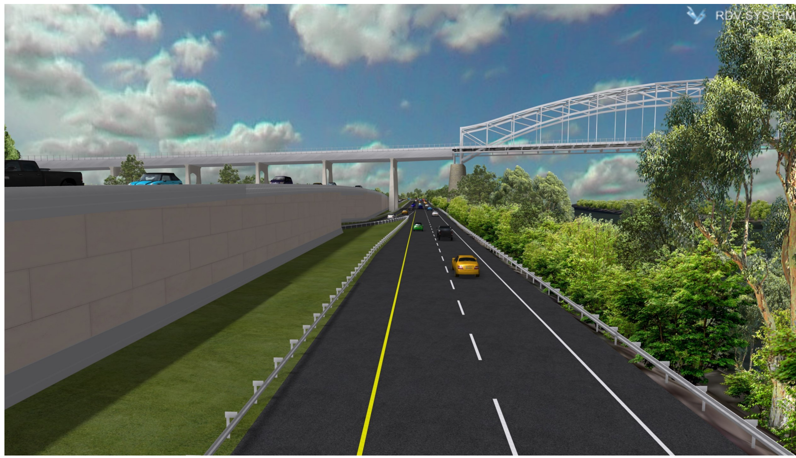
ROUTE 9 NORTHBOUND