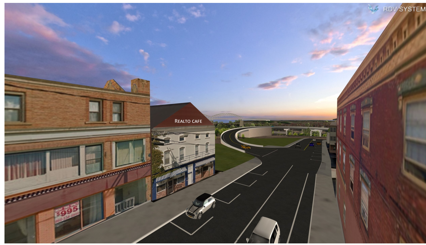
RAPALLO AVENUE OFF-RAMP