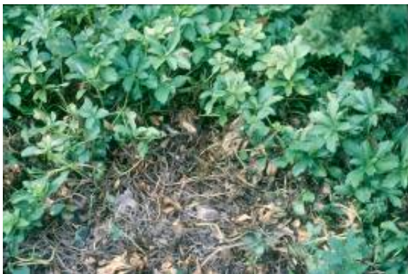
Figure 1. Diagnostic patch of dead, “blighted” pachysandra.

Volutella blight, also called leaf and stem blight, is the most destructive disease of pachysandra ( Pachysandra terminalis ) in the Northeast. It is caused by the fungus Volutella pachysandricola . Patches of wilting and dying plants often indicate the presence of Volutella blight in a bed of pachysandra (Figure 1). This fungus is considered an opportunistic pathogen that attacks weak plants. It can infect leaves, stems, and stolons. Leaves develop irregular tan to brown blotches, often with concentric lighter and darker zones with dark brown margins (Figure 2). These necrotic blotches gradually increase in size until the entire leaf turns brown or black and dies.