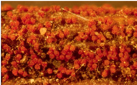
Figure 4. Reddish-orange, cushion-like fruiting structures of V. pachysandricola on stem lesions in autumn.

Plants often die in patches and the disease commonly produces circular patterns in the bed. Volutella blight is more severe in plantings weakened by winter injury, insect infestation, recent transplanting, shearing, drought, and sudden changes in light levels, particularly increased exposure to full sun.