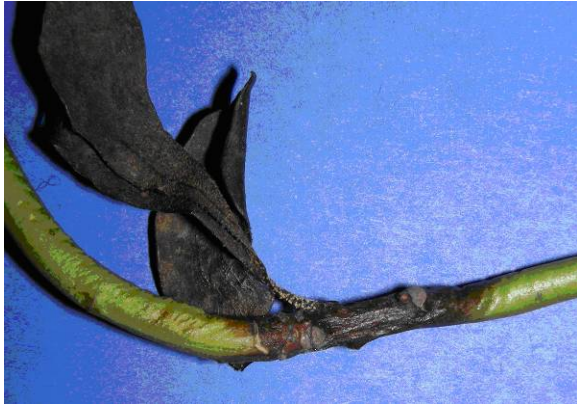
Figure 3. Brown, shriveled stem lesion characteristic of Volutella blight.

Spread of the V. pachysandricola within a bed of pachysandra is by means of these fungal spores. Infections can occur at any time in the growing season.