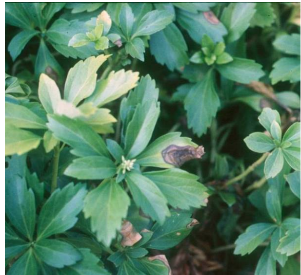
Figure 2. Necrotic foliar lesions with concentric light and dark zones.

Cankers can develop on stems and stolons and cause whole plants to shrivel and die. They can appear at terminal, mid-stem, or ground level portions of a stem. Cankers first appear greenish-brown and water-soaked but eventually turn brown or black and shrivel. As these cankers girdle the stem or stolon, they cause the whole plant to wither and die, sometimes as rapidly as within two weeks (Figure 3).