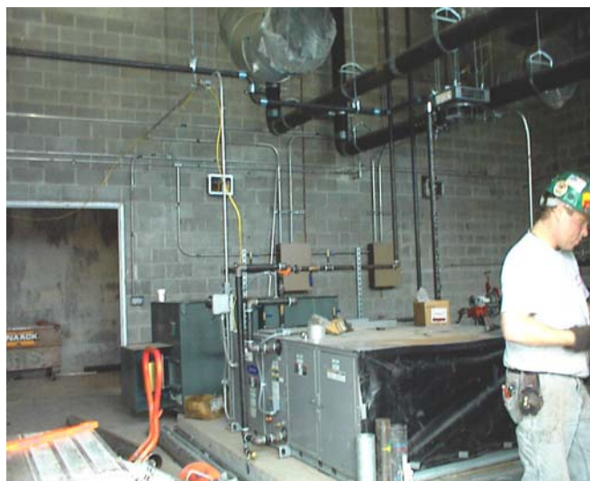
Inside the New Britain, CT Facility