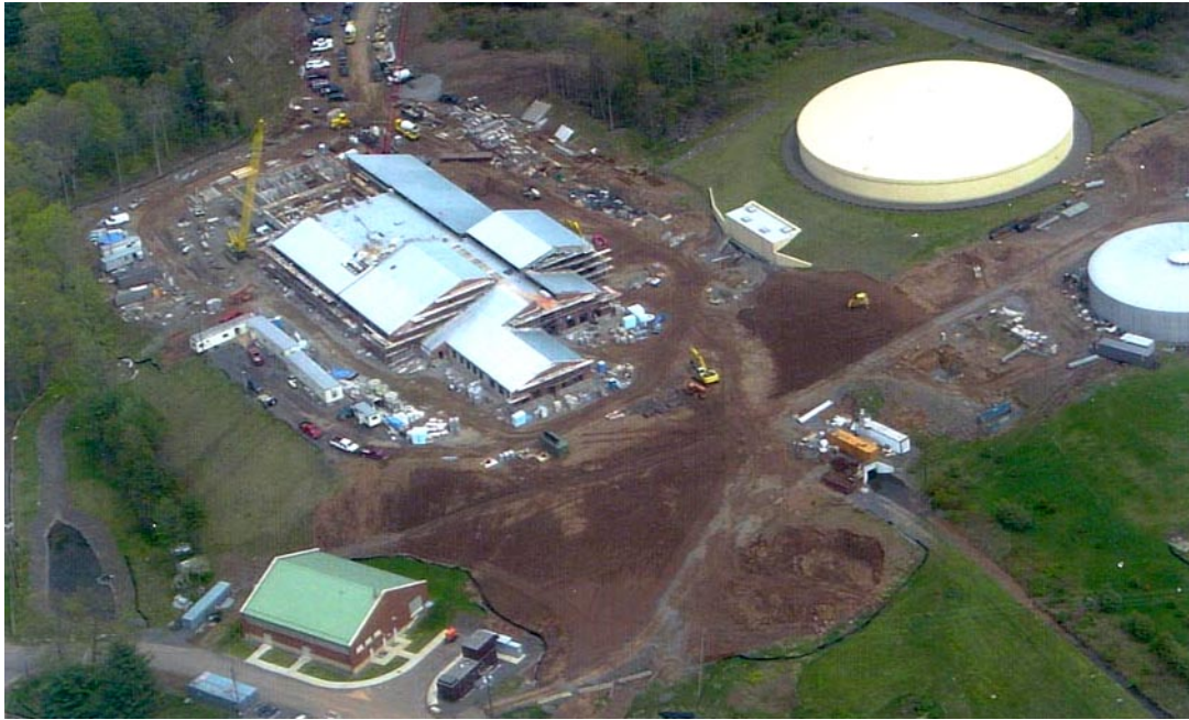
A May 2003 photo of the new plant construction in New Britain, CT.