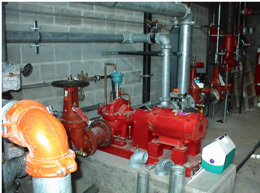
Inside the New Britain, CT facility