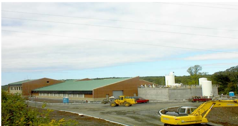
New Britain, CT

The DEP is the state agency that carries out the environmental policy of the state for conserving, improving and protecting the State's natural resources and