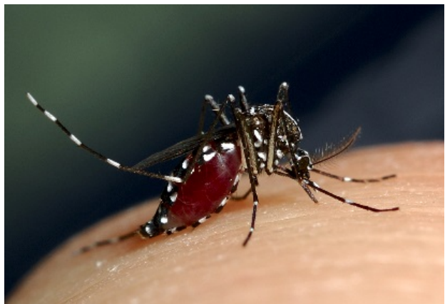
Asian tiger mosquito ( Aedes albopictus )

Several mosquito species can be found in tree holes and artificial cavities, such as discarded tires. Among these are the Asian bush mosquito ( Ochlerotatus japonicus ) and the Asian tiger mosquito ( Aedes albopictus ), which are native to Japan, Korea, and parts of Asia. Suspected of having been imported into the U.S. in shipments of tires, they quickly expanded their range through the used tire trade. These species are aggressive mammal-biters and have been shown to displace native mosquito species from their natural habitats, including rock pools, tree holes, and artificial containers such as scrap tires. The Asian tiger mosquito is an effective vector of West Nile virus, malaria, dengue, and, more recently, Chikungunya virus, another debilitating mosquito-borne disease. Since 2013, several cases of Chikungunya have been documented in Connecticut from travelers returning from the Caribbean, demonstrating how quickly and easily certain vector-borne diseases can be spread.