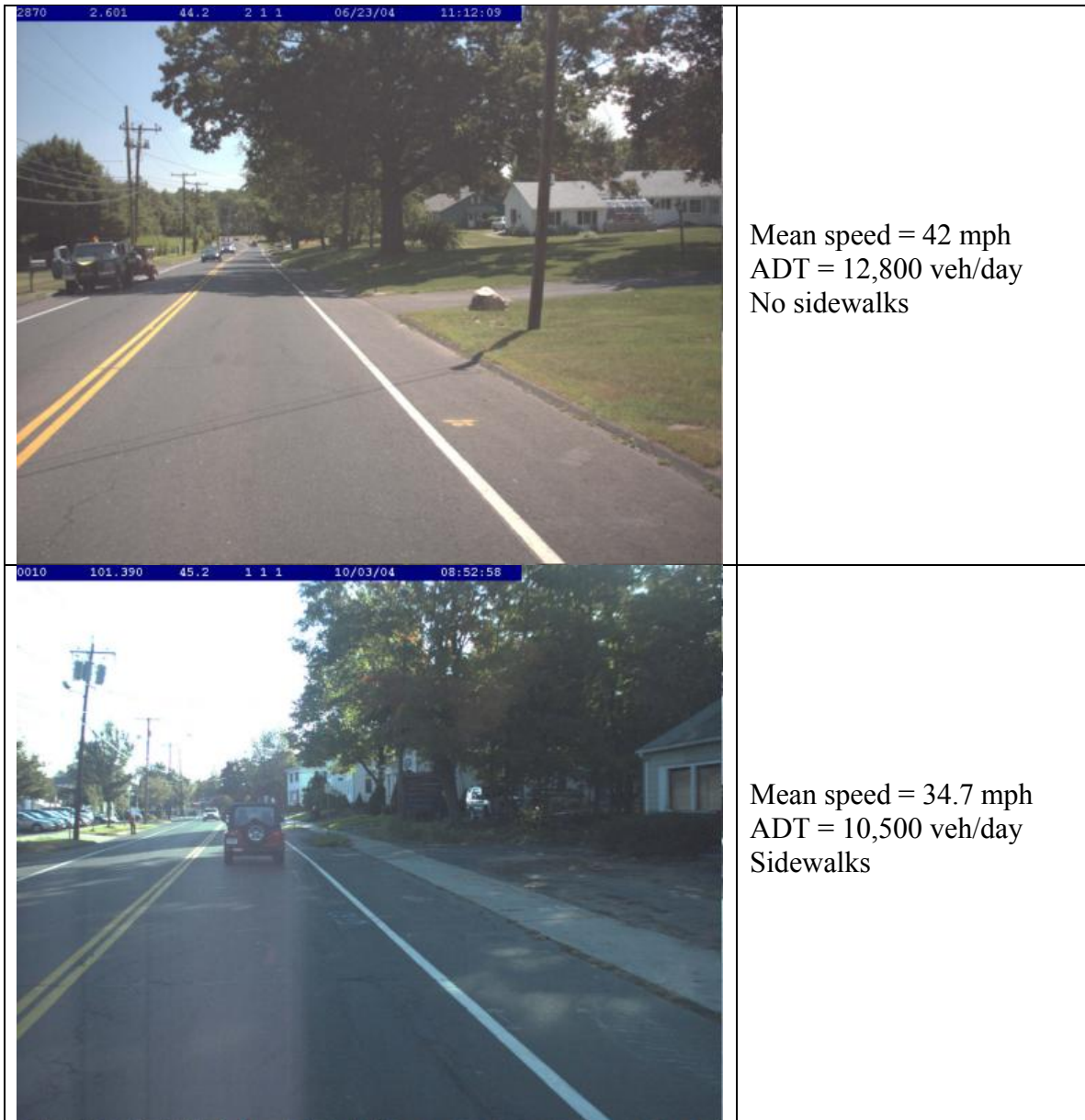
Figure 6-2. Comparison of Running Speed by Presence of Sidewalk

The observed average running speed, AADT and sidewalk status are given next to each photo. The road without sidewalks has a mean speed more than 7 mph higher than the road with sidewalks.