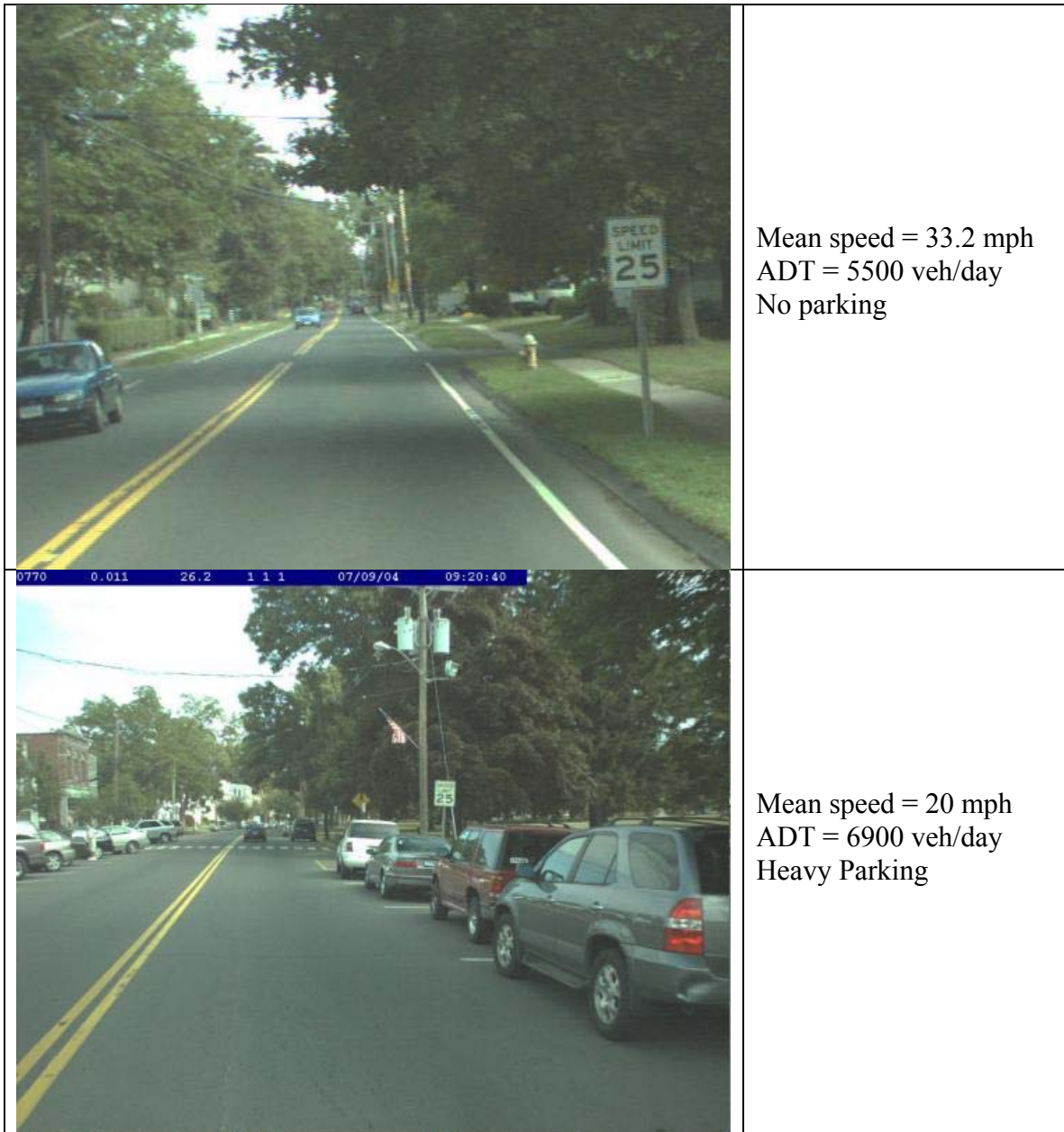
Figure 6-3. Comparison of Running Speed by Presence of On-Street Parking

The observed average running speed and AADT and parking situation are given next to each photo. The section without on-street parking has a mean speed more than 13 mph higher than the section with on-street parking.