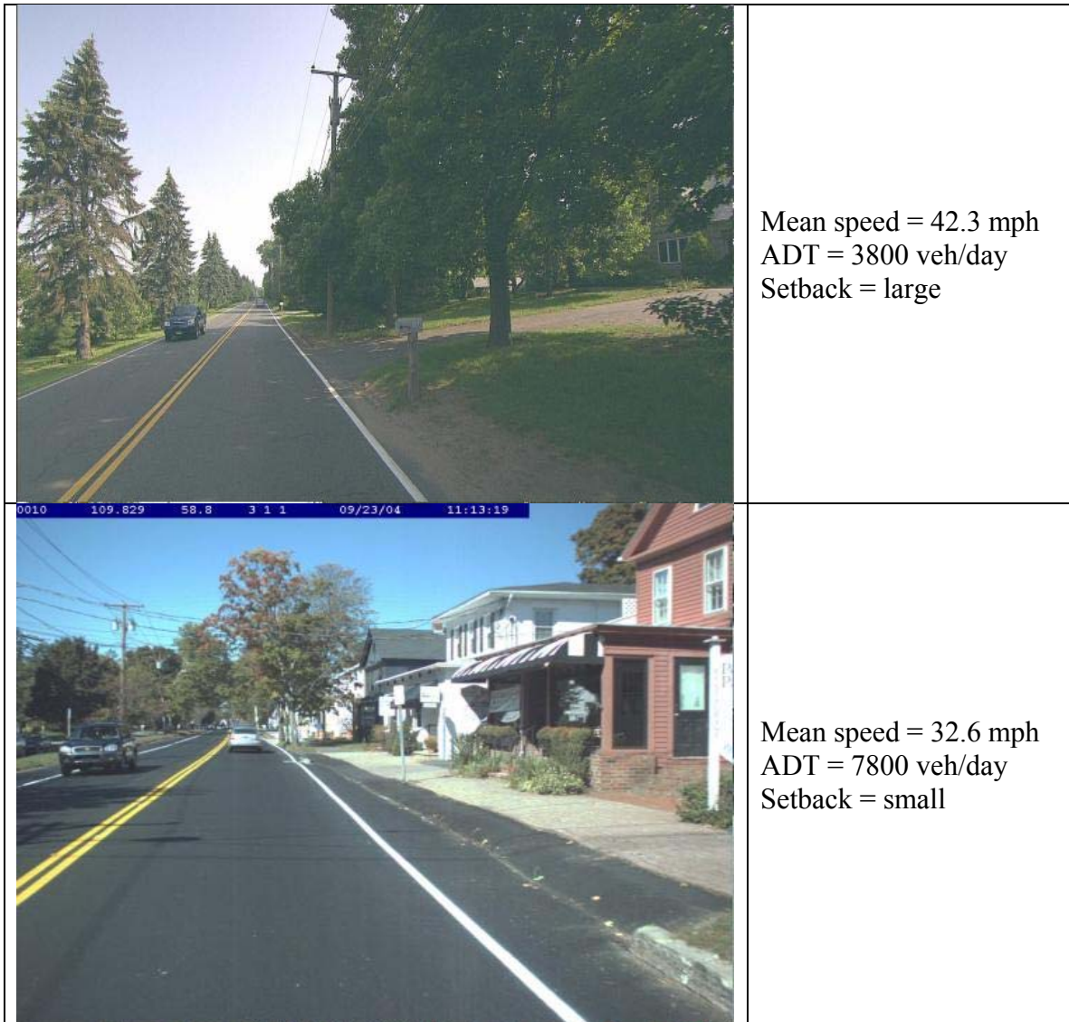
Figure 6-1. Comparison of Running Speed by Building Setback

The observed average running speed, AADT and building setback value are given next to each photo. The road with the large building setbacks has a mean speed almost 10 mph higher than the road with the small building setbacks.