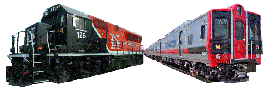
BL20GH DIESEL-ELECTRIC LOCOMOTIVE M-8 AC/DC ELECTRIC-PROPELLED COACH