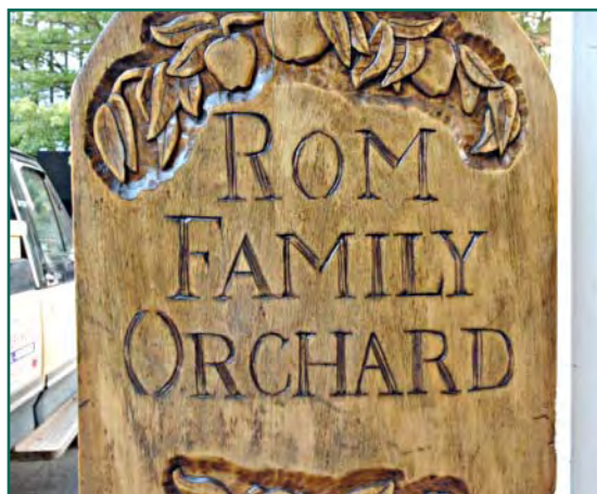
An artistic hand-crafted sign identifies this vendor's spot.

The farmers' market issue of Growing for Market can be downloaded from the website www.growingformarket.com . And Buczynski's new book, Market Farming Success , has an excellent section on farmers' markets. See Additional Resources .