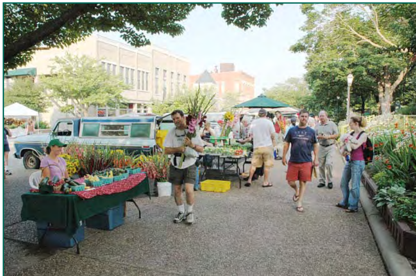
A beautiful location is an advantage.