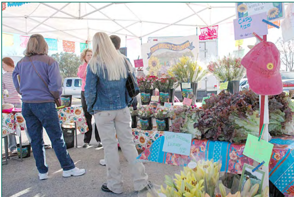
Pop-up tents offer shade for farmers at an Austin, Texas market.