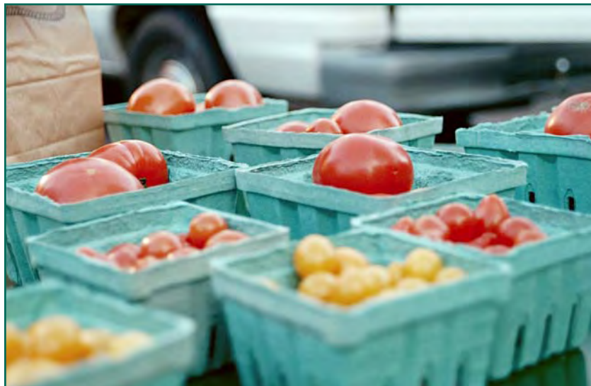
“SalsaFest” tomatoes at the Fayetteville, AR, Farmers’ Market. Everyone is happy when local tomatoes ripen.