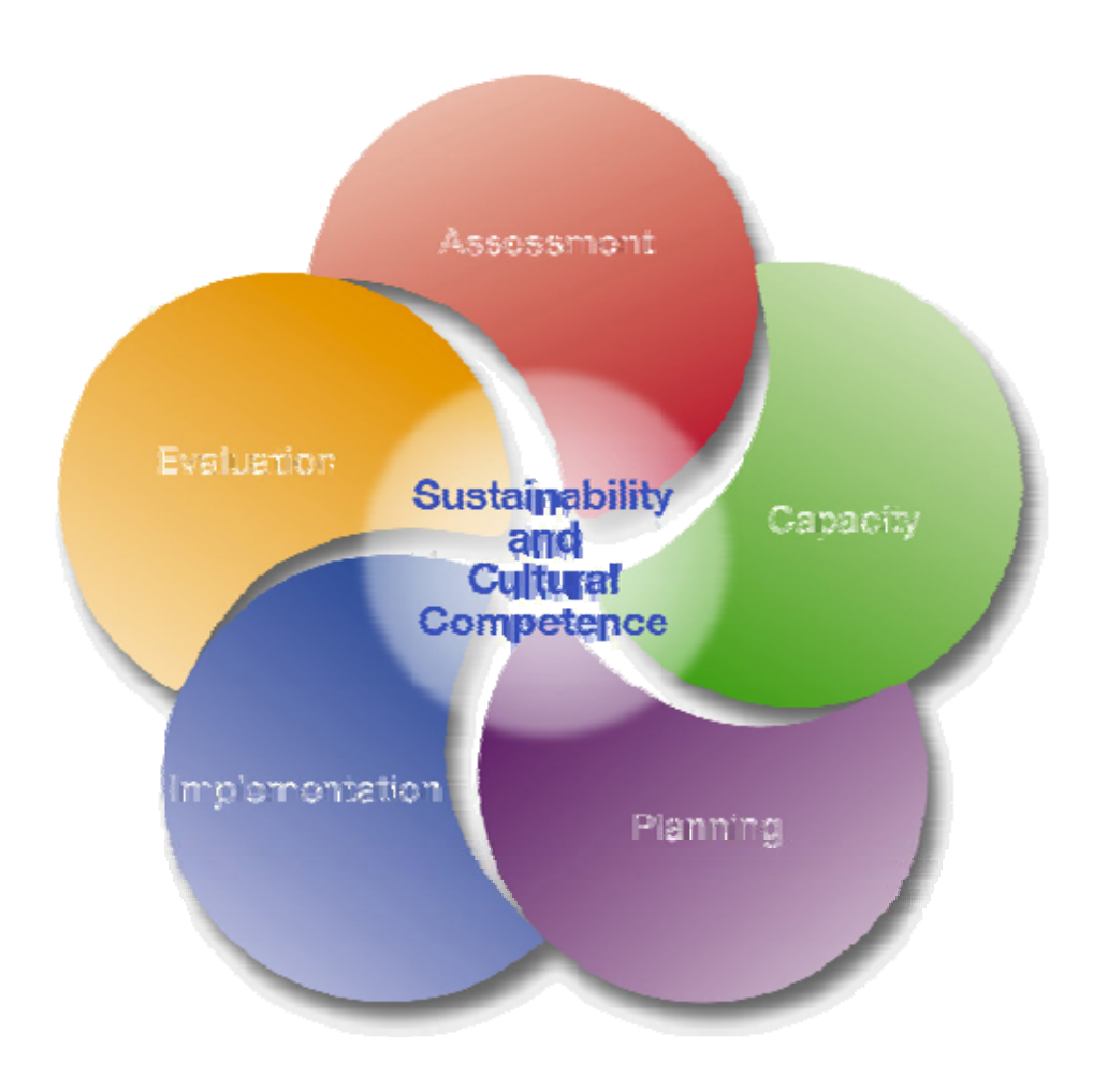
Figure 1. SAMHSA's Strategic Prevention Framework (SPF)

The five steps of the strategic prevention framework require that all elements of successful prevention be done. This includes assessment, capacity building, planning, implementing, and evaluating. Cultural competence and sustainability are integrated into these steps as a way to ensure that the critical aspects of successful programming (e.g., culturally competent activities) are conducted and planned (e.g., sustainability of activities). The image of the SPF-SIG is typically viewed as the following: