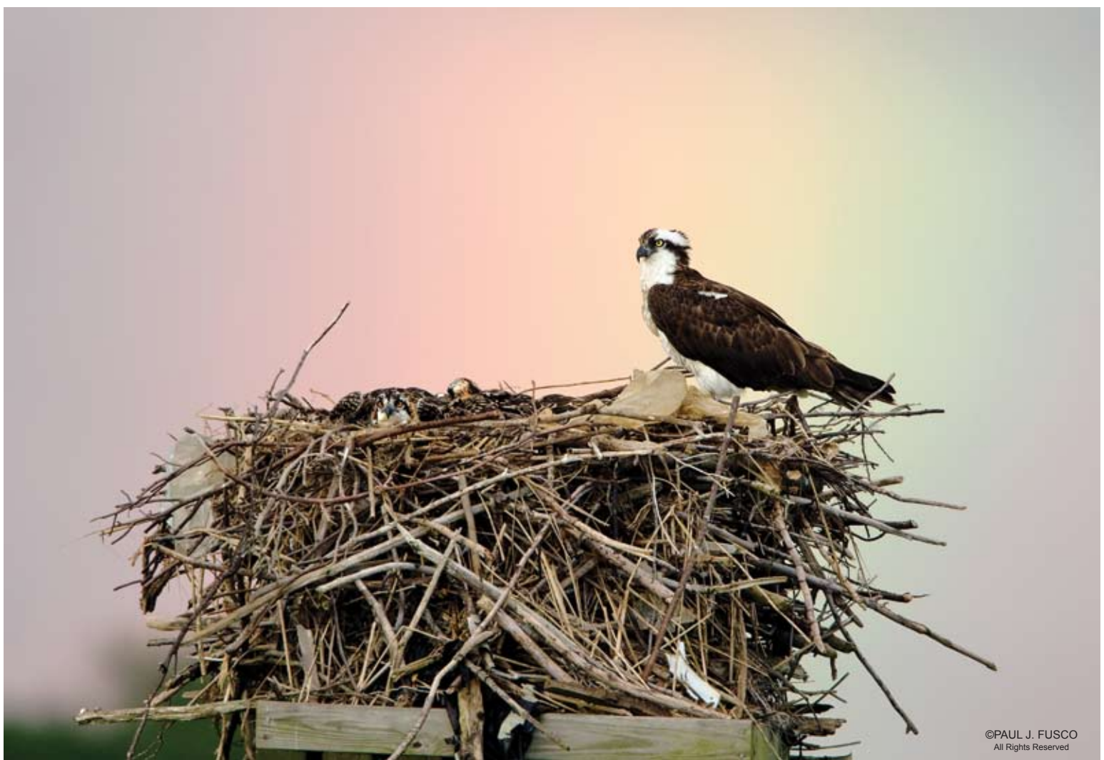
A glimpse into a Connecticut osprey nest shows how ospreys will inadvertently pick up trash when building their nests. Sometimes the trash is picked up as "decorations," but most often it is attached to sticks placed in the nest. Plastic bags, string, ribbon, fishing line, and six pack yokes that end up in nests can often kill or injure the young birds and even the nesting adults.

STANDARD PRESORT U.S. POSTAGE PAID BRISTOL, CT PERMIT NO. 6