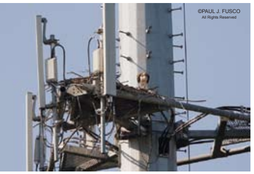
In the 1940s, ospreys built their nests on the ground in Connecticut (top). Today, they use artificial platforms and other structures, including cell towers (bottom).