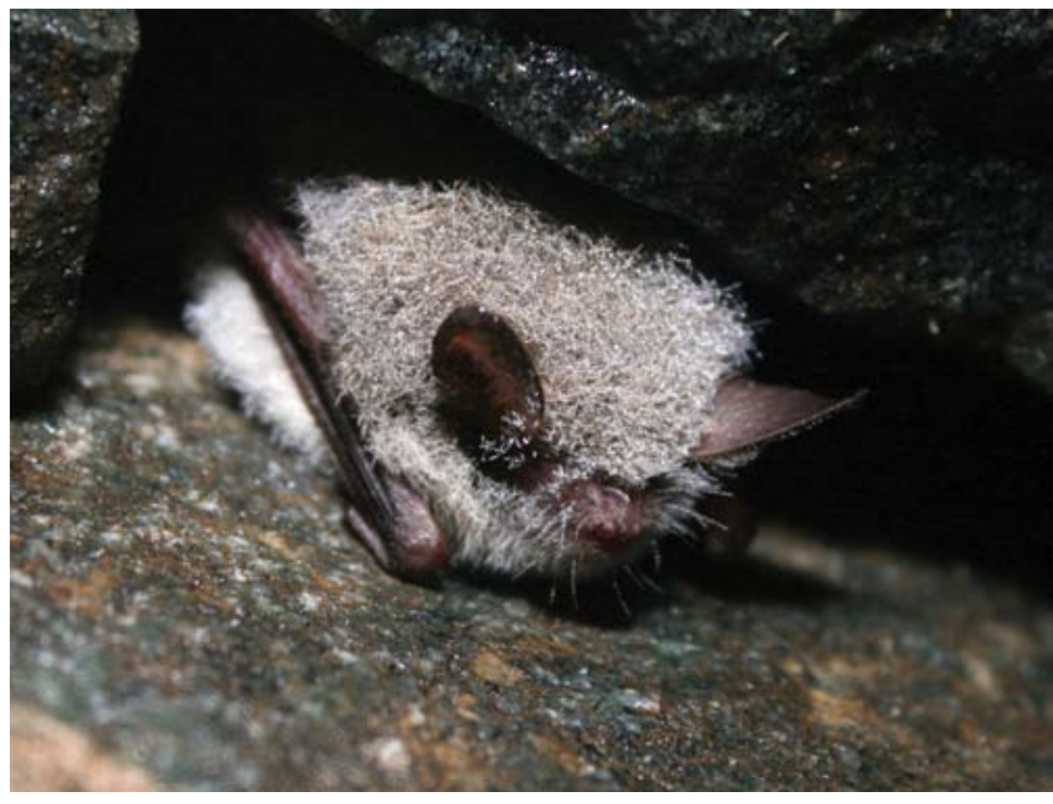
This photograph shows a typical hibernating bat. However, don't be fooled. This little brown bat is covered with water droplets, NOT the fungus associated with white-nose syndrome. The fungus associated with WNS typically appears on the non-furred parts of the bat, including the nose, ears, and wings. Bats periodically wake from hibernation and drink the water that has accumulated in their fur to rehydrate.

You also can go into your attic an hour or so after sundown and look for