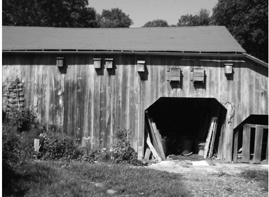
This shows an example of successful bat boxes. The boxes are facing south to maximize sun exposure, resulting in the high internal temperatures bats need to successfully raise pups. The boxes also are placed at the optimum height - approximately 10-15 feet from the ground. The bat boxes are not the only place bats are roosting; the barn also provides a great roost site. Bats have occupied these boxes and the barn for over 20 years!

fungus found on the muzzles, ears, and arms of hibernating bats. Affected bats may not have the fungus, but may display abnormal behavior. The cause for WNS is still being investigated.