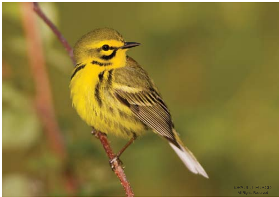
According to data collected during shrubland bird surveys at state wildlife areas, prairie warblers were primarily found in dry shrublands and utility right-of-ways in patchy landscapes.

Many bird species use early successional shrubland habitat at some point in their life, but there is a group of about 40 birds that relies specifically on early successional shrubland habitat for breeding. These are shrubland habitat specialists, and they include state-listed species, such as golden-winged warbler, brown thrasher, and yellow-breasted chat, and other regionally-declining species of greatest conservation need, such as blue winged warbler, field sparrow, eastern towhee,