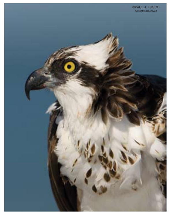
Ospreys can be identified by a ragged crest and a dark mask across the eyes. The eyes in adults are yellow and orange in juveniles. Females have dark streaks on their breast, while males have a clean white chest.

The osprey comeback has gone their through two stages, the banning of organochlorine pesticides and the construction of artificial nest platforms, both leading to a recovering population. A somewhat unexpected third stage in osprey recovery may be taking place today, as range expansion in Connecticut continues. With the building of cell towers in recent years, there has been an opportunity for the birds to further expand their distribution, especially inland. Ospreys seem to have readily adapted to building nests on these tall structures, especially on towers near large bodies of water.