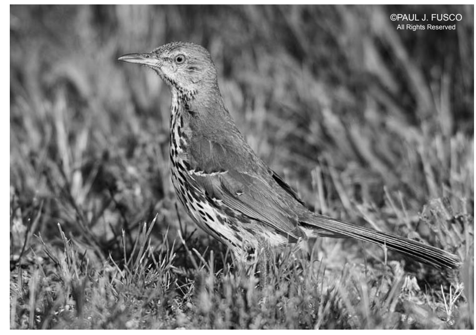
According to Breeding Bird Survey data, brown thrasher (above) and eastern towhee population estimates have declined by over 90% since the 1960s.

Eastern towhee was estimated to occupy 68% of the survey locations. Its habitat preferences were similar to those found in other studies. Towhees were most likely to be found in utility right-of-ways, dry shrublands, and forest clearcuts. They were present more frequently at sites with tree cover between 20-40% and were not completely absent