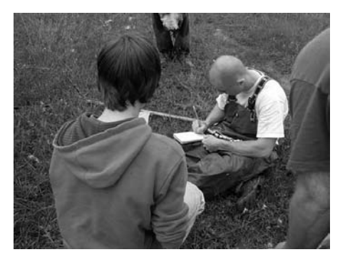
During banding efforts, molting, flightless geese are herded into a netted corral. Leg bands are placed on the geese and information on sex and age are collected. Band numbers for previously banded geese are recorded. All geese are released on site.

from the infested area, new locations are also at risk. To prevent this, infested trees need to be removed as early as possible and, in certain circumstances, high risk trees will be removed. The earlier an infestation is found and reported, the quicker federal, state, and local officials can work together to eradicate this pest. Small infestations are much easier to manage and have less impact on the environment and citizens. Suspected infestations or possible sightings of Asian longhorned beetles should be reported immediately to the CAES at 203-974-8474. Reports can also be submitted to the Asian longhorned beetle New England hotline at 866-702-9938.