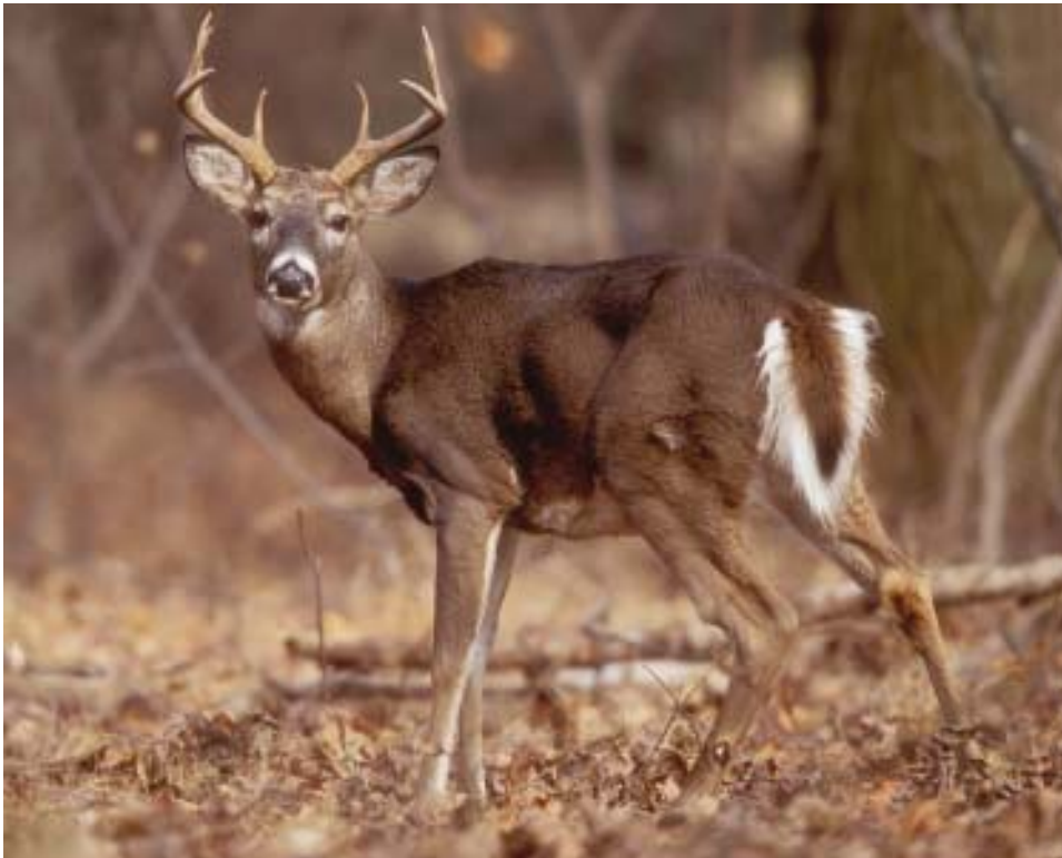
Connecticut's deer population is healthy and harvest rates are expected to be high during the 2004 deer hunting season.