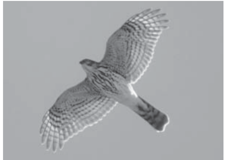
P. J. FUSCO

There are several different types of hawks in Connecticut. The shape of their wings and tails tells them apart. Buteos have long, wide wings and fan-shaped tails. Accipiters have short wings and long tails. Ospreys have long, narrow wings, which make an "M" shape when soaring. Falcons are related to hawks and have narrow, pointed wings and long tails.