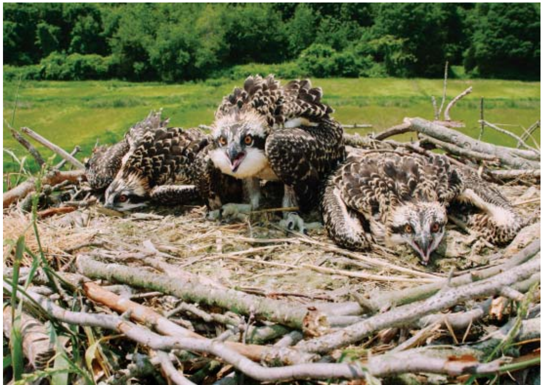
P. J. FUSCO

According to Jerry, a bird is old enough to be banded if the band does not slip over the foot. The two young in the first nest were old enough to be banded and about two weeks