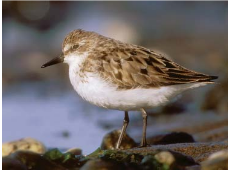
Semi-palmated sandpipers are common along the Connecticut shoreline in late summer. At this time of year, adults have a patchy appearance as they molt into their winter plumage.

These peep sandpipers do not breed in Connecticut and are only found here during migration. One, the Baird’s sandpiper, is only found in the state on its southbound trip in late summer or early fall. In fact, late summer migration is when the biggest numbers of peep sandpipers are found in the state. Large flocks, made up mostly of semi-palmated sandpipers, can be seen gathering at certain shoreline locations, waiting for the right conditions of wind and tide before heading to the next stop in a journey that will take them to South America.