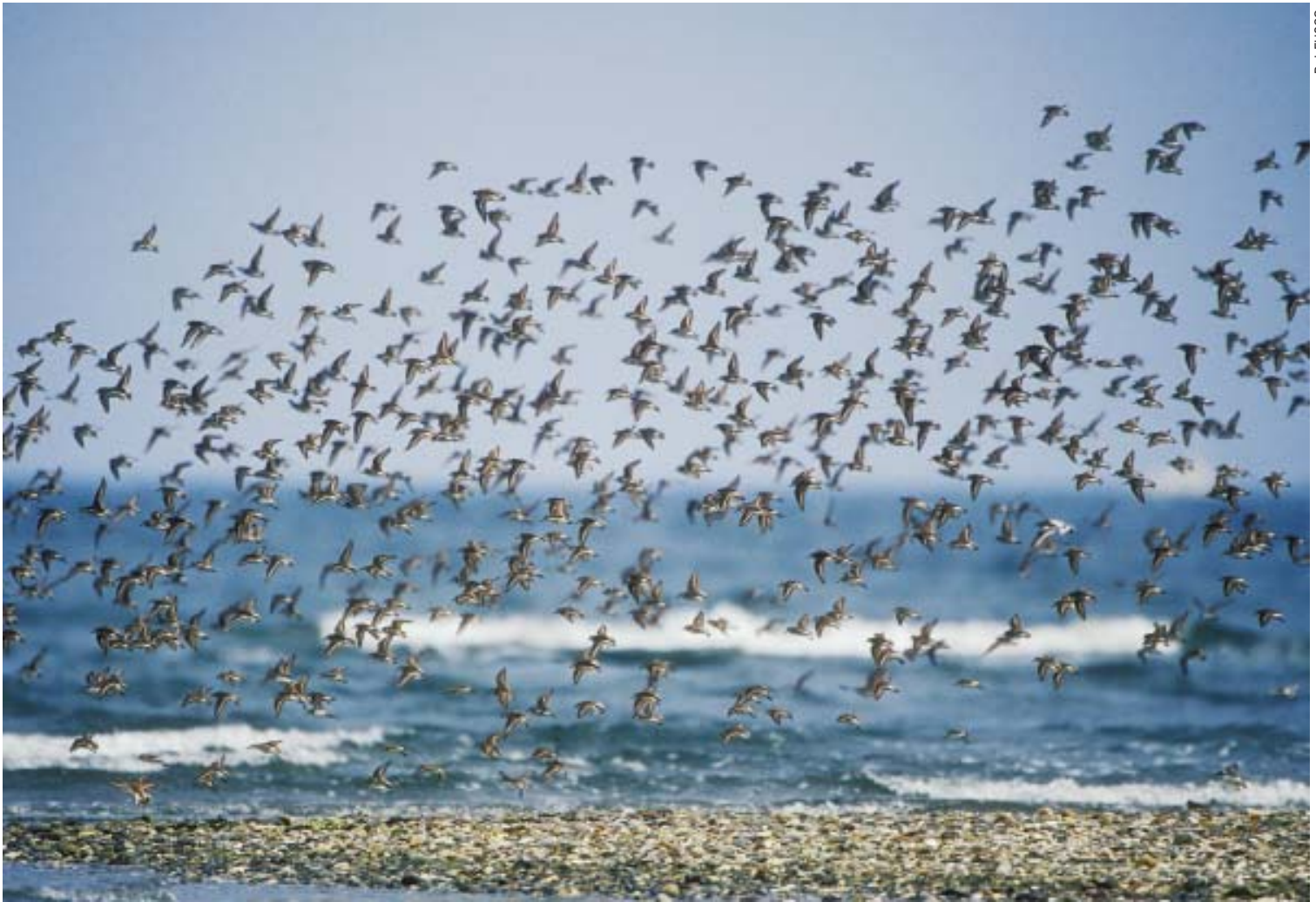
A flock of semi-palmated sandpipers rises from an offshore sandbar along the Connecticut coast. Offshore sandbars and sand spits are important habitats for migrating shorebirds which depend on these areas for food and rest.

Bureau of Natural Resources / Wildlife Division Connecticut Department of Environmental Protection 79 Elm Street Hartford, CT 06106-5127