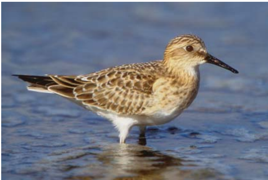
An overall buffy appearance, long wing tips that extend beyond the tip of the tail, a slightly curved bill, and a strong scaly feather pattern on the back are characteristic of a juvenile Baird’s sandpiper.

Because most shorebird species, especially the “peep” sandpipers, appear similar in color and form, using such traits to identify them can be very difficult.