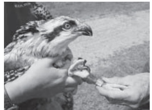
A silver U.S. Fish and Wildlife Service band, that has a unique, identifying number, is attached to the left leg of young ospreys.