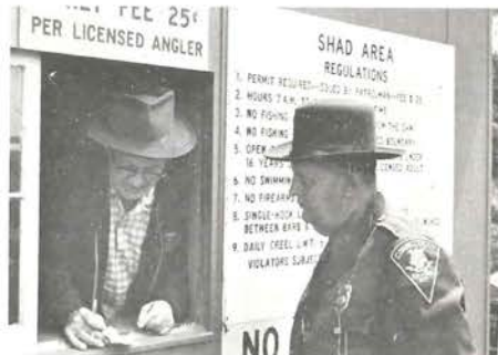
Next a visit to the patrolman's shack at the State-controlled area to check up on previous days' angler success and listen to a few problems.