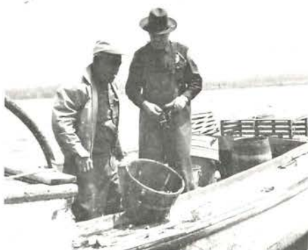
After several more pulls, some lobstermen are checked. They come in all varieties; old-timer—