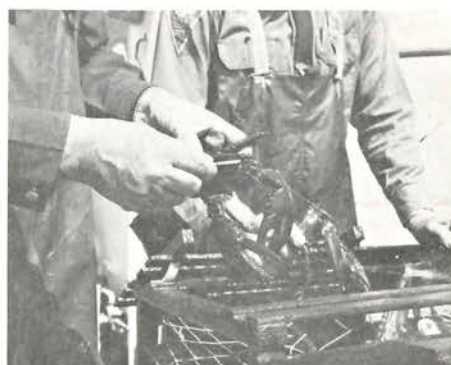
If the gauge shows 3\frac{3}{16} inches measured parallel to the center line from the rear of the eye socket to the rear of the body shell, it's legal size.