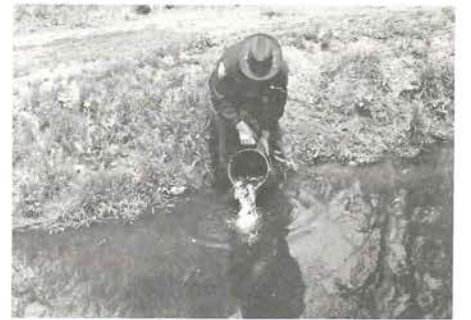
Lunch out of a black box and brown bag was next, and then we headed for a noon meeting with the hatchery truck. Several small streams were on the day's stocking schedule.