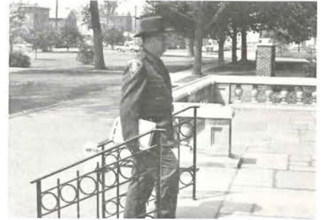
Frequent court visits, to testify or check on impending cases are necessary, but this one took only about 15 minutes.