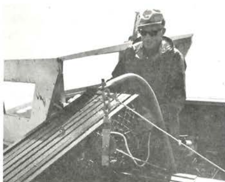
—or one of the majority of lobstermen operating in Connecticut waters who consider this activity a part-time business-hobby combination.