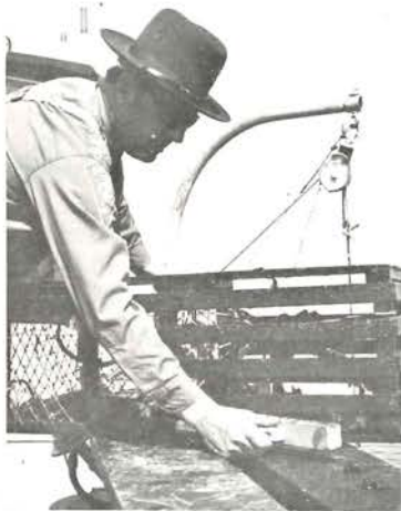
—checked for legal escapement openings—