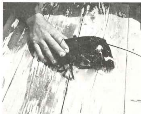
Checking in with a commercial distributor at the MIJOY dock we are informed of a tagged lobster taken. Tagging is a method applied by the Board to check growth and movement of these "bugs."