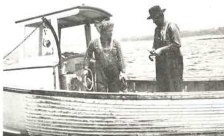
—young, but professional, and an old hand at the business—