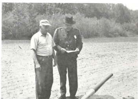
A corn farmer in Windsor, with 83 acres, has applied for a permit to use scare devices to discourage birds, and checks out O.K.