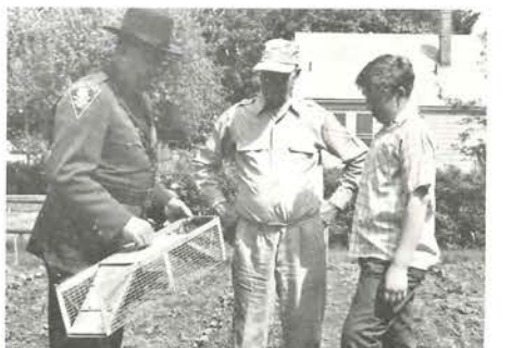
On the trip home, time left for a small detour to loan a live trap to a pair of amateur farmers with racoon problems.