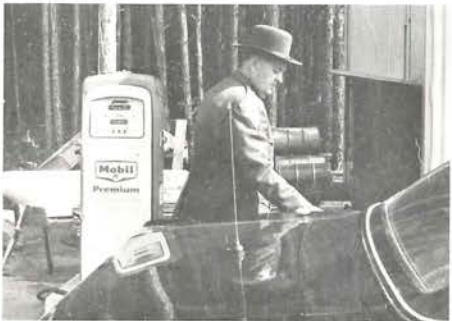
First stop is District II Headquarters in Farmington, to gas up—