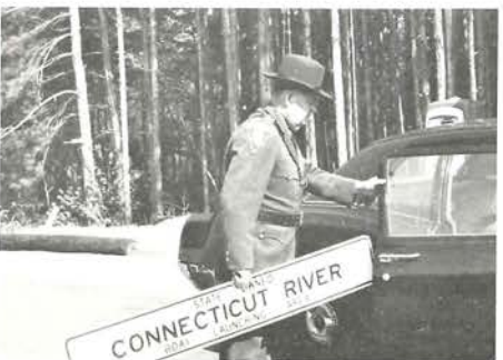
—and to pick up a sign to replace one that has disappeared.