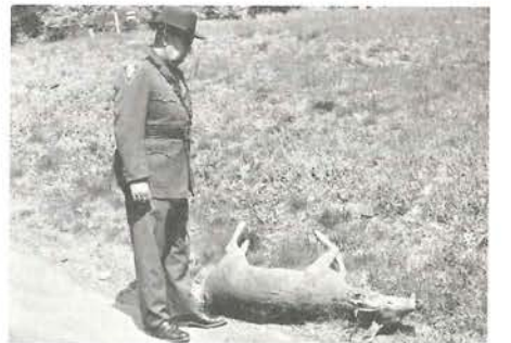
At about 3:00 p.m. a call comes over the air describing a deer-car accident.