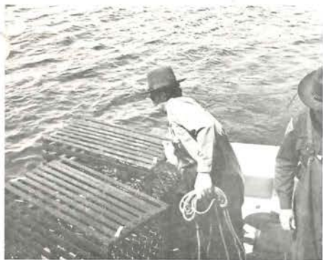
Starting fairly close to the Waterford shore, a pair of pots are hauled for inspection,—