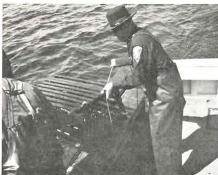
—and being found properly built and identified, returned to their jobs.