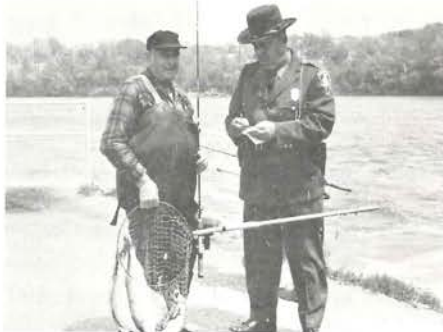
After replacing the sign, and while at the Suffield area on the Connecticut River we stop to check anglers at the Enfield dam, including this one with an early limit of six nice roe shad.