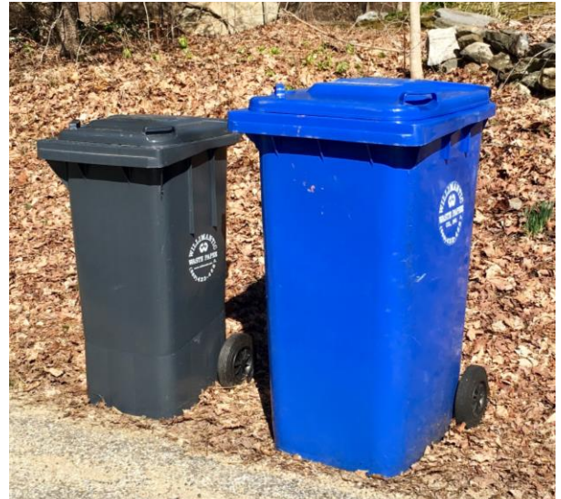
Mansfield’s variable sized carts, 20 gallon trash and 65 gallon recycling