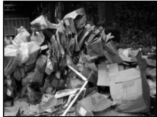
Illegally disposed corrugated cardboard and mixed waste

Throwing recyclables in the trash has negative impacts on air and water quality and wastes energy and natural resources. Diverting reusable materials from the waste stream through recycling results in extraction and processing of fewer raw materials and reduces the amount of waste that must be landfilled or incinerated.