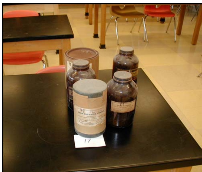
Figure 3 – Lab chemicals are separated by chemical type