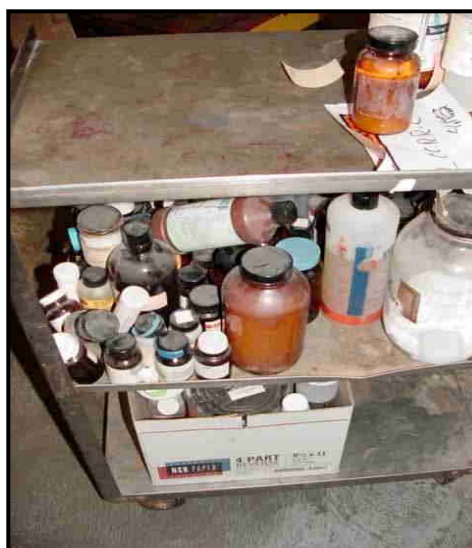
Figure 2 – Lab Chemicals seperated by teacher to be removed