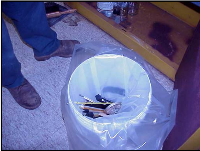
Figure 5 - Mercury containing lab instruments are placed into a lined container meeting all Department of Transportation requirements