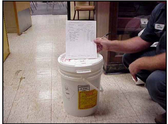
Figure 6 - A packing list is generated that lists all the contents of a shipping container.