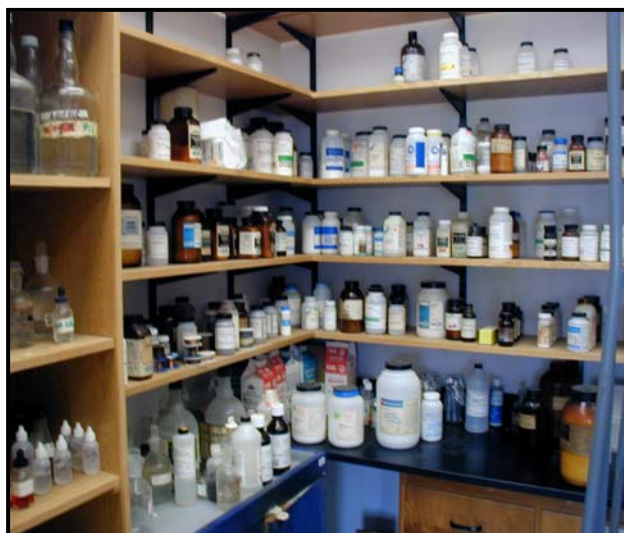
Figure 1 – Lab Chemicals on the shelf waiting to be sorted