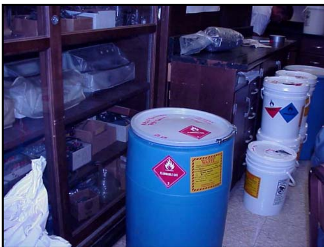
Figure 7 - Chemicals are packed into 5 gallon pails or 55 gallon drums. The drums are then sent off for recycling, fuels blending, or secure landfilling.