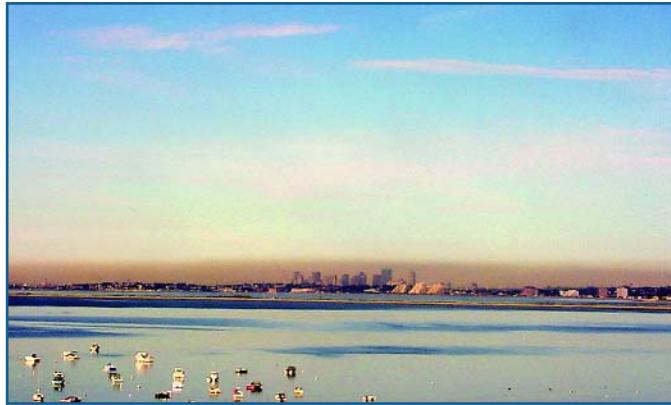
Particles contribute to haze, such as this brown haze over Boston.

A irborne particles, the main ingredient of haze, smoke, and airborne dust, present serious air quality problems in many areas of the United States. This particle pollution can occur year-round—and it can cause a number of serious health problems, even at concentrations found in many major cities.