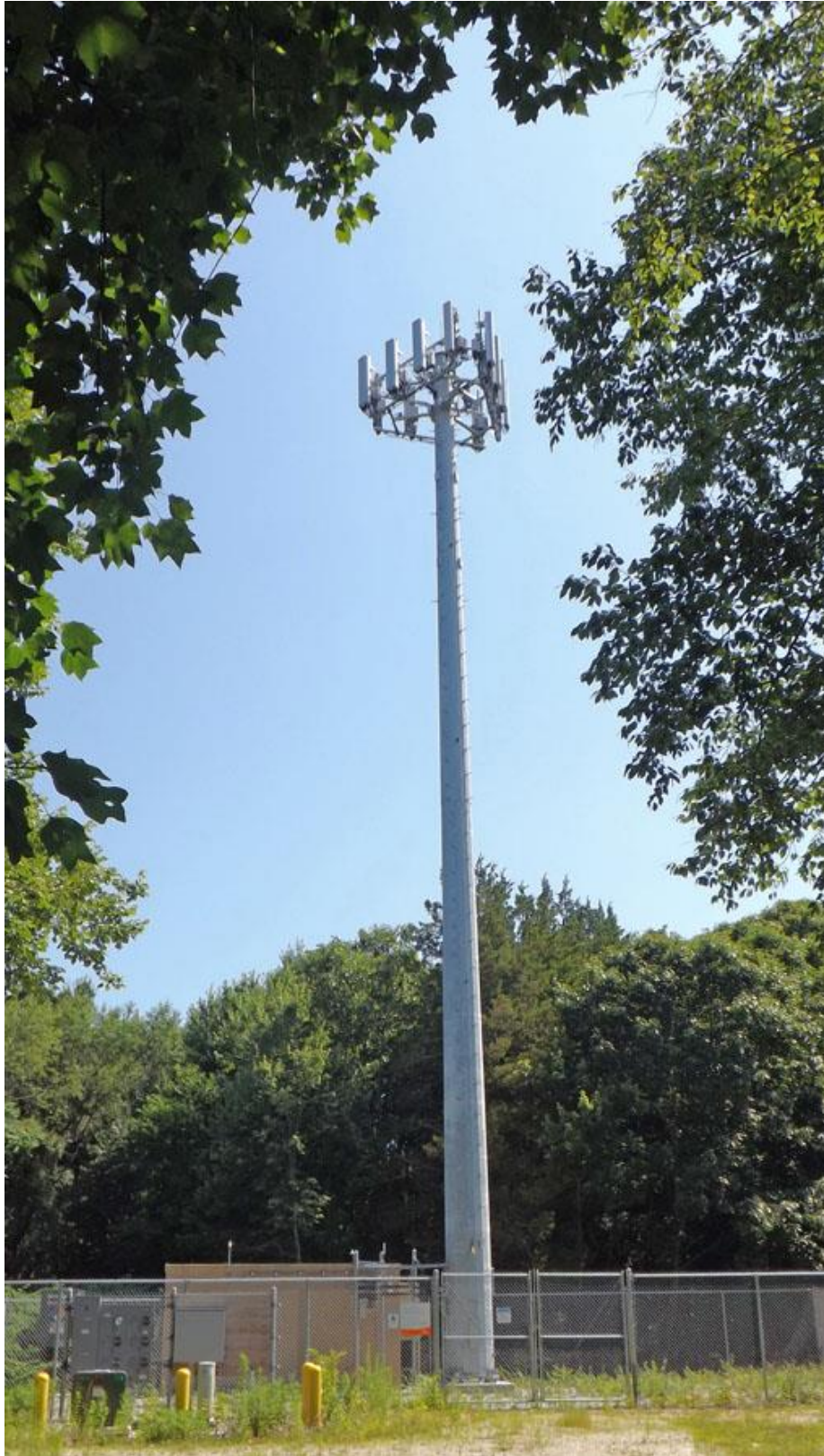
View of tower