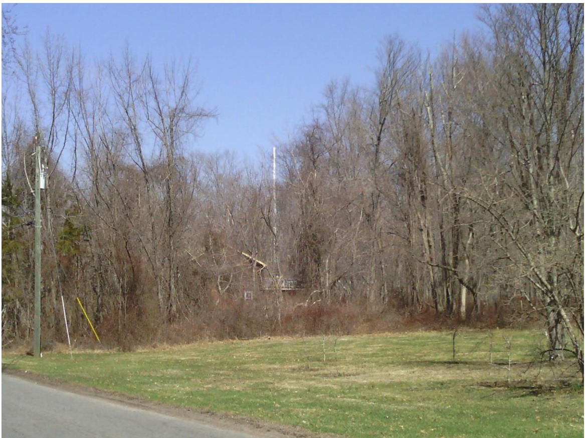
View of tower from Great Oak Lane, 0.17 miles to southwest.