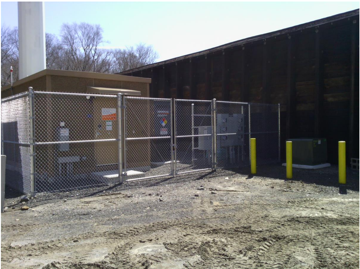
Compound view – west side.