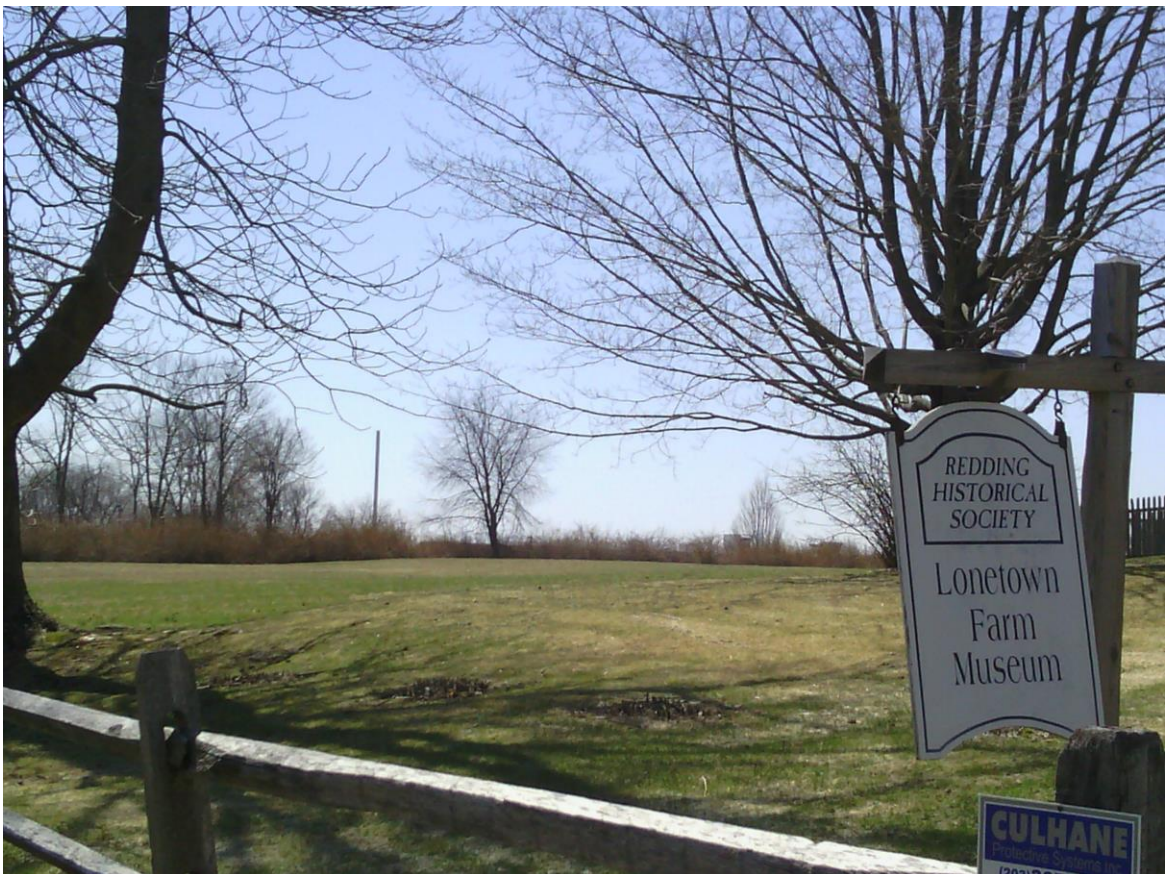
View tower from historical property on Route 107, 0.3 miles northeast of site.