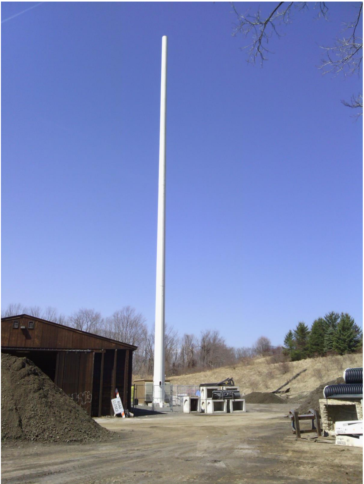
Facility location behind wood storage building. Note earthen slope to right that blocks views of the compound from school and residential property.