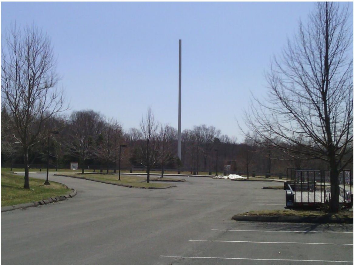
View of tower from school property, 0.16 miles north of site.