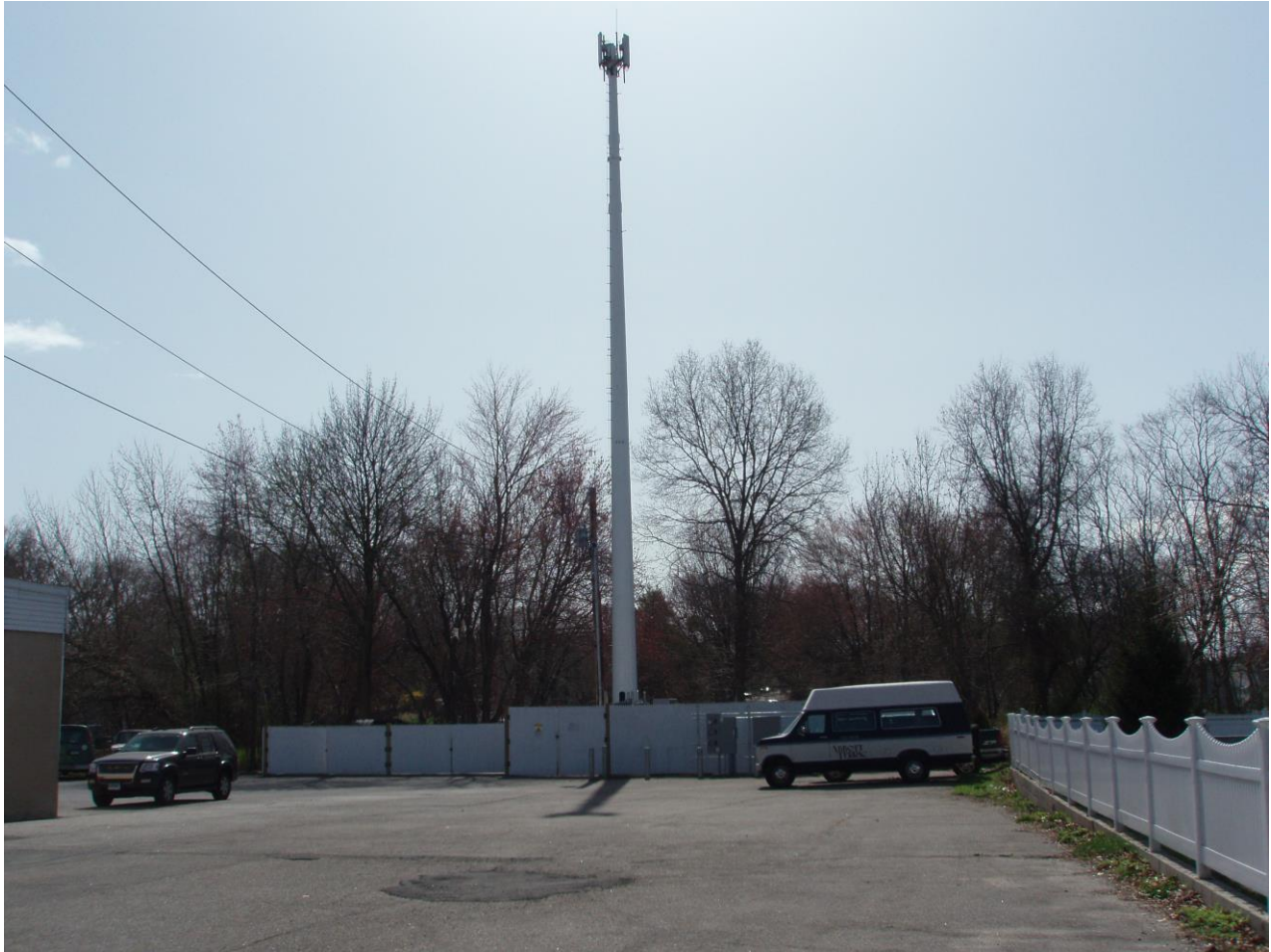
Site view from Stonybrook Road. Commercial plaza is to left, property line to right (white fence)