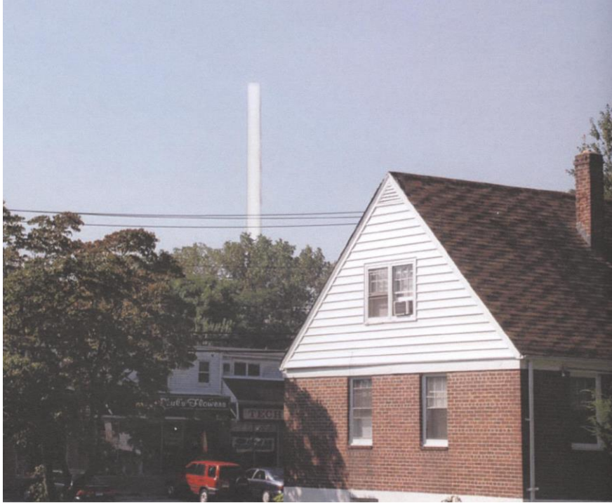
Predicted view of tower from Stonybrook Road and Broadbridge intersection, 380 feet northeast of site.