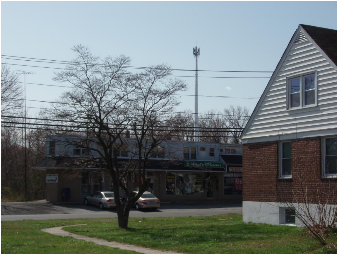
Actual view of tower.