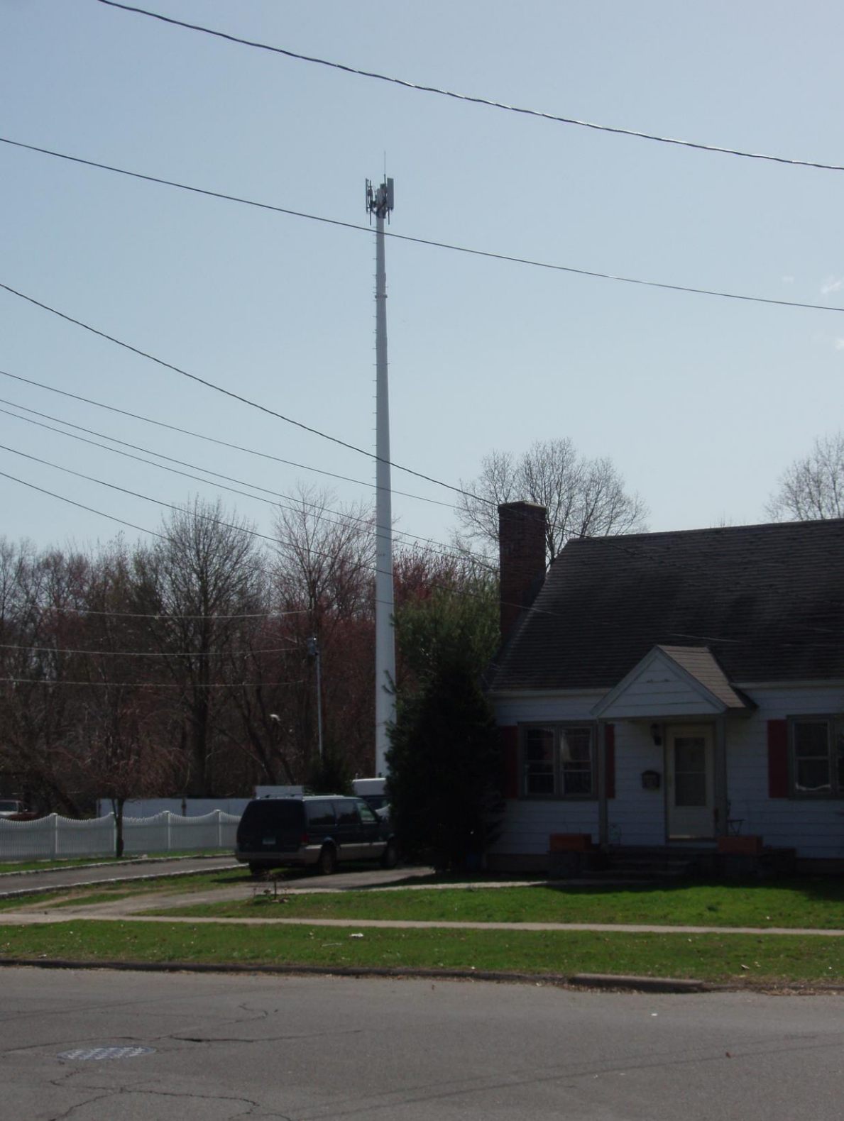
View of site from Stonybrook Road at Eaton Street. Houses are located across the street and one house is behind the white house in the photo above. The plaza is to the left, out of view.