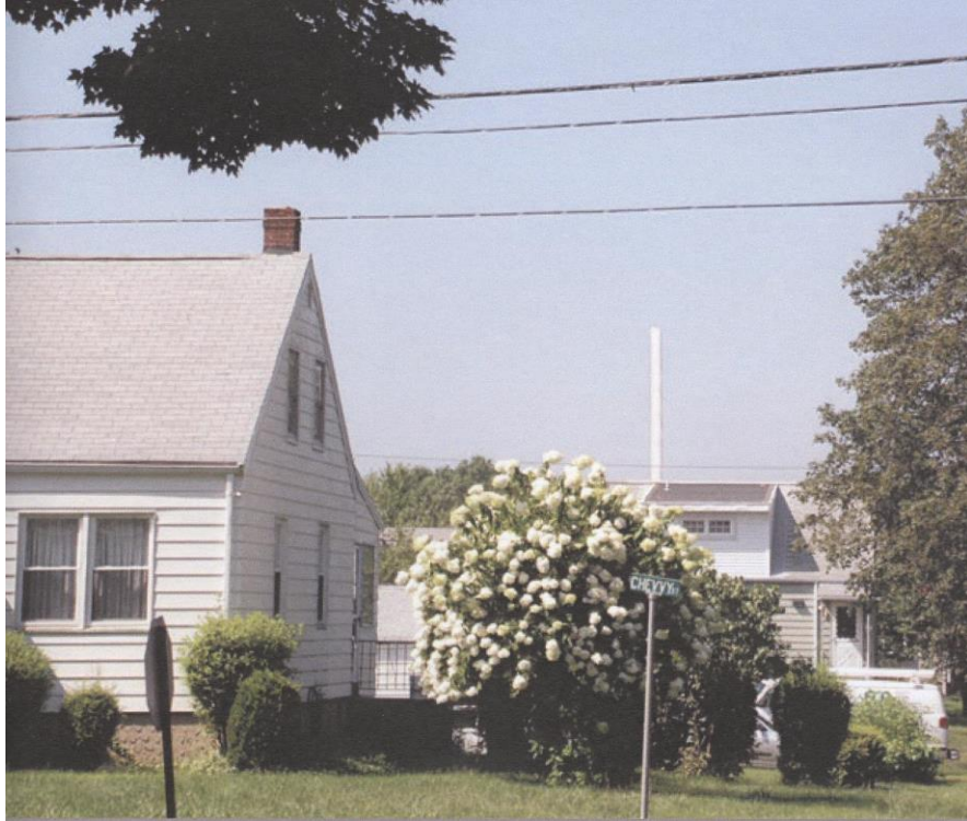
Predicted view of tower from intersection of Marcroft Street and Chevy Street, 900 feet east of tower.