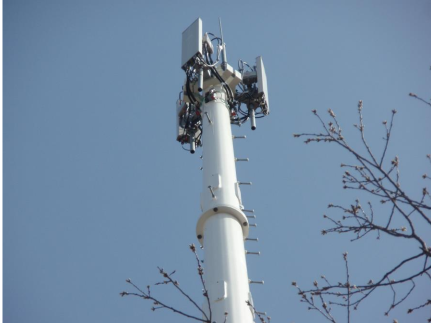
T-Mobile's antenna installation