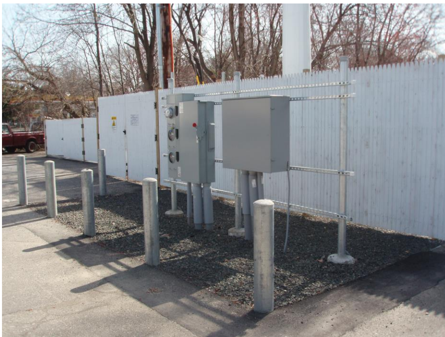
Utility board with bollard protection. Fenced area to far left is for plaza trash bins.