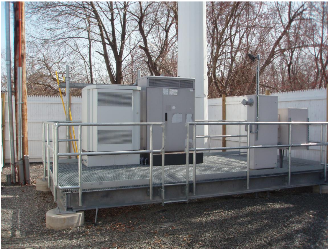
T-Mobile's radio equipment