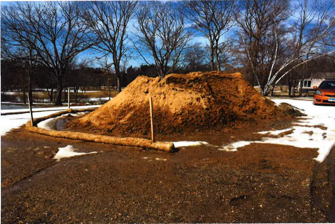
Photo 5: View of material storage pile with maintained perimeter controls.