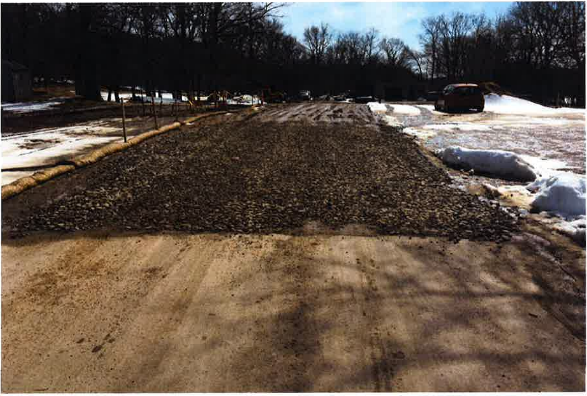
Photo 1: View of tracking pad at construction entrance off Folly Lane.