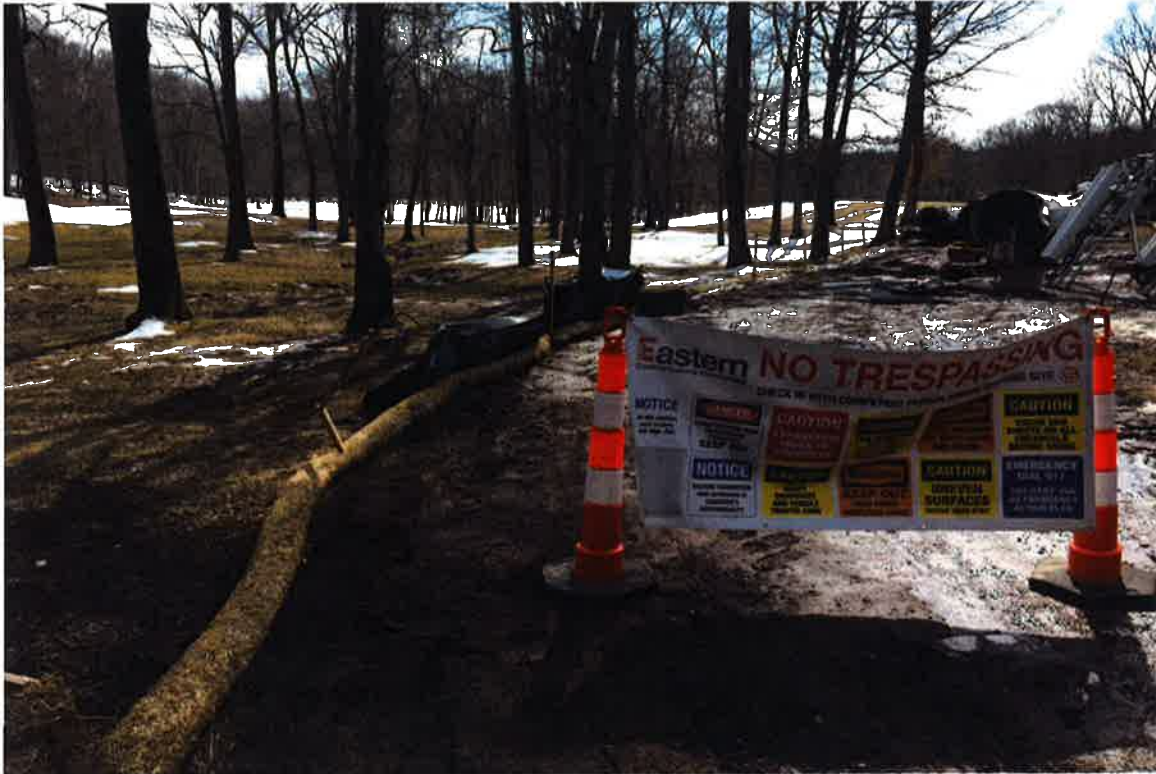
Photo 7: View of decommissioned access road by bulk storage bins and reinforced perimeter controls mid-installation.