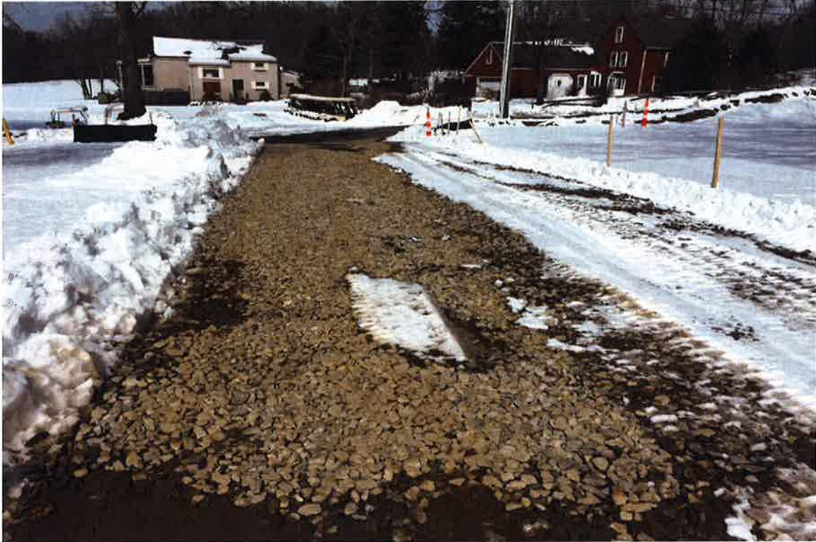
Photo 1: View of tracking pad at construction entrance off Folly Lane.