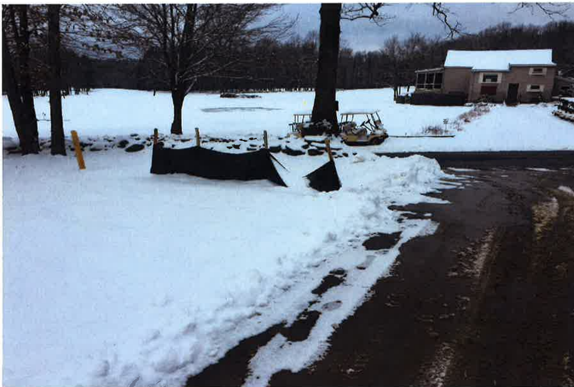
Photo 1: View of erosion controls at construction entrance off Folly Lane.