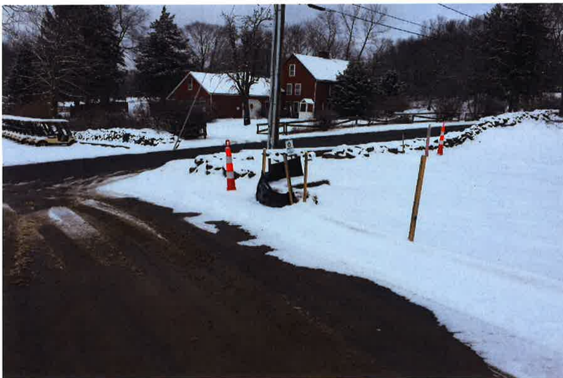
Photo 2: View of erosion controls at construction entrance off Folly Lane.