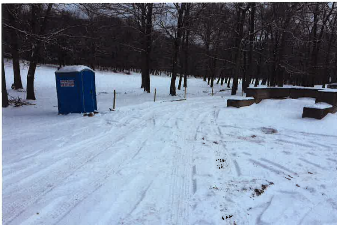
Photo 4: View of preexisting washout location by bulk storage bins.