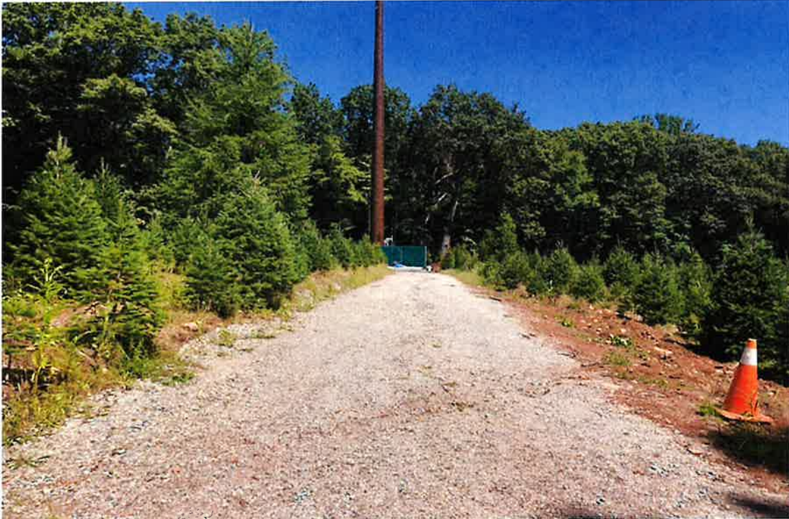
Photo 1: View of completed access road with tower in background and silt fence removed along edges of road.