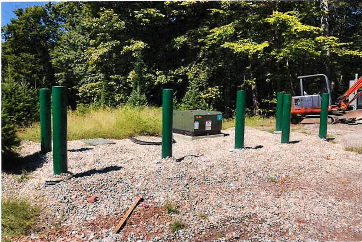
Photo 3: View of completed utility work area with silt fence removed.