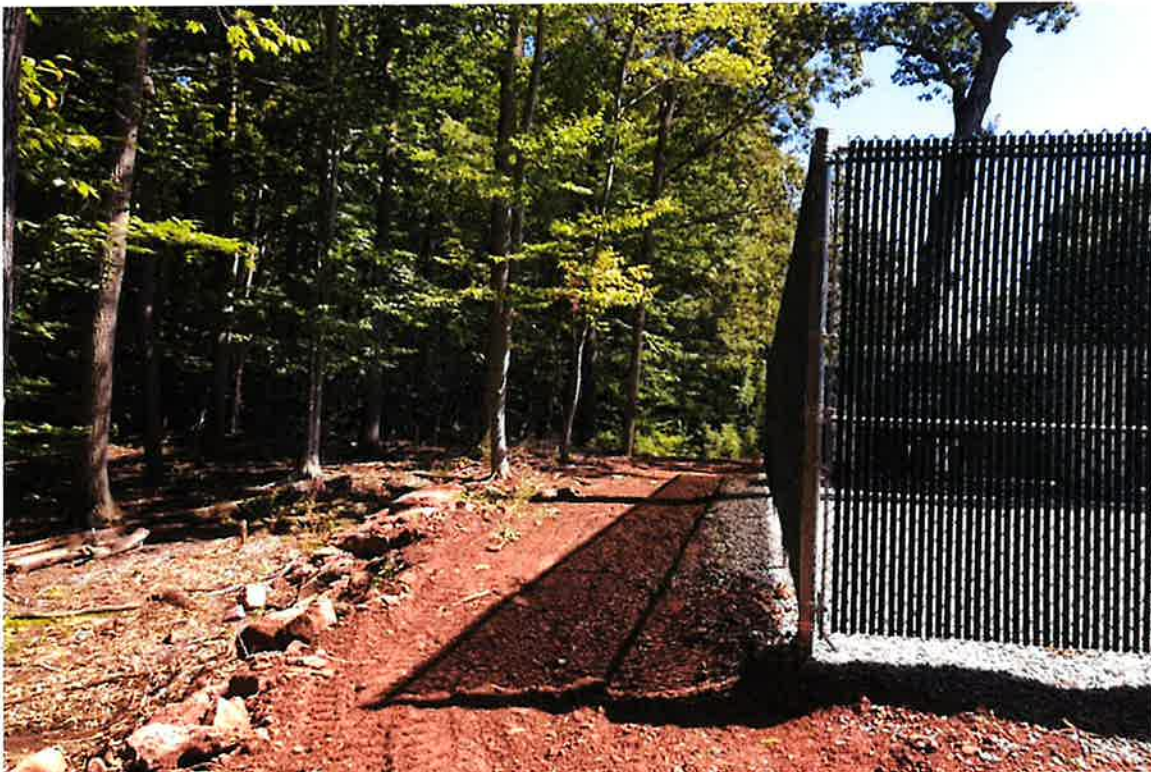
Photo 2: View of edge of completed compound area with silt fence removed.