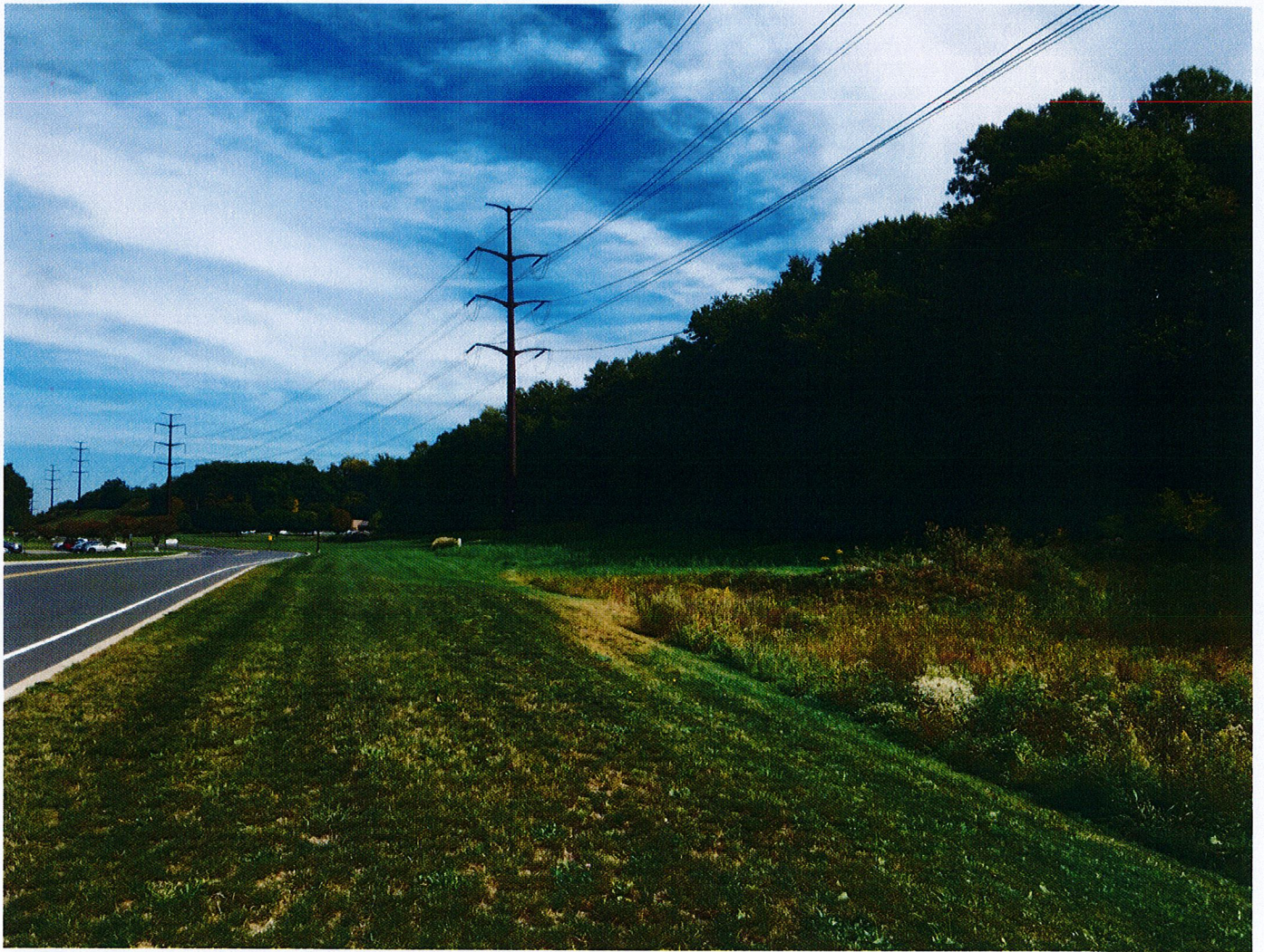
View looking north from Berkshire Blvd., Berkshire Industrial Park, Bethel, CT