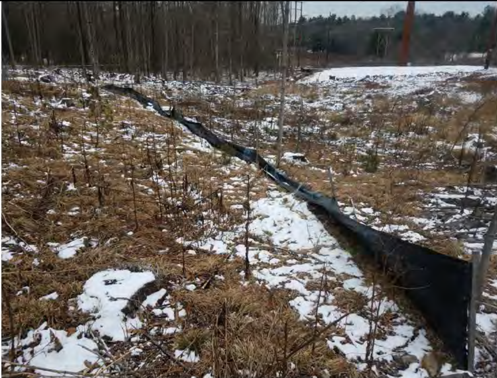
Photo 7: 02/01/2018, Harwinton: Map 35, below Str97 and upland of W-G1/S-G3, silt fence repairs needed. No visible indications of ground movement observed at this time and full veg growth present. Area appears stabilized and silt fence may be removed if work in the upland area has been completed.