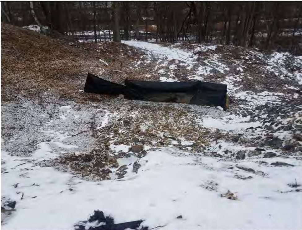
Photo 4: 02/01/2018, Watertown: CORRECTIVE ACTION: Map 01, Str1A pad, failed silt fence off of the pad upland of the Connecticut Designated Wetland. Failure reported in Biweekly Report #30 dated 1/26/2017.