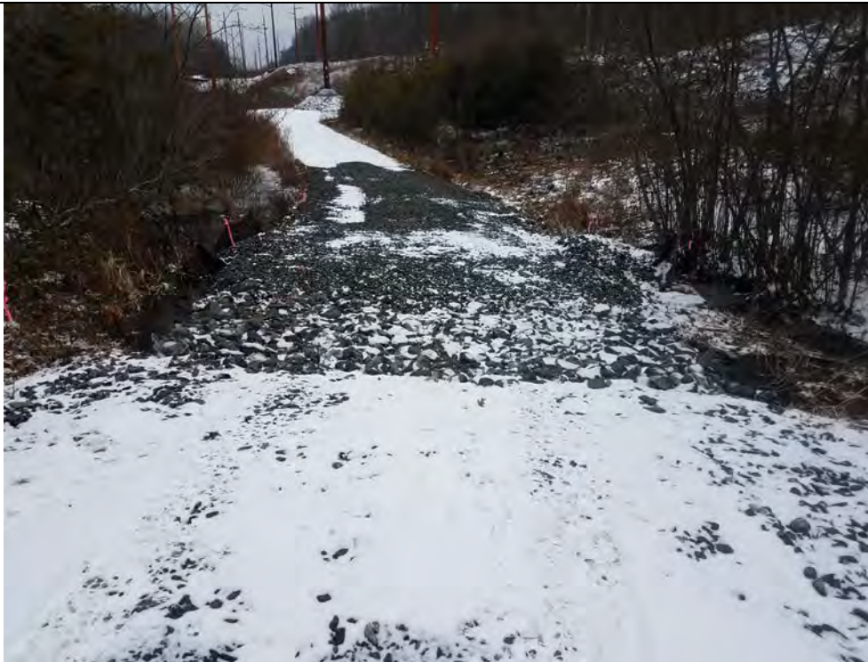
Photo 2: 02/01/2018, Thomaston: Map 25, Hard bottom crossing restoration at S-E3 completed.