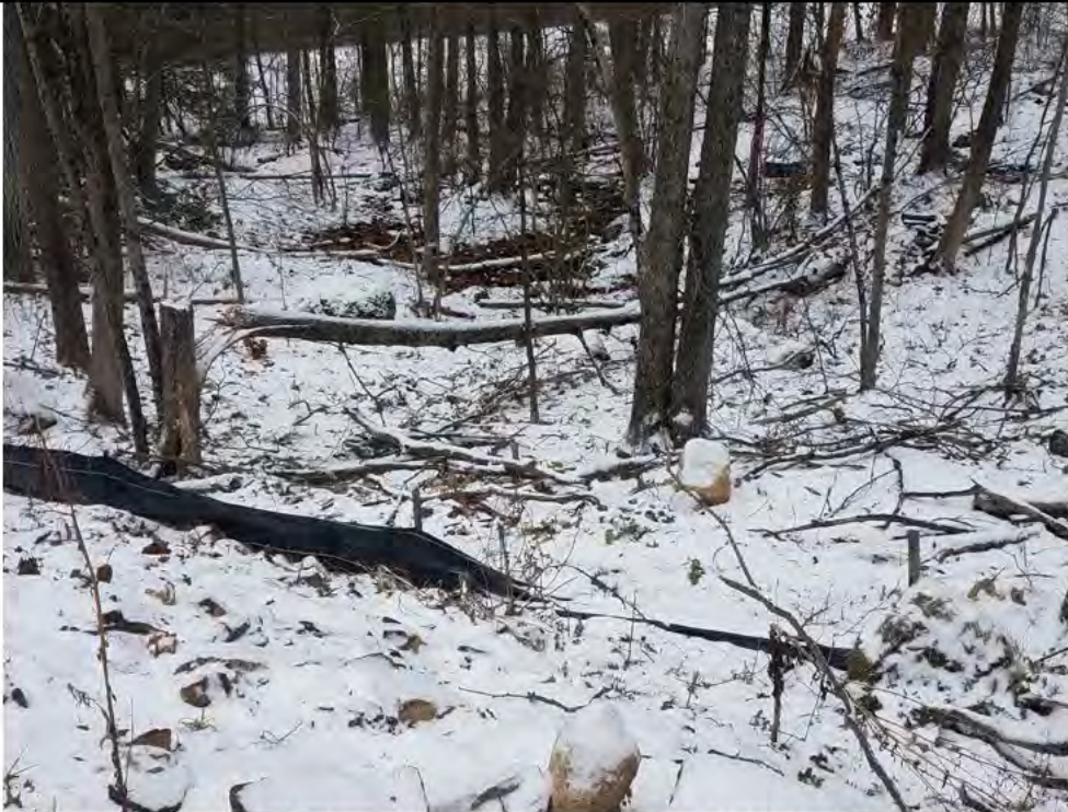
Photo 5: 02/01/2018, Thomaston: Map 24, toe of pad at Str69 upland of W-D14, silt fence repairs needed. No visible indications of ground movement observed at this time.