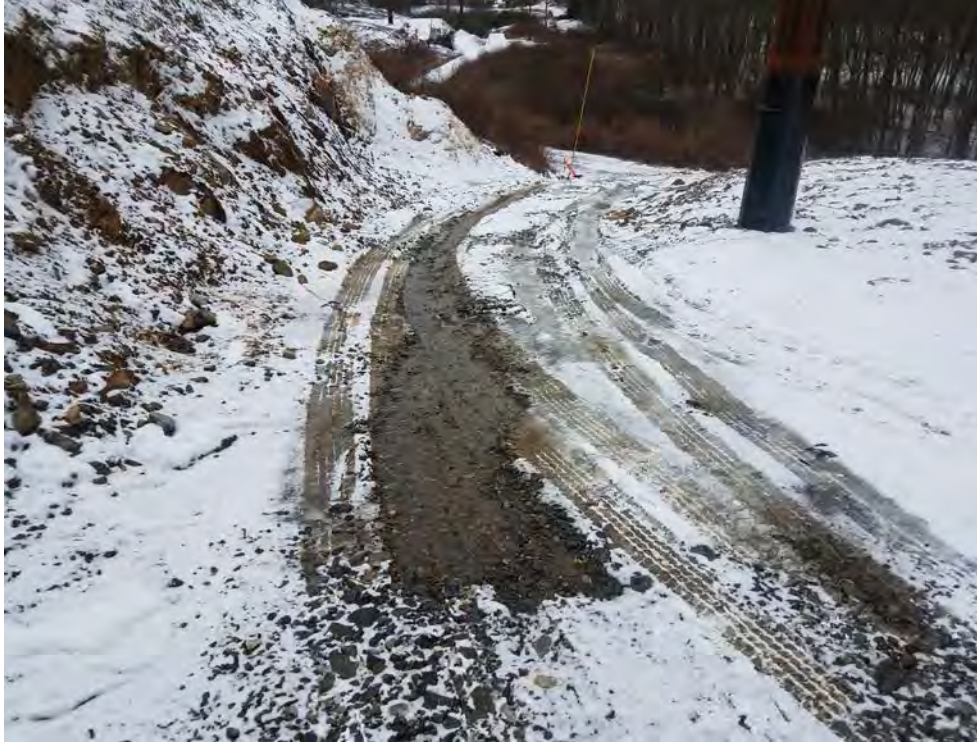
Photo 1: 02/01/2018, Litchfield: Map 26, ice sheet and visible rills on the access road below Str73 down to wetland W-E2, runoff from upland drainage and from the pad for structure Str73.