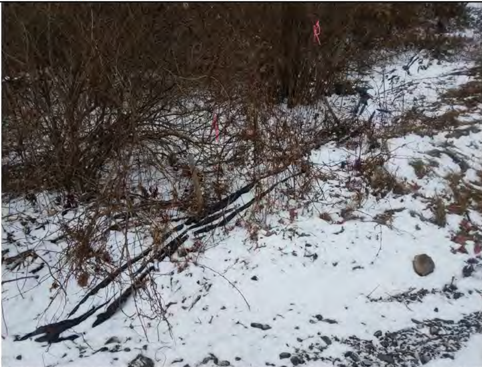
Photo 8: 02/01/2018, Harwinton: Map 35, between Str97 and Str96, silt fence line butting W-G1/S-G3 and the access road, silt fence repairs needed. No visible indications of ground movement observed at this time and veg growth present.