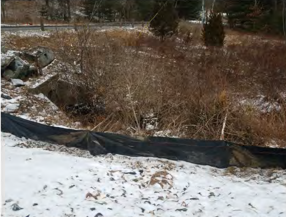
Photo 3: 02/01/2018, Watertown: CORRECTIVE ACTION: Map 01, Str2 pad, failed silt fence at toe of slope abutting S-A1 repaired. Failure reported in Biweekly Report #30 dated 1/26/2017.