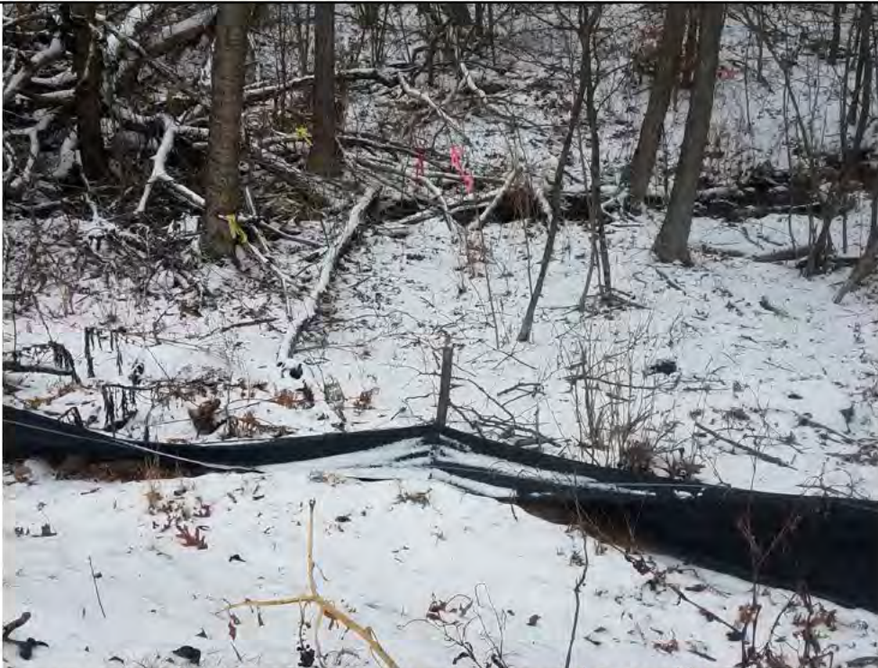
Photo 6: 02/01/2018, Thomaston: Map 25, toe of pad at Str71 abutting W-E2/S-E3, Minor silt fence repairs needed. No visible indications of ground movement observed at this time.