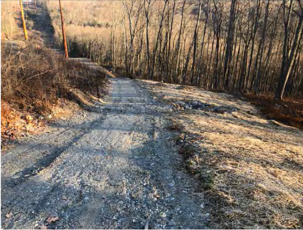
Photo 1: 12/07/2017, Thomaston: Map 24, Str69, rills on access road.