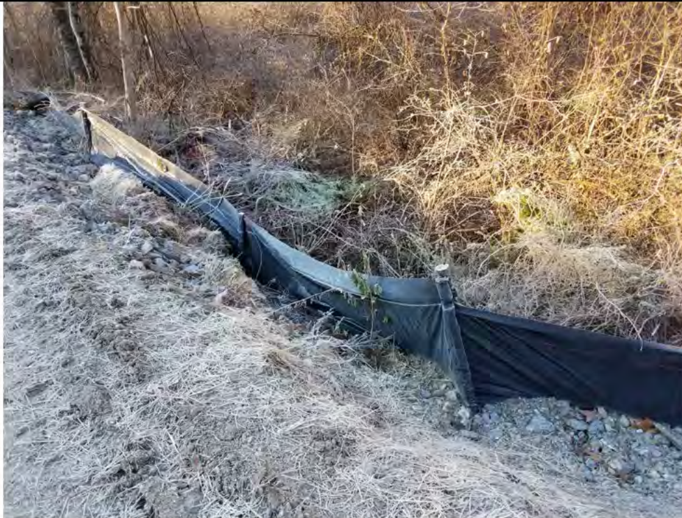
Photo 3: 12/07/2017, Harwinton: Map 32, Wetland W-F11, silt fence not toed into ground surface.