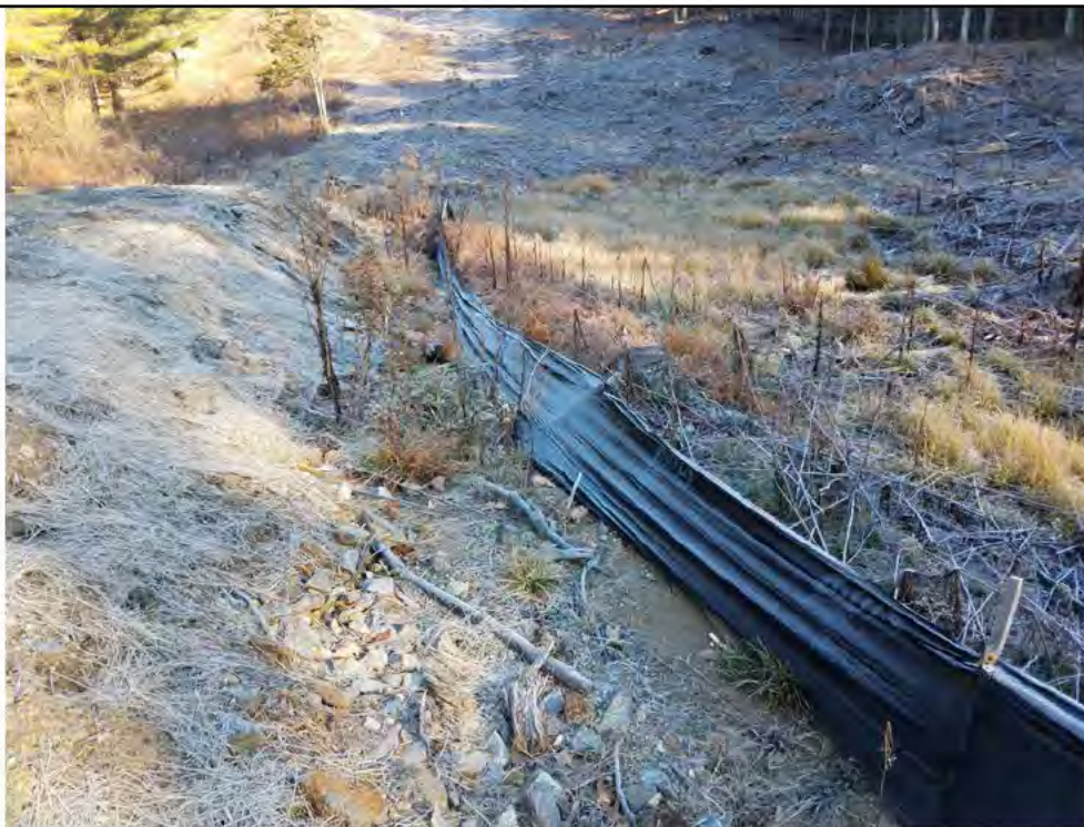
Photo 4: 12/07/2017, Harwinton: Map 32, Str87, full line of silt fence at toe of slope in need of repair.