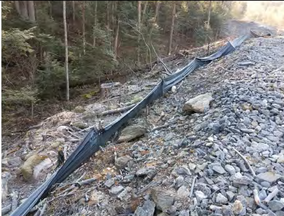
Photo 5: 12/07/2017, Harwinton: Map 32, Str87, full line of silt fence at toe of slope in need of repair.