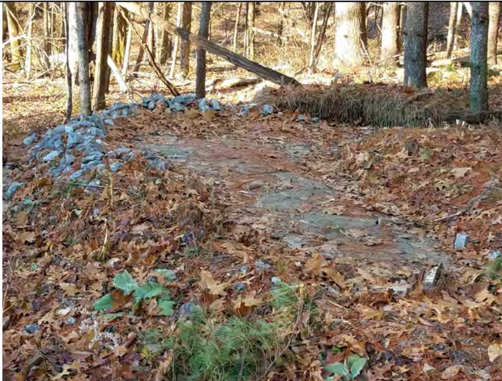
Photo 6: 12/07/2017, Harwinton: Map 32, access road sediment trap in the area of Str87/Str3174/Str3235, excessive sediment buildup.