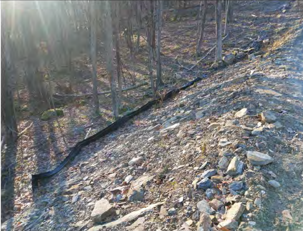
Photo 2: 12/07/2017, Thomaston: Map 24, Str69, silt fence at toe of slope in need of repair.