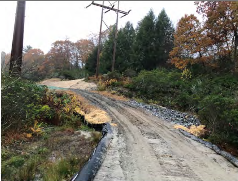
Photo 12: 11/03/17, Watertown: Map 14, timber mat crossing at W-C20 excessive sediment buildup and poor road drainage conditions.