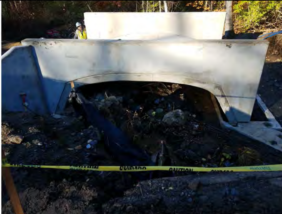
Photo 3: 10/27/17, Harwinton: Map 32, culvert replacement at W-F11/S-F10.