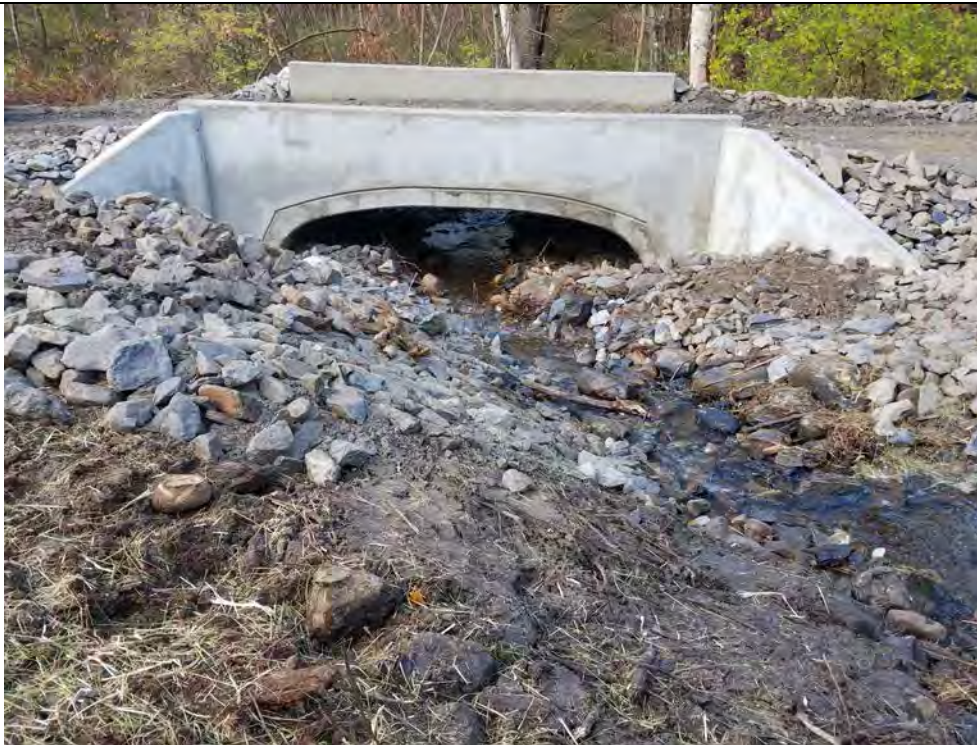
Photo 8: 11/03/17, Harwinton: Map 32, access road to culvert spanning W-F11/S-F10, up gradient side, photo taken facing west toward Valley Road.