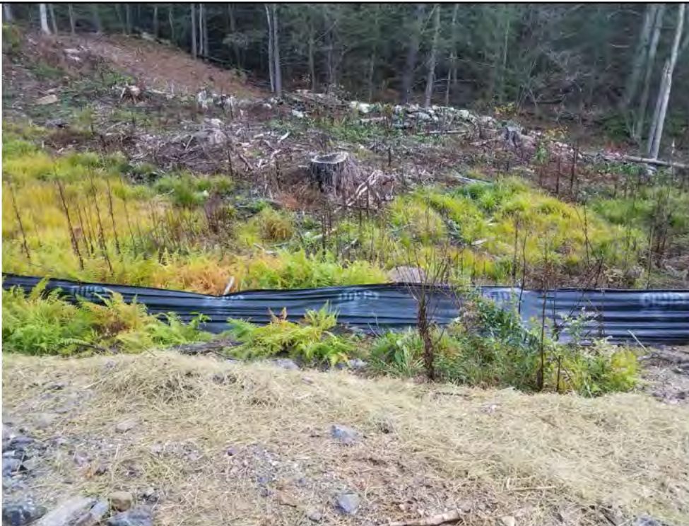
Photo 16: 11/03/17, Harwinton: Map 32, damaged silt fence south of Str3235 at W-F12.