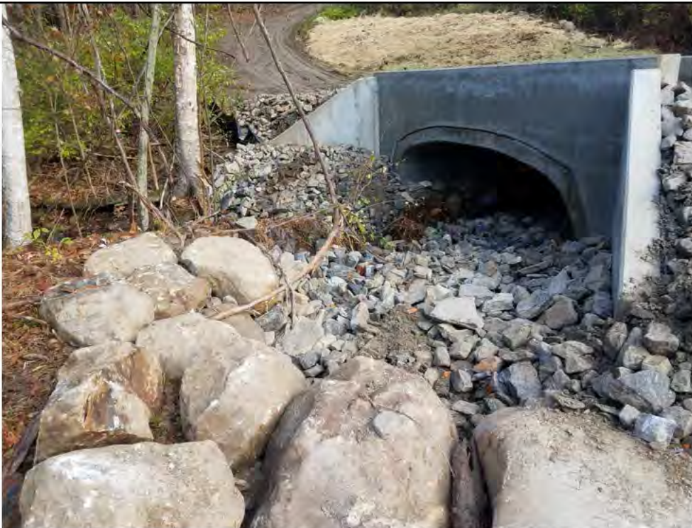
Photo 10: 11/03/17, Harwinton: Map 32, access road to culvert spanning W-F11/S-F10, down gradient side, photo taken facing south toward Str87, Str3174, Str3235.