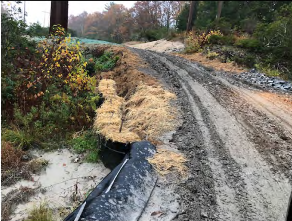
Photo 11: 11/03/17, Watertown: Map 14, W-C20 sedimentation breakthrough due to recent rainfall events (2).