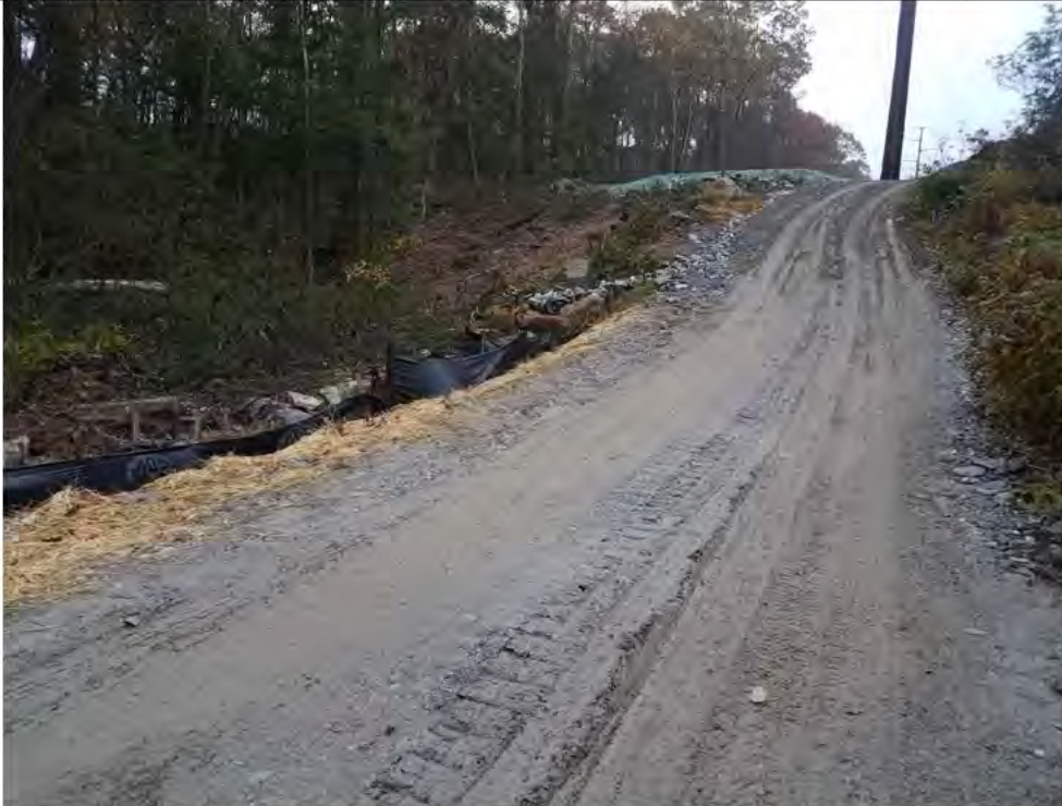
Photo 13: 11/03/17, Watertown: Map 12, south of Str34 flattened water bar, soft road conditions due to poor surface water drainage.