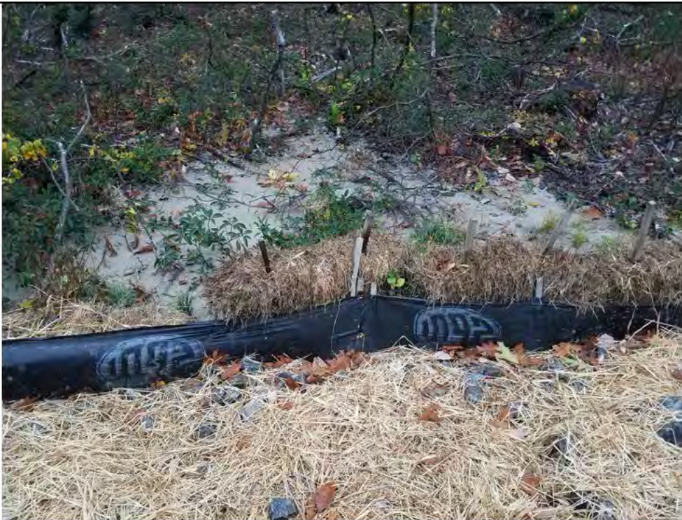
Photo 14: 11/03/17, Watertown: Map 12, south of Str34 sedimentation through E&S controls slightly upland of W-C15.