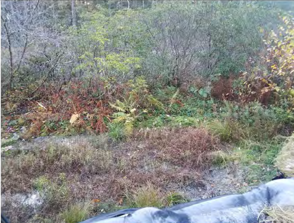
Photo 5: 10/27/17, Watertown: Map 14, W-C20 sedimentation breakthrough due to recent rainfall event.