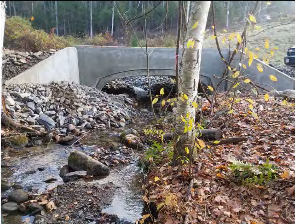
Photo 9: 11/03/17, Harwinton: Map 32, access road to culvert spanning W-F11/S-F10, down gradient side, photo taken facing east toward W-F11.