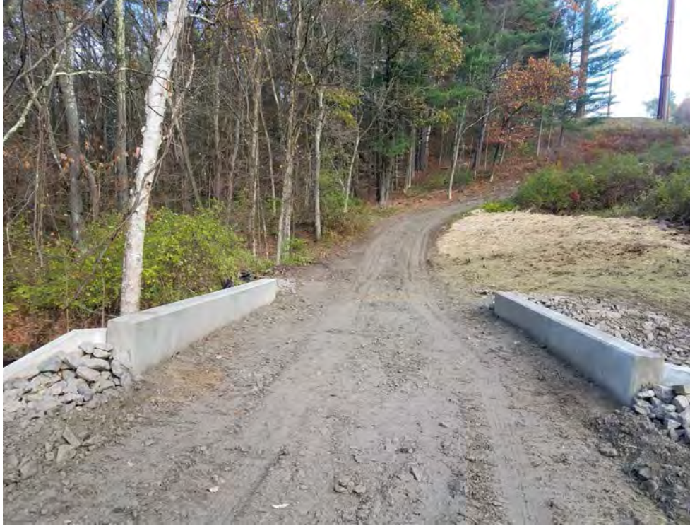
Photo 7: 11/03/17, Harwinton: Map 32, access road to culvert spanning W-F11/S-F10, photo taken facing north toward Str87, Str3174, Str3235.