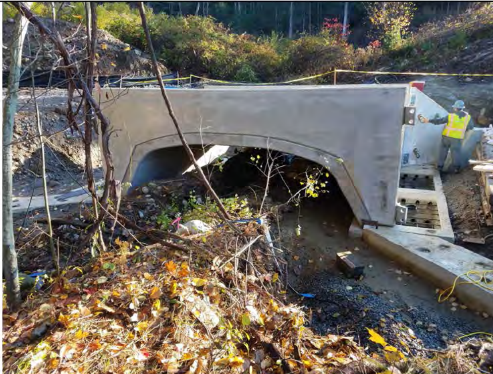
Photo 4: 10/27/17, Harwinton: Map 32, culvert replacement at W-F11/S-F10.