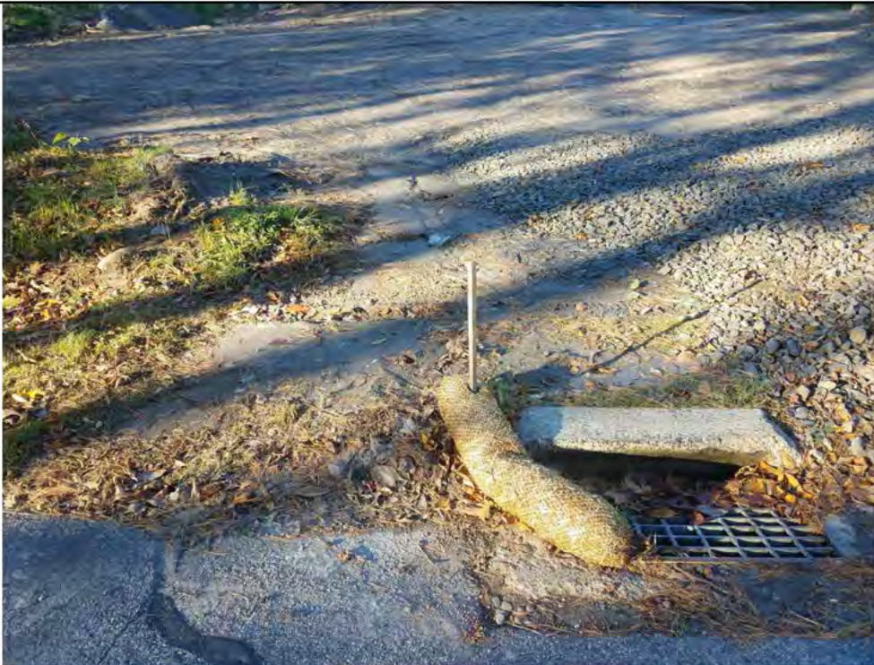
Photo 6: 10/27/17, Litchfield: Map 29, catch basin at Str81 west side of Campville Road, straw wattle installed.