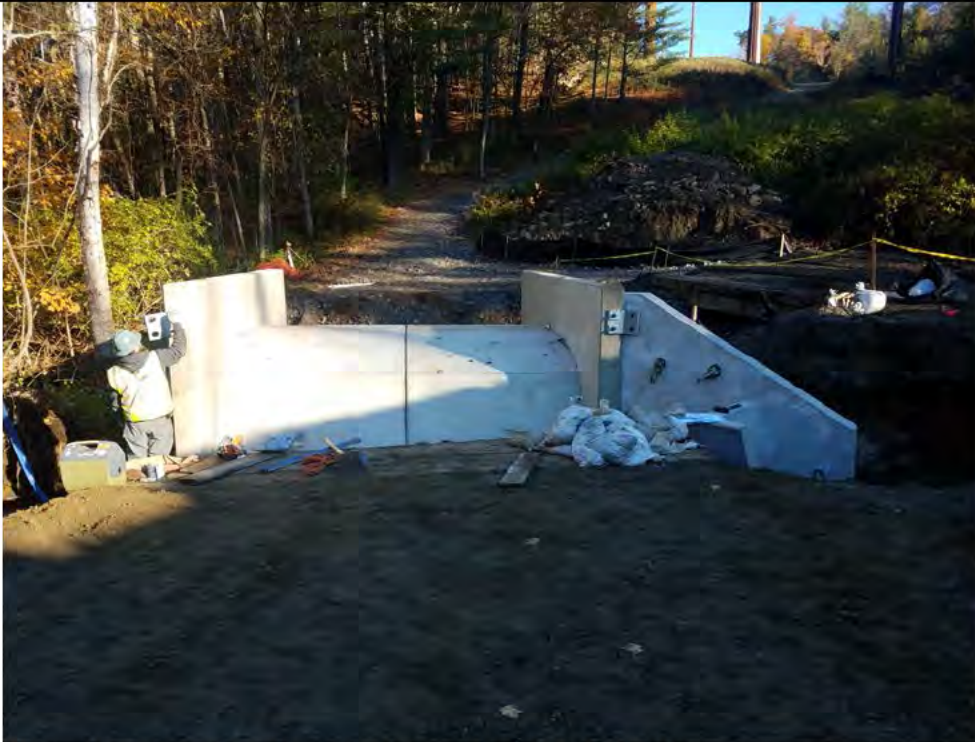
Photo 2: 10/27/17, Harwinton: Map 32, culvert replacement at W-F11/S-F10.