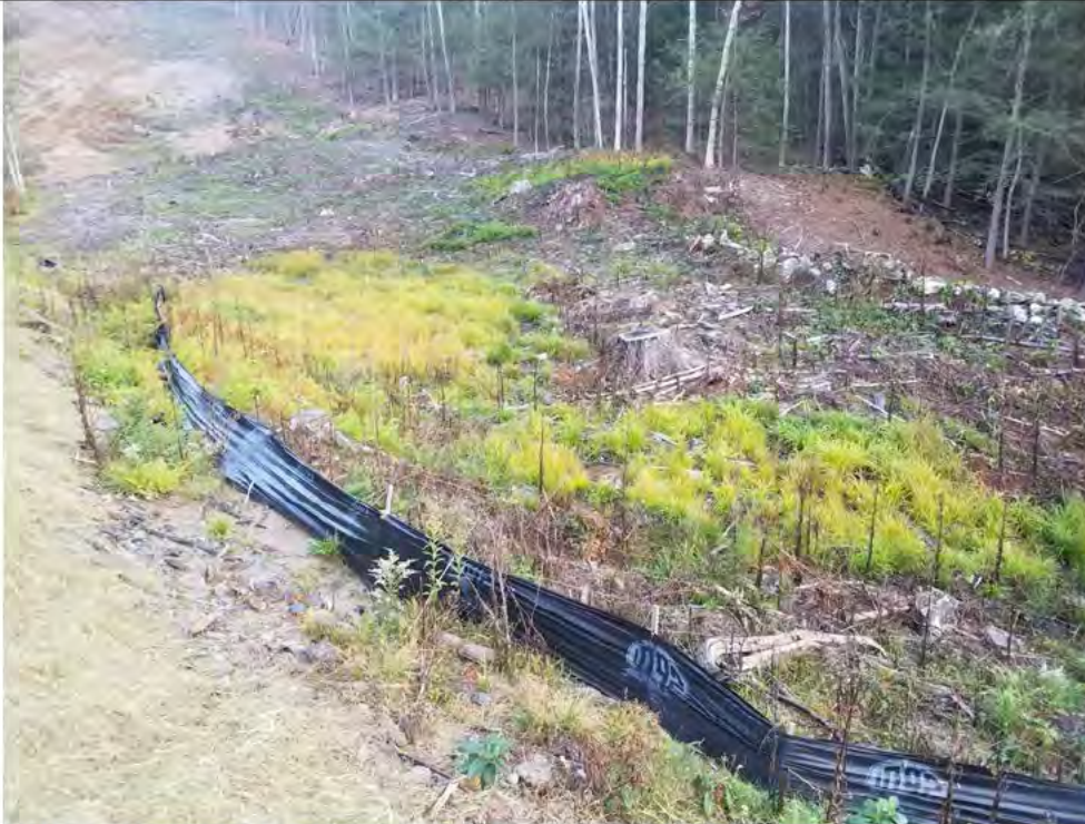
Photo 15: 11/03/17, Harwinton: Map 32, damaged silt fence south of Str3235 at W-F12.