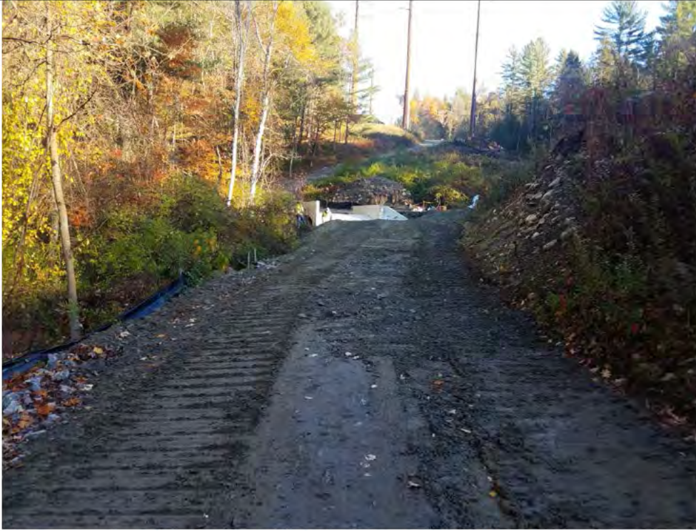
Photo 1: 10/27/17, Harwinton: Map 32, access road to culvert across W-F11/S-F10.