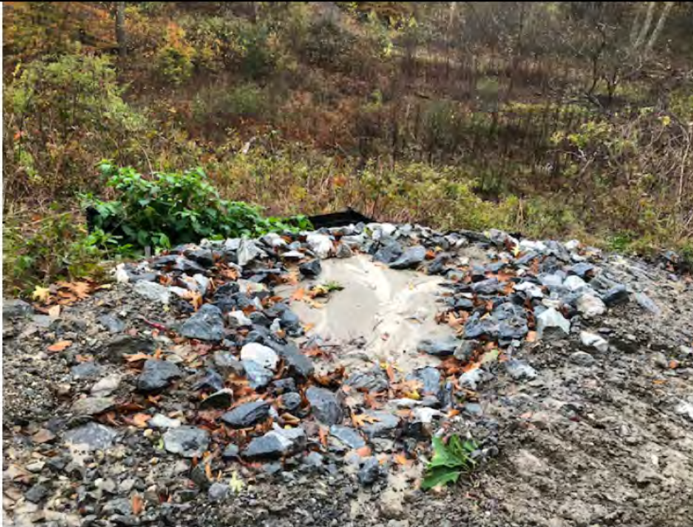
Photo 17: 11/03/17, Watertown: Maps 09-16, photo of typical sediment trap filled to capacity observed throughout this section of ROW due to recent rainfall events.