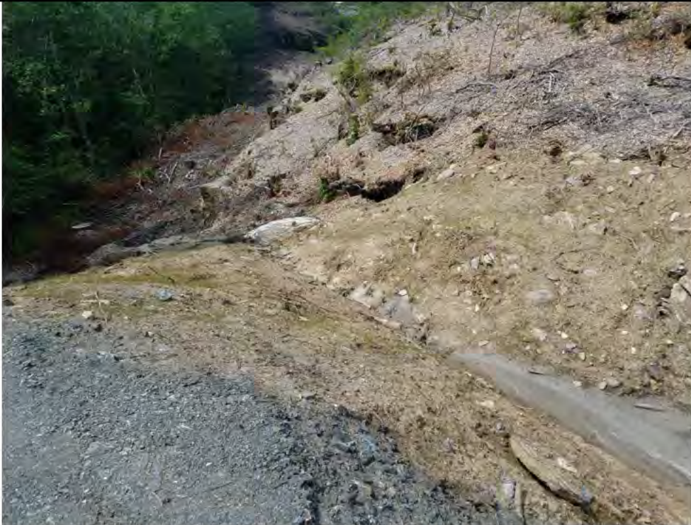
Photo 3: 06/23/2017, Watertown: Map 15, Str42 pad, at south end of the pad, storm water runoff is channeled to the slope via cut swale. Fine sediments from the pad materials are travelling down the slope to the south (See below, Photo 4) however no sensitive areas are affected. E&S controls should be implemented here to capture sediments and prevent further erosion of slope. UPDATE-As of 6/27/2017, Matt Davison reported that this area is being worked on.