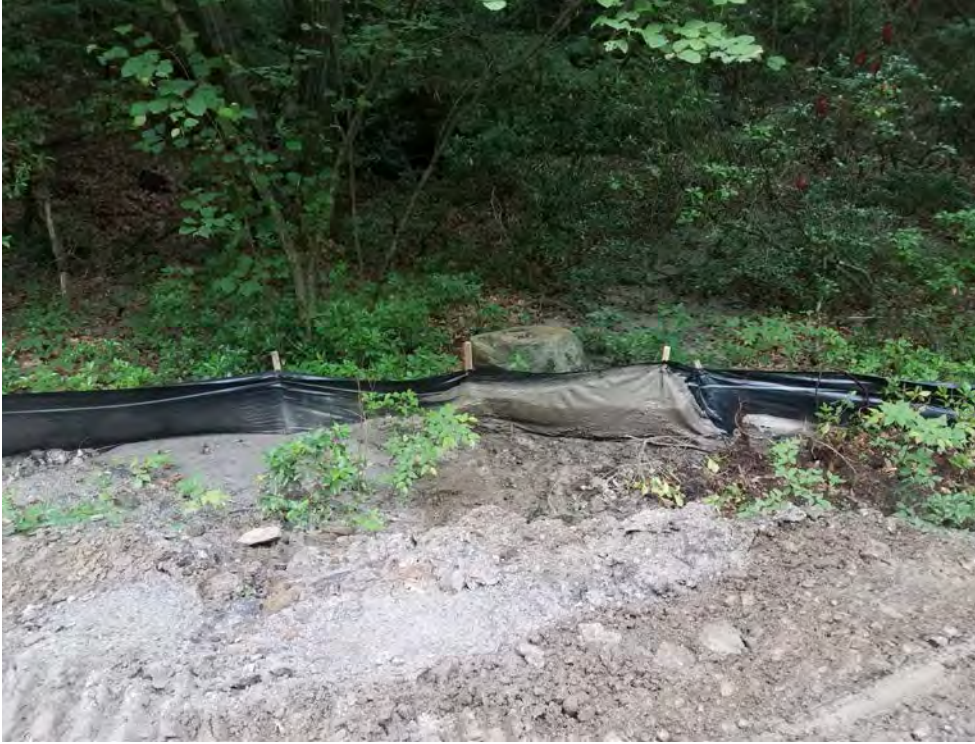
Photo 5: 06/30/2017, Watertown: Map 15, access road between Str41 and Str42, Silt fence maintenance performed. Sedimentation buildup occurred after 7/27/17 is in the process of being removed by Northern.