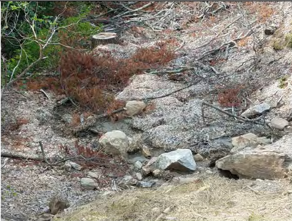
Photo 4: 06/23/2017, Watertown: Map 15, Str42 pad, At south end of the pad, storm water runoff is channeled to the slope via cut swale and fine sediments from the pad materials are travelling down the slope to the south. UPDATE-As of 6/27/2017, Matt Davison reported that this area is being worked on.