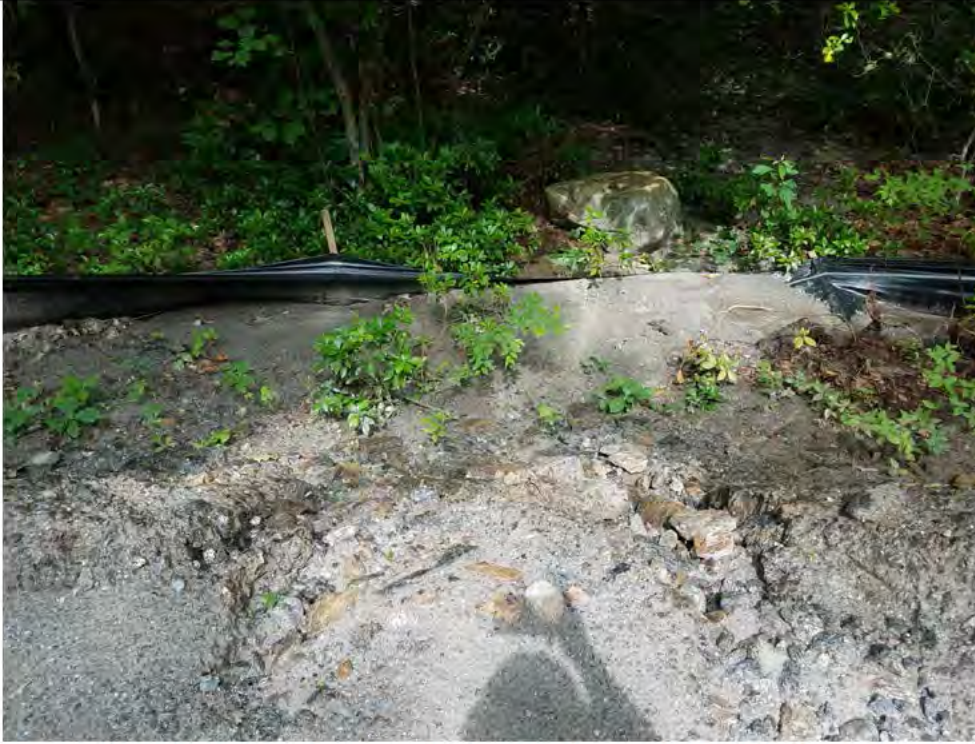
Photo 1: 06/23/2017, Watertown: Map 15, access road between Str41 and Str42, Silt fence maintenance required. No sensitive areas affected. UPDATE-As of 6/27/2017, Matt Davison reported that this area is being worked on.