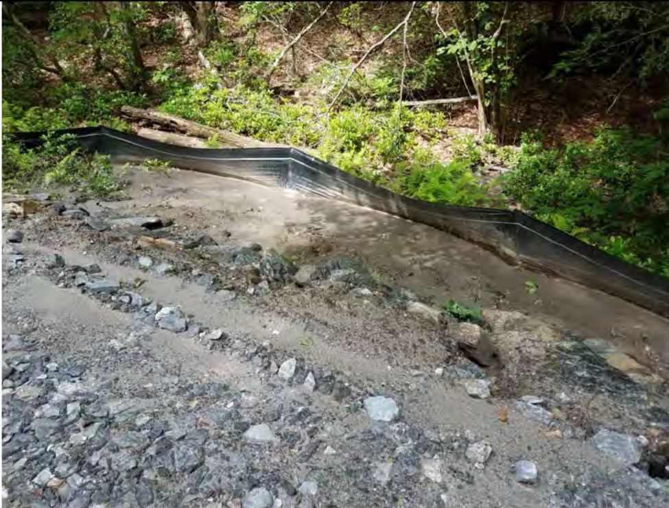
Photo 2: 06/23/2017, Watertown: Map 15, access road between Str41 and Str42, Silt fence maintenance required (Along the same silt fence line as Photo 1 above). UPDATE-As of 6/27/2017, Matt Davison reported this area is being worked on.