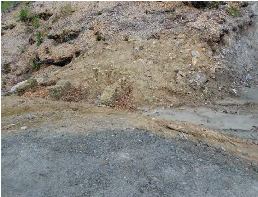
Photo 6: 06/30/2017, Watertown: Map 15, Str42 pad, at south end of the pad, storm water runoff is channeled to the slope via cut swale. Northern placed hay bales and wood chips (check dams) to capture sediments prior to slope. Sedimentation on slope will be addressed as part of the project restoration phase. No sensitive areas affected.