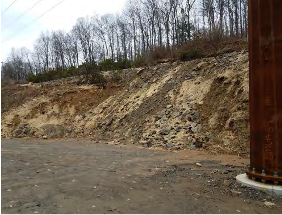
Photo 1: 02/22/2018, Thomaston: Map 24, Str69, upland slope soil sloughing.