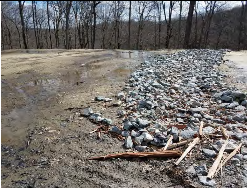
Photo 2: 04/05/2018, Watertown: Map 10, additional view of Photo 1 conditions, Str27 work pad is the right (south) of the rock filled swale and Str28 is to the left (north) of the swale. .