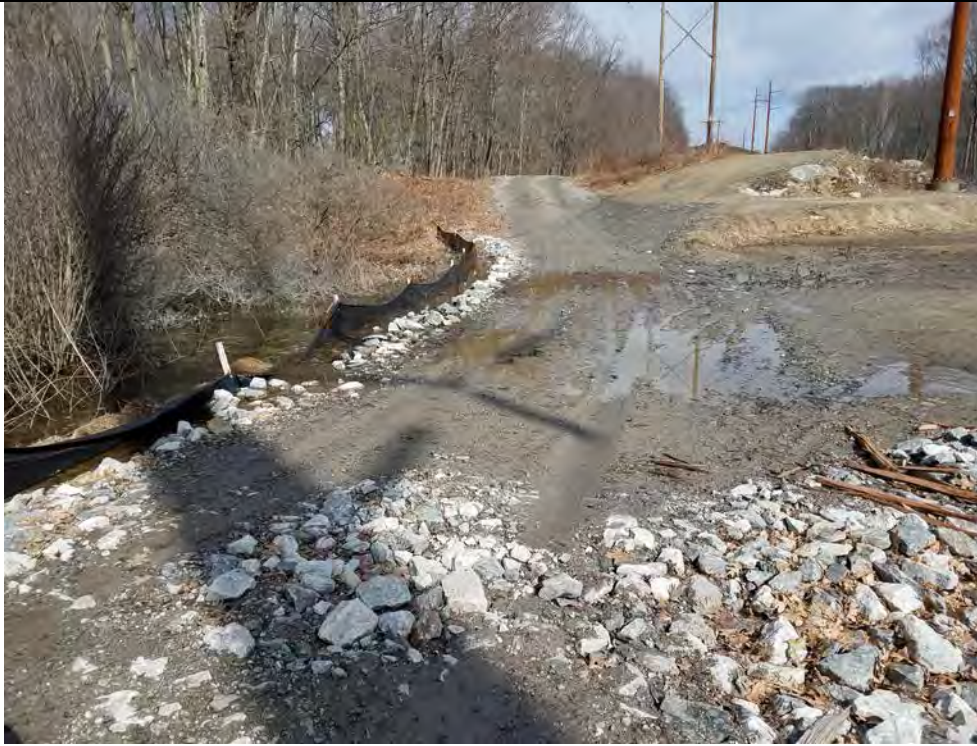
Photo 1: 04/05/2018, Watertown: Map 10, combined work pads Str27-Str28, the access road and work pad grading is such that surface water does not drain properly to the stone filled swale, rather it ponds and either drains to wetland W-C3 or to low elevation points in the pad and then freely drains off the eastern slope. The slope has visible rills and water flow from the west side of the pad to the east. No drainage is emitting from the swale or from the work pad (Str27) south of the swale. Photo taken facing north along the access road, Str27 and Str28 work pads to the right (east).