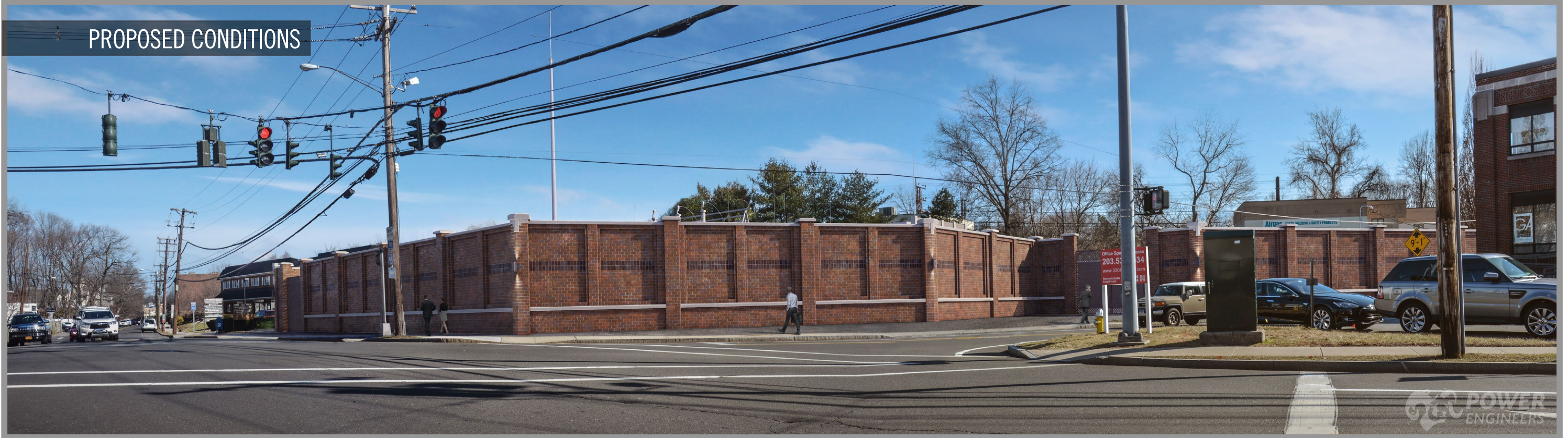
Photo simulations are for discussion purposes only. Equipment and materials subject to availability. Final design may change pending client, public, and regulatory review.