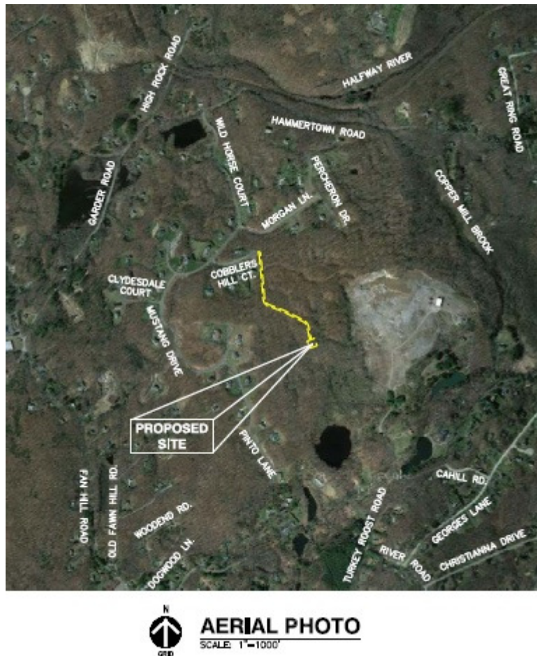
Figure 1: Aerial Map

Included in this Application and its accompanying Attachments are reports, plans and visual materials detailing the proposed Facility and its associated environmental effects. A copy of the Council's Community Antennas Television and Telecommunication Facilities Application Guide with page references from this Application is also included as Attachment 14.