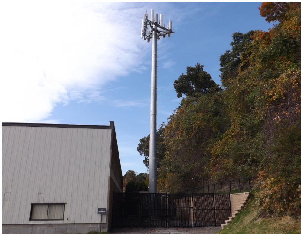
East side of Site