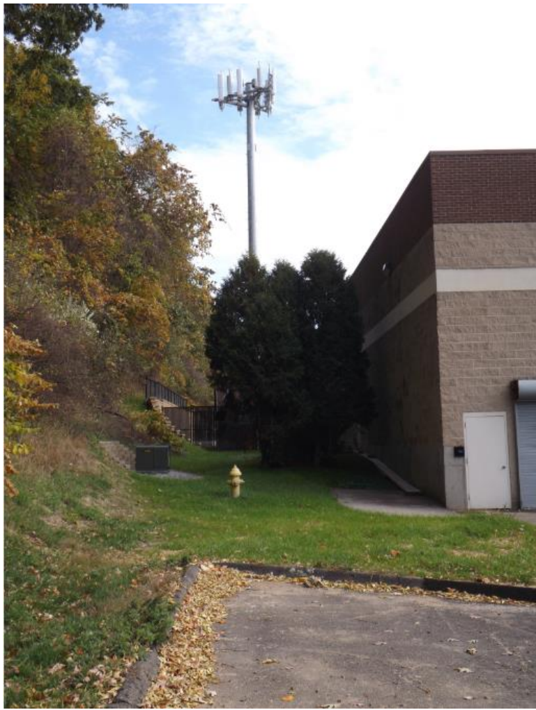
West side of Site