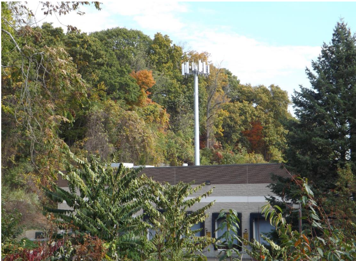
View of facility from abutting property at 45 Commerce Drive (west of site)