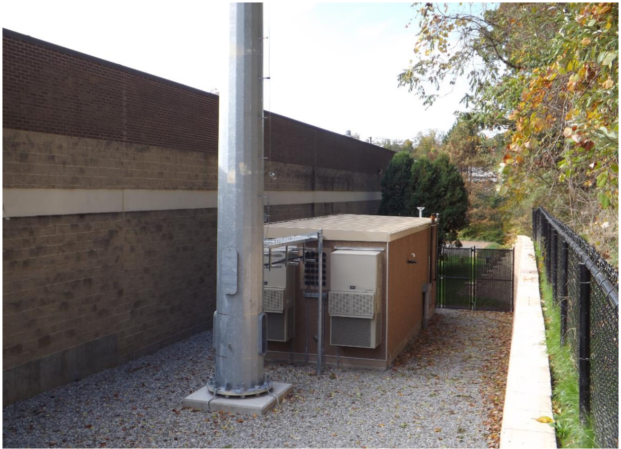
Interior compound view