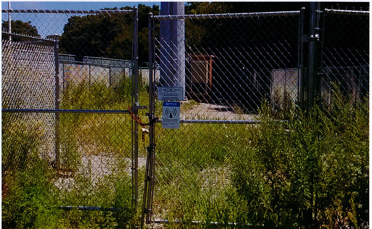
Compound entrance area. Weeds need trimming.