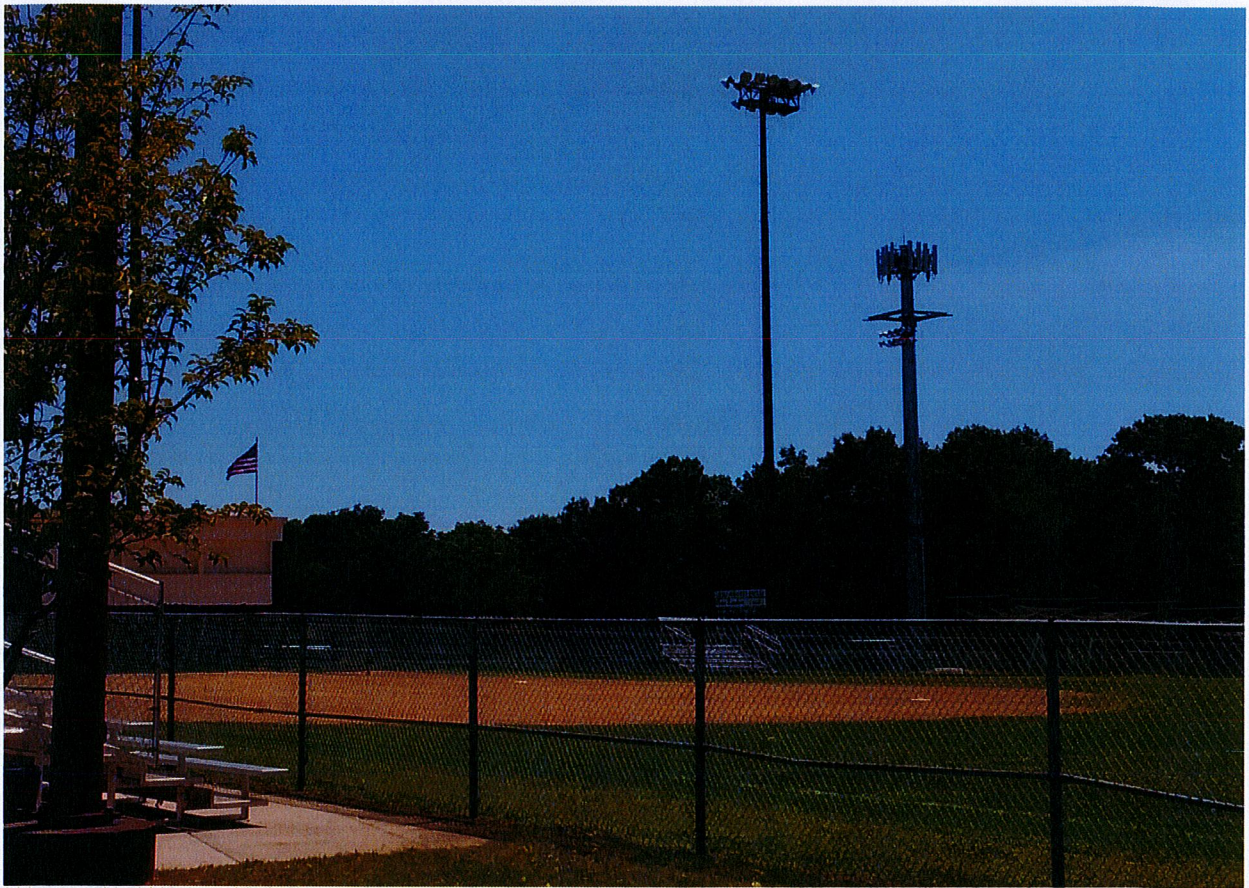
View from edge of parking lot.