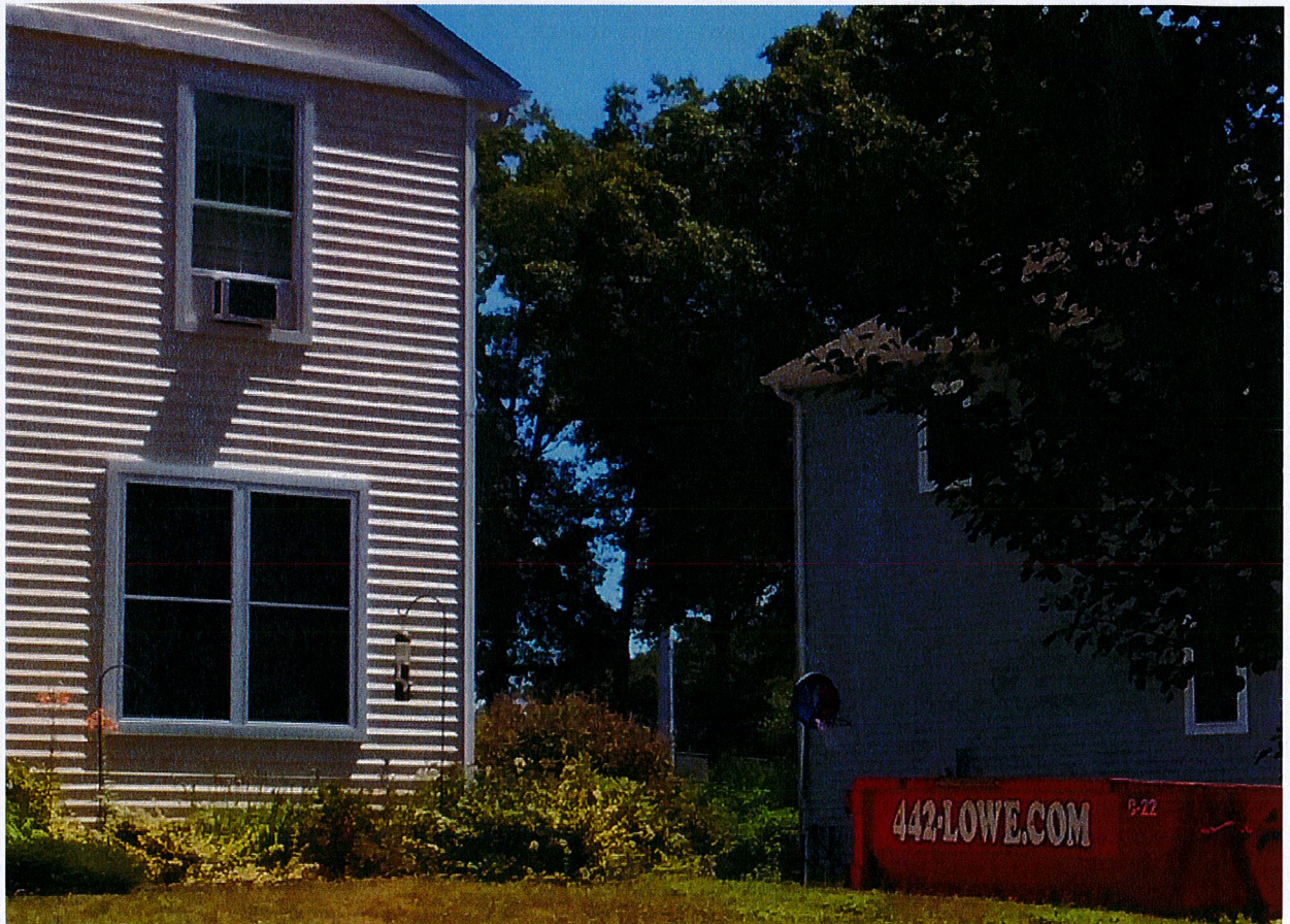
View from Davis Farm Way.