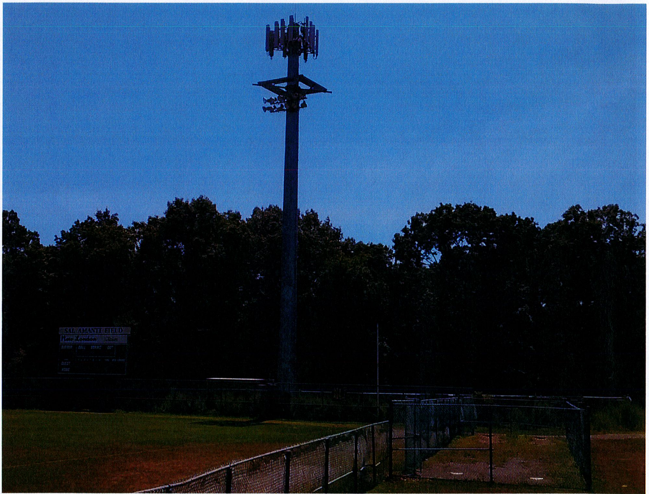
View of tower from athletic field.