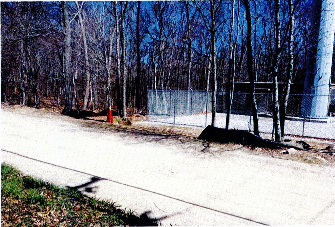
Photo 1: View of Facility with broken silt fence line looking northeast.