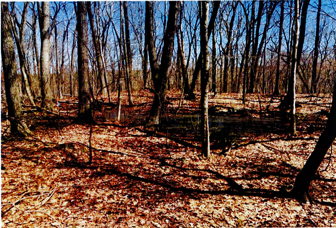
Photo 9: View of vernal pool with approximately 10 inches of inundation looking northeast.