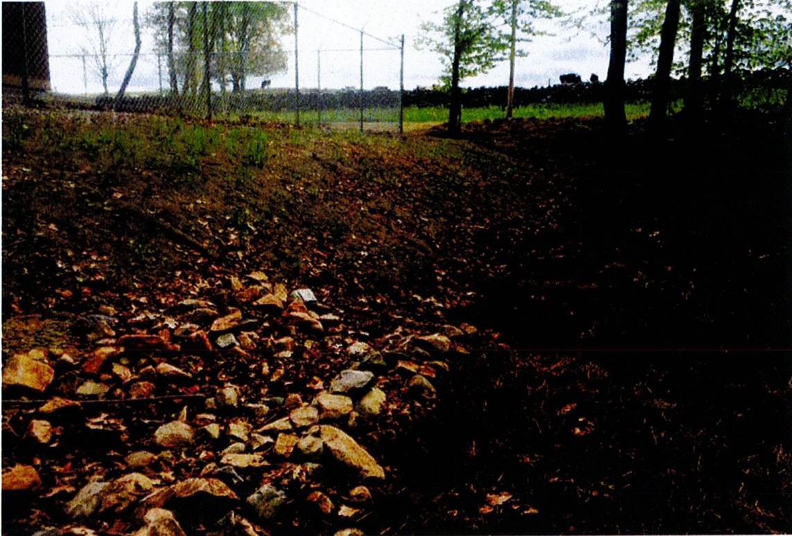
Photo 5: View of northern side slope to compound looking southwest.