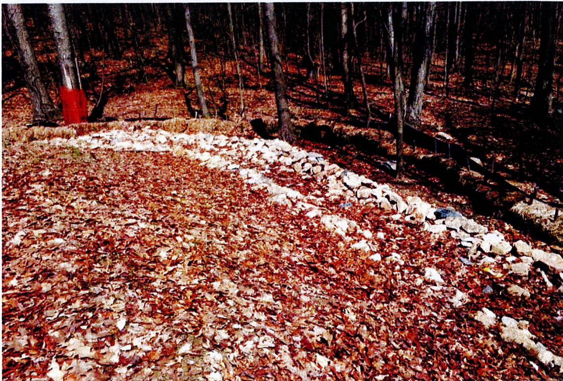
Photo 4: View of constructed rip rap drainage swale looking northeast.