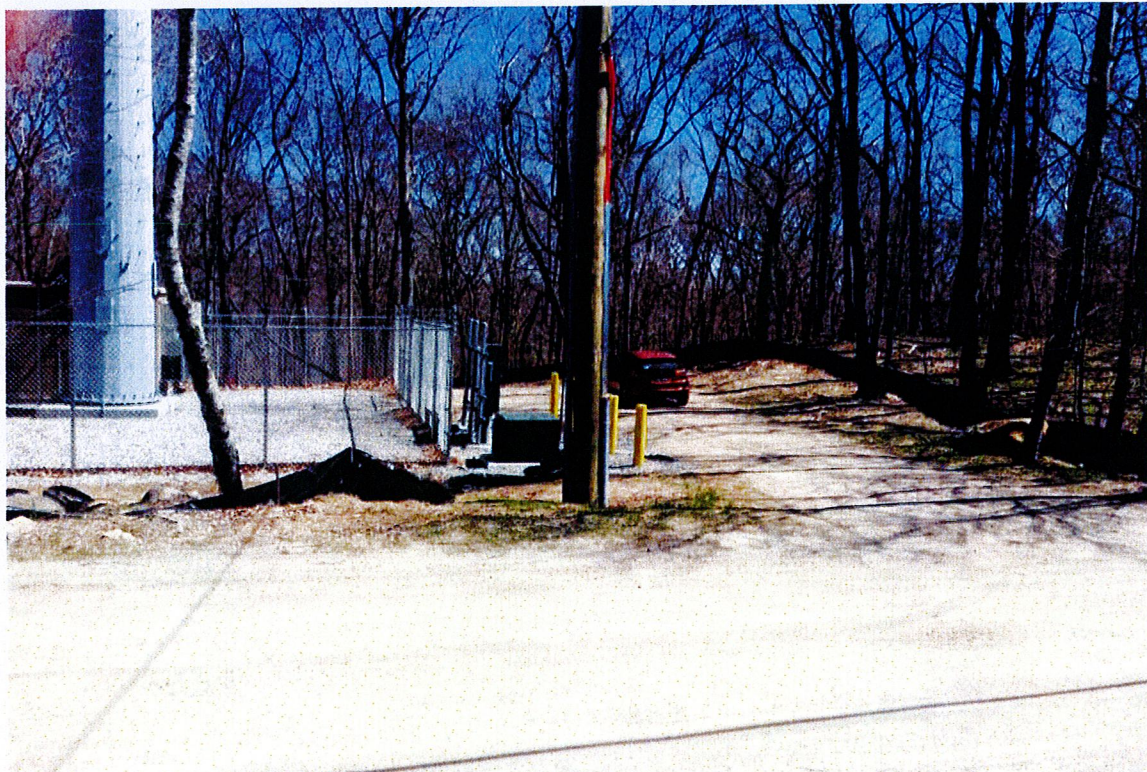
Photo 2: View of access entrance with open silt fencing looking east.