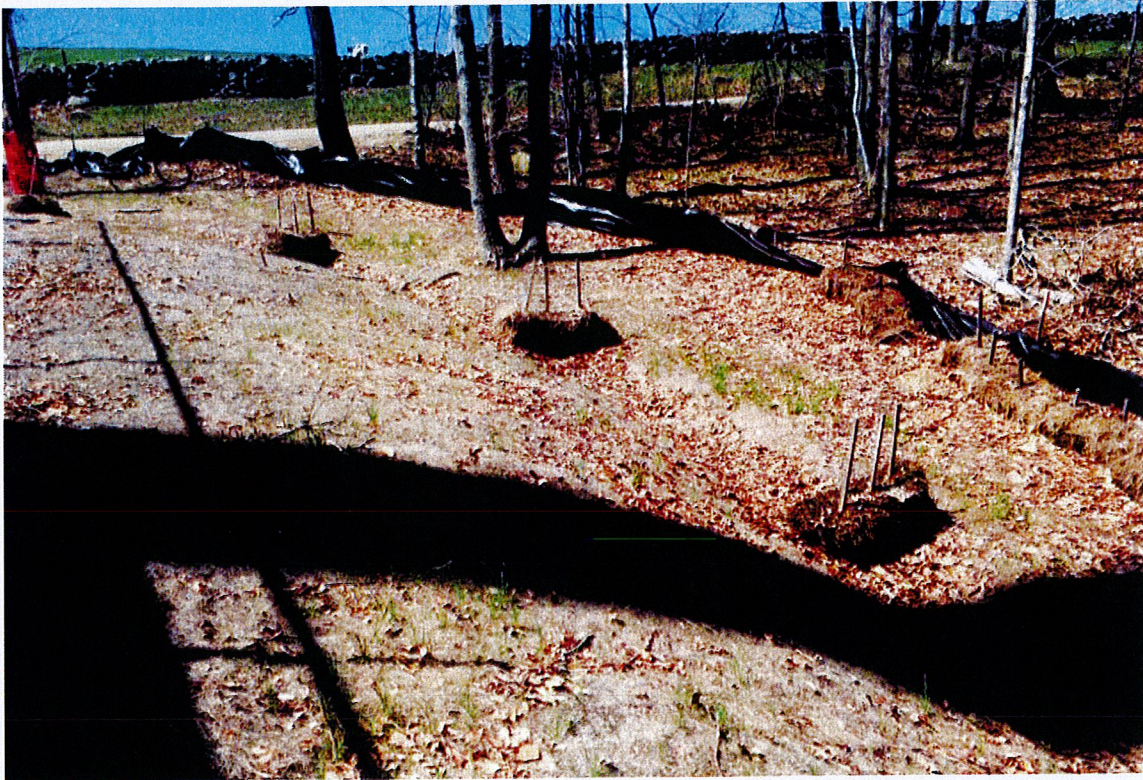
Photo 5: View of drainage swale and straw bale check dams looking northwest.