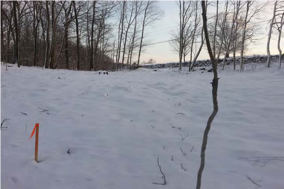
Photo 5: View of completed tree removal activities, looking southeast with Gallup Road in background. Photo date: February 3, 2014.