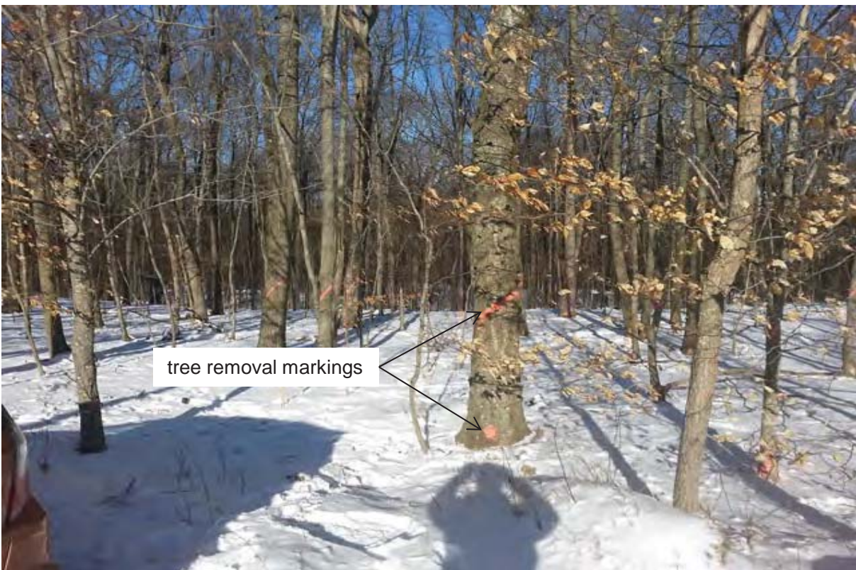
Photo 2: View of tree removal markings (orange paint markings: hash mark symbol at chest height and dot at base). Photo date: 01/23/14