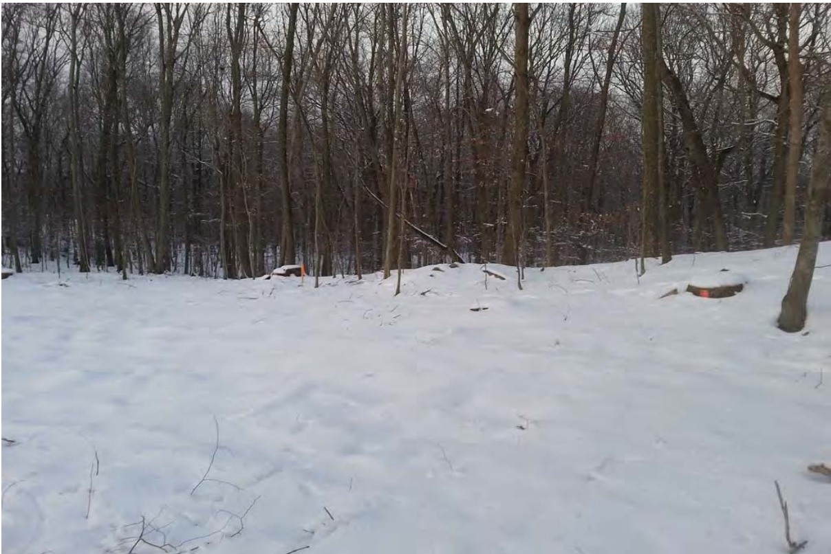
Photo 6: : View of completed tree removal activities, looking north. Photo date: February 3, 2014.