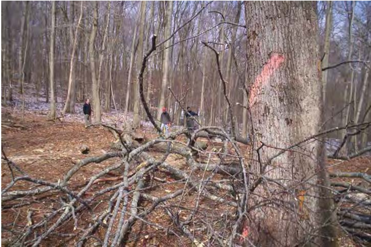
Photo 3: View of tree clearing activities. Date of photo January 29, 2014.