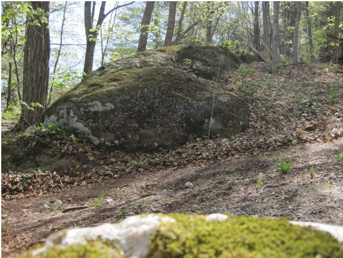
Stone (schist) outcropping, which begins approximately 14' east of our property line and a little over 100' from the edge of Barnes Road.

As to the easement itself, we are perplexed at maps showing that AT&T plans to substantially relocate part of the easement. We presume that AT&T would need agreement of the parties to the easement in order to do this. (This does not involve us, since we are not parties to the easement, but the question should be addressed.)