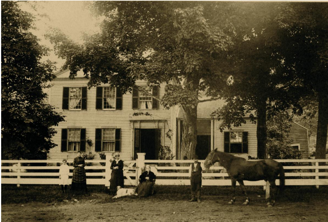
C. 1900 photo of west façade of home