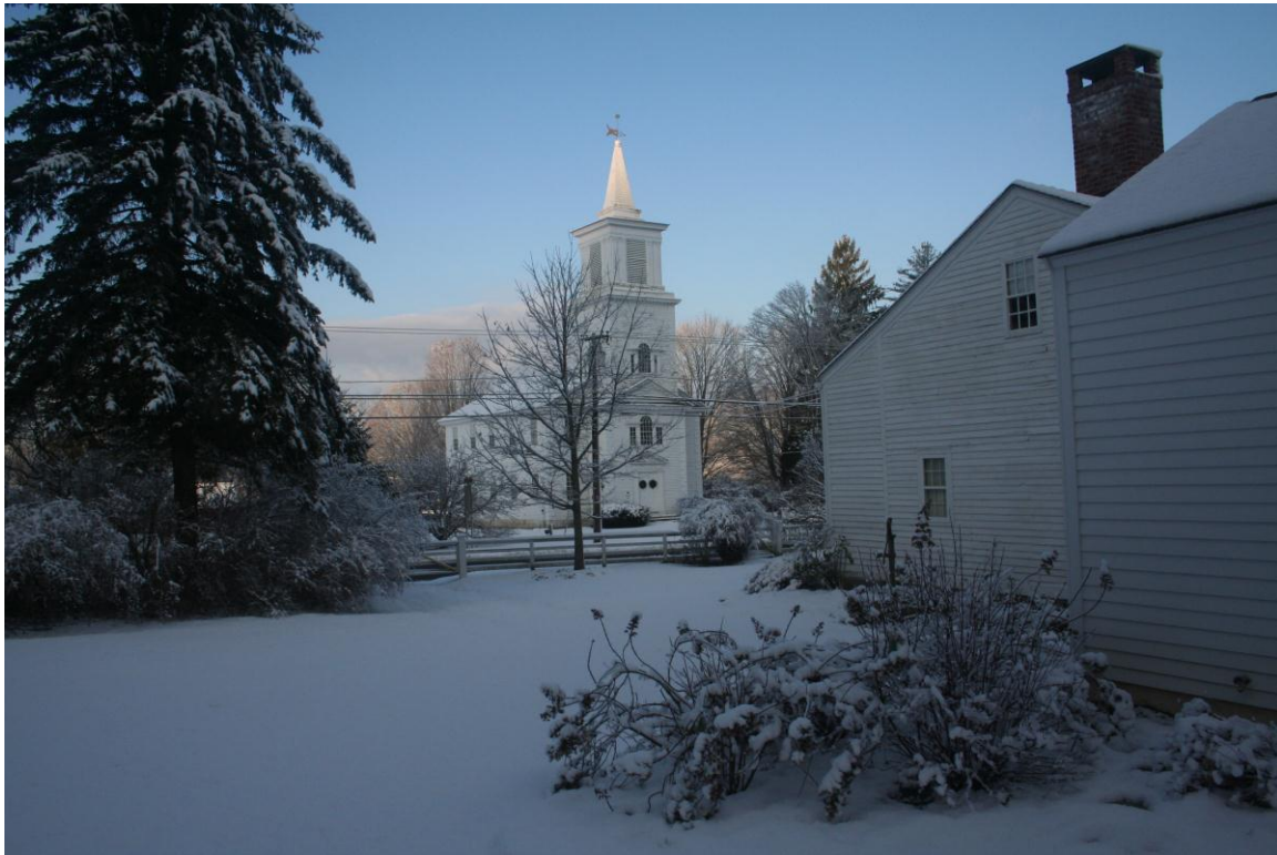
South side of house with Meeting House opposite