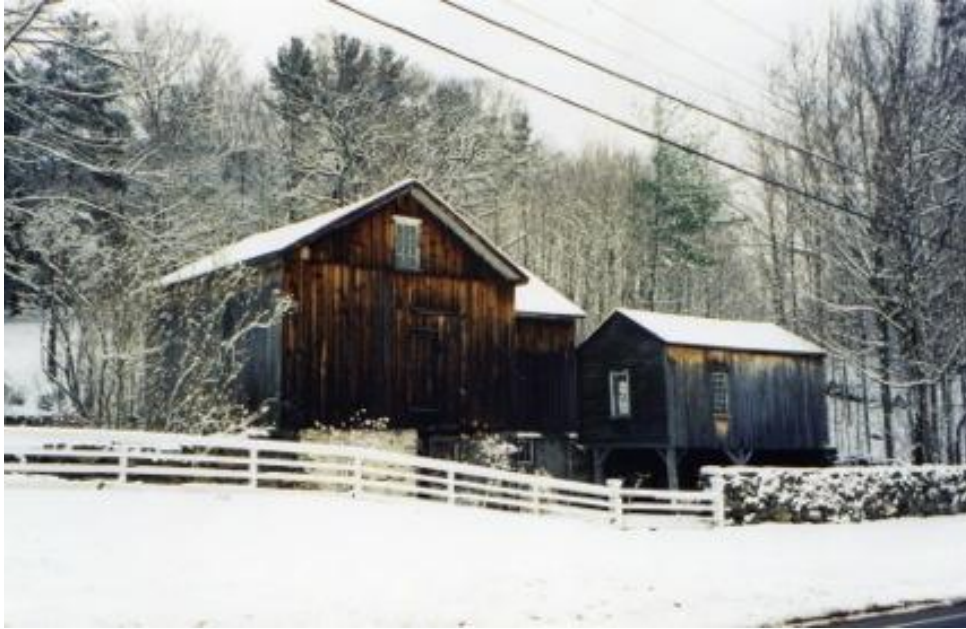
Complex of three barns, seen from Rt. 63 (Law office is the building at right.)