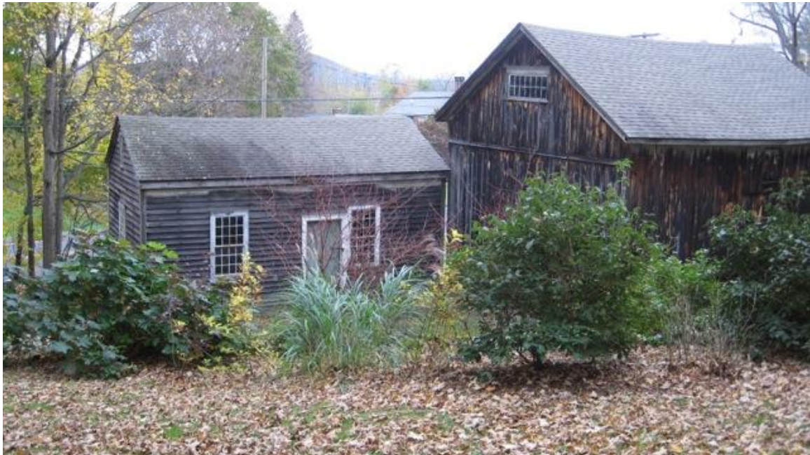
Law office seen from the east, with center barn at right.