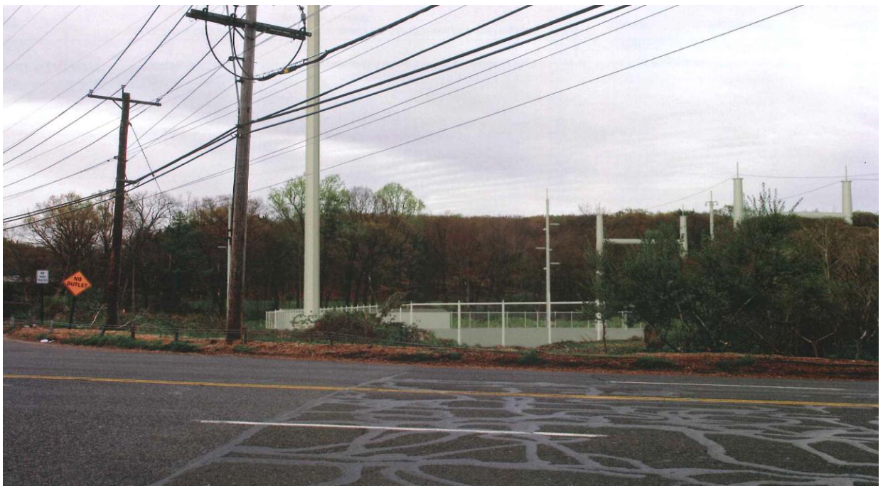
Figure 3 B: Photostimulation of substation from Old Stratford Road, west of Route 8 south exit ramp. (UI 7)