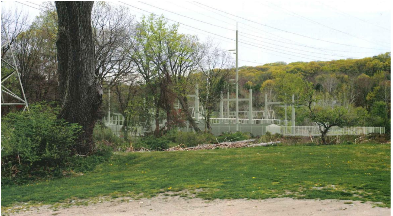
Figure 3A: Photostimulation of substation from Well's Hollow Creamery, Beard Sawmill Road. (UI 7)