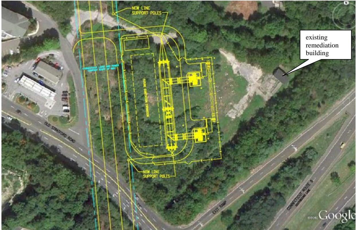
Figure 2A: Aerial view with substation overlay. (UI 7)