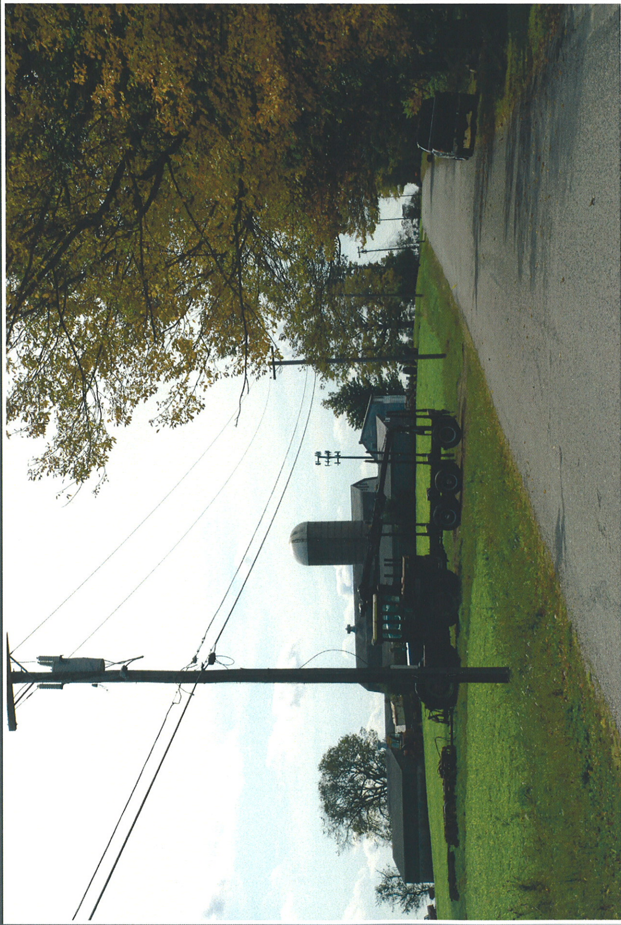
PHOTO TAKEN FROM PROSPECT STREET ADJACENT TO HOUSE #506, LOOKING SOUTHEAST

DISTANCE FROM THE PHOTOGRAPH LOCATION TO SITE IS 0.40 MILE +/-