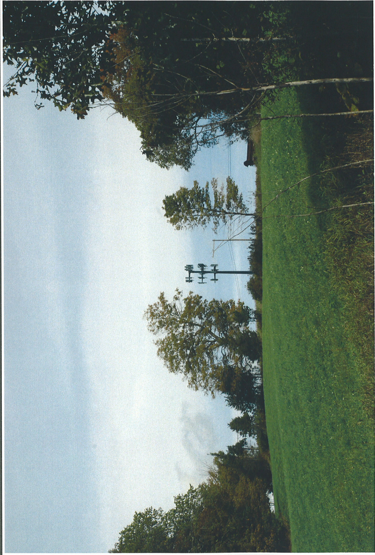
PHOTO TAKEN FROM GREEN ROAD WEST OF PROSPECT STREET, LOOKING NORTHWEST DISTANCE FROM THE PHOTOGRAPH LOCATION TO SITE IS 0.23 MILE +/-

J:\1479_42\graphics\FIGURES\1479_42_Photosims.indd