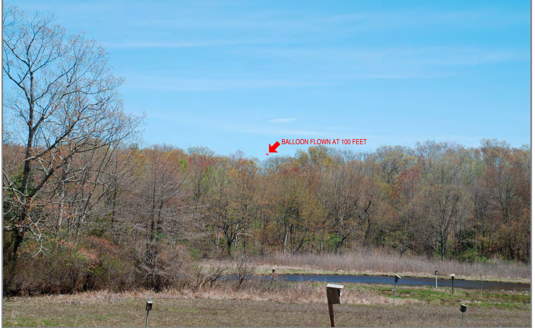
PHOTO TAKEN FROM OTTER ROCK ROAD ADJACENT TO HOUSE #14, LOOKING EAST DISTANCE FROM THE PHOTOGRAPH LOCATION TO SITE IS 0.28 MILE +/-

ct:\mddat\40505.08\graphics\FIGURES\40505.08_Photosim.indd