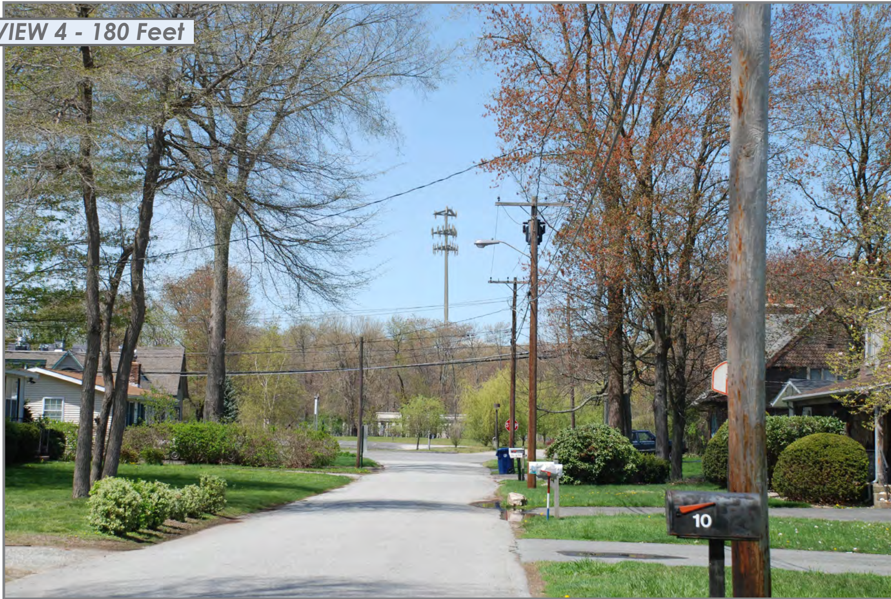
VIEW 4 - 180 Feet

ct:\mddat\40505.08\graphics\FIGURES\40505.08_Photosim.indd