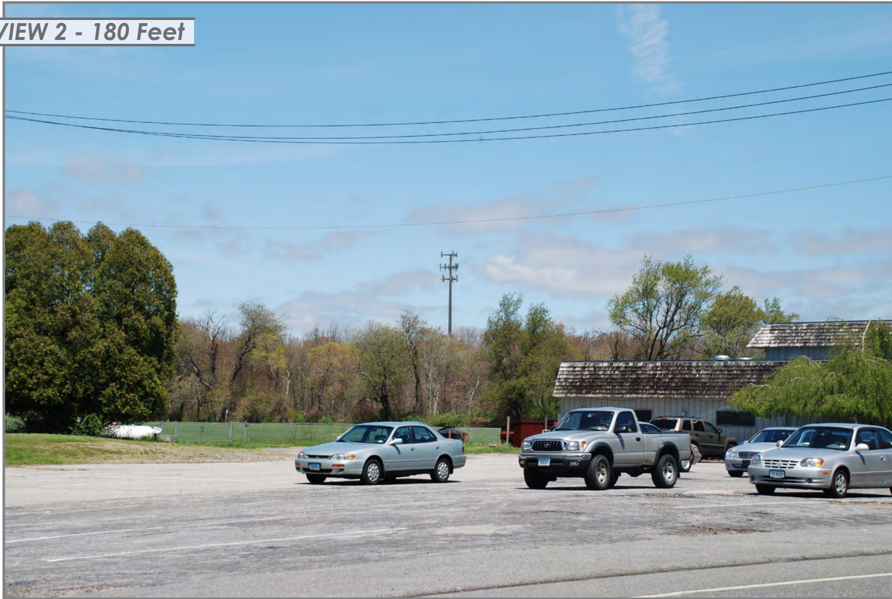
PHOTO TAKEN FROM ROUTE 156 (SHORE ROAD) AT DOGWOOD DRIVE, LOOKING NORTHEAST DISTANCE FROM THE PHOTOGRAPH LOCATION TO SITE IS 0.29 MILE +/-

ct:\mddat\40505-08\graphics\FIGURES\40505-08_Photosim.indd