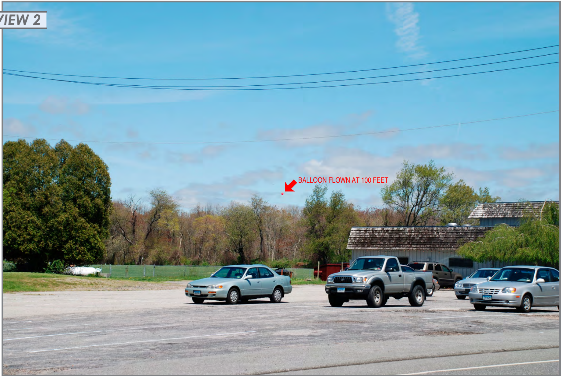
PHOTO TAKEN FROM ROUTE 156 (SHORE ROAD) AT DOGWOOD DRIVE, LOOKING NORTHEAST DISTANCE FROM THE PHOTOGRAPH LOCATION TO SITE IS 0.29 MILE +/-

ct:\mddat\40505-08\graphics\FIGURES\40505-08_Photosim.indd