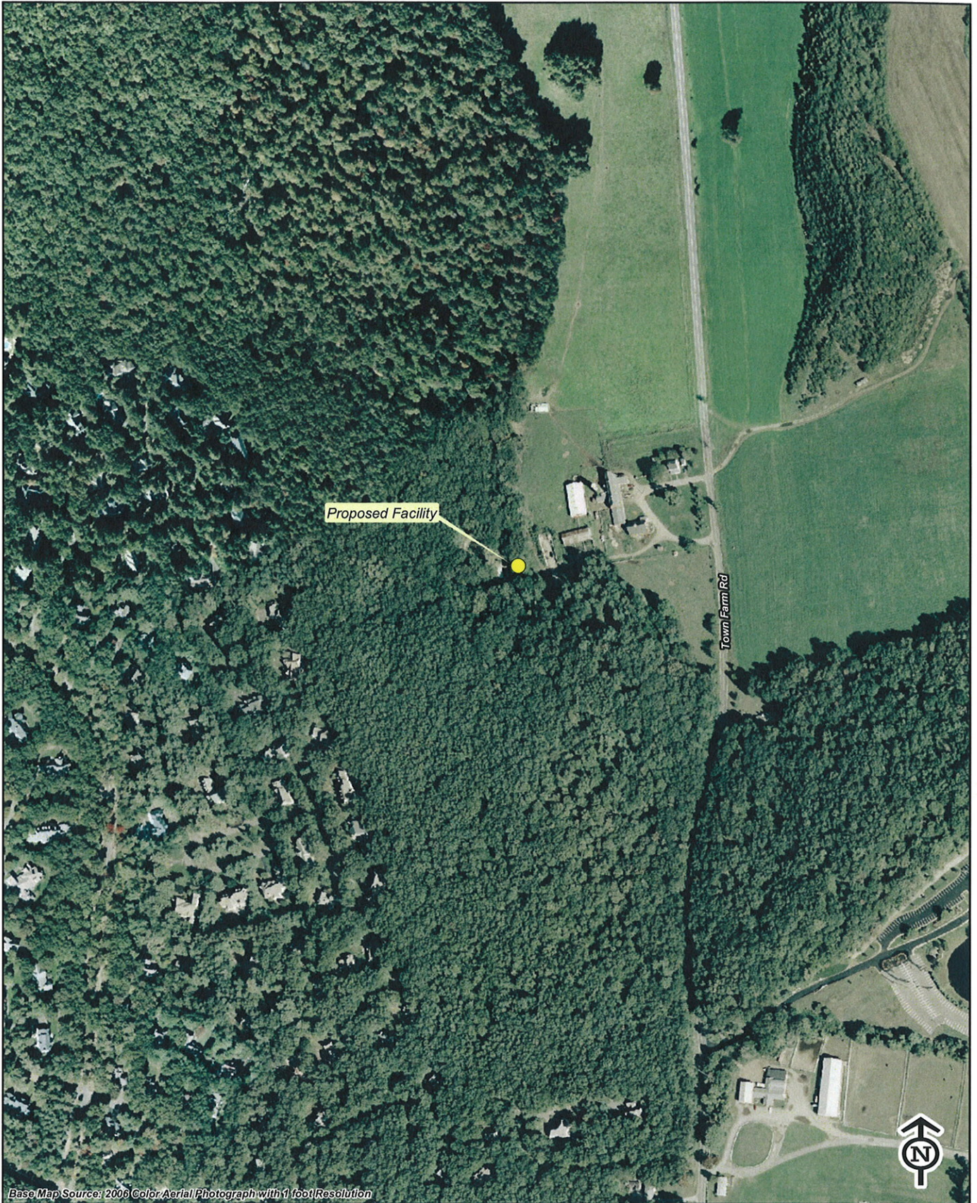
Base Map Source: 2006 Color Aerial Photograph with 1 foot Resolution