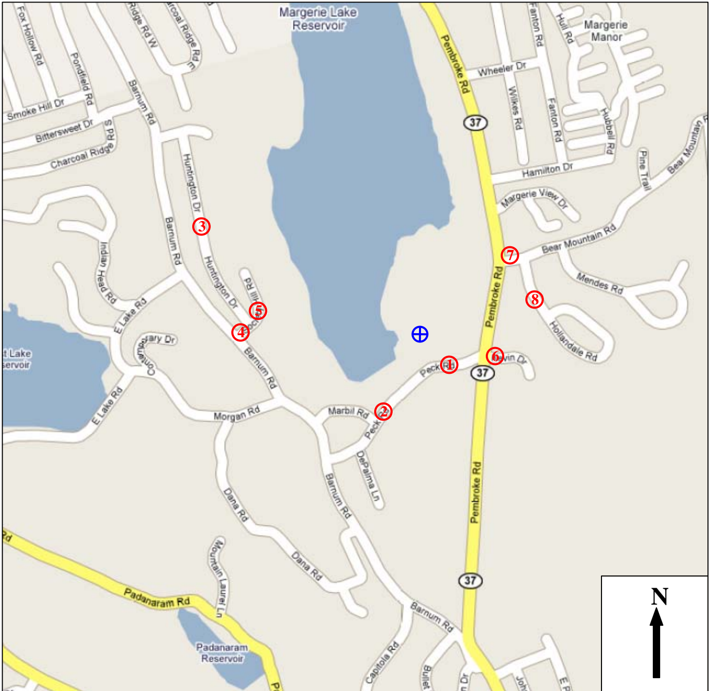
Photo Simulations - Key Map