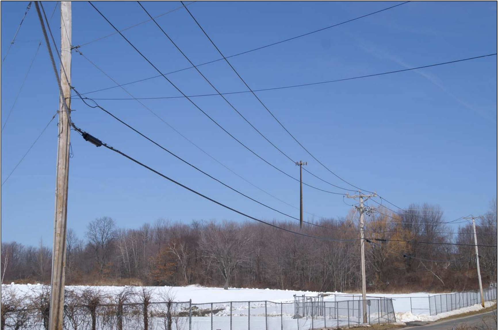
Photo Simulation 2 - View from Peck Road, between Barnum Road and Pembroke Road, looking northeast. Distance to site is approximately 0.15 mile. Winter condition. Monopole is shown with one array of antennas.