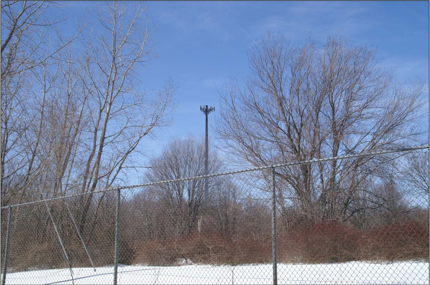
Photo Simulation 1 – View from Peck Road, between Pembroke Road and Barnum Road, looking northwest. Distance to site is approximately 0.05 mile. Winter condition. Monopole is shown with one array of antennas.