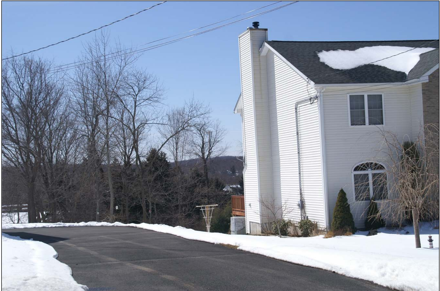
Photo Simulation 8 – View from Hollandale Road, looking southwest. Distance to site is approximately 0.23 mile. Winter condition. Monopole is shown with one array of antennas.