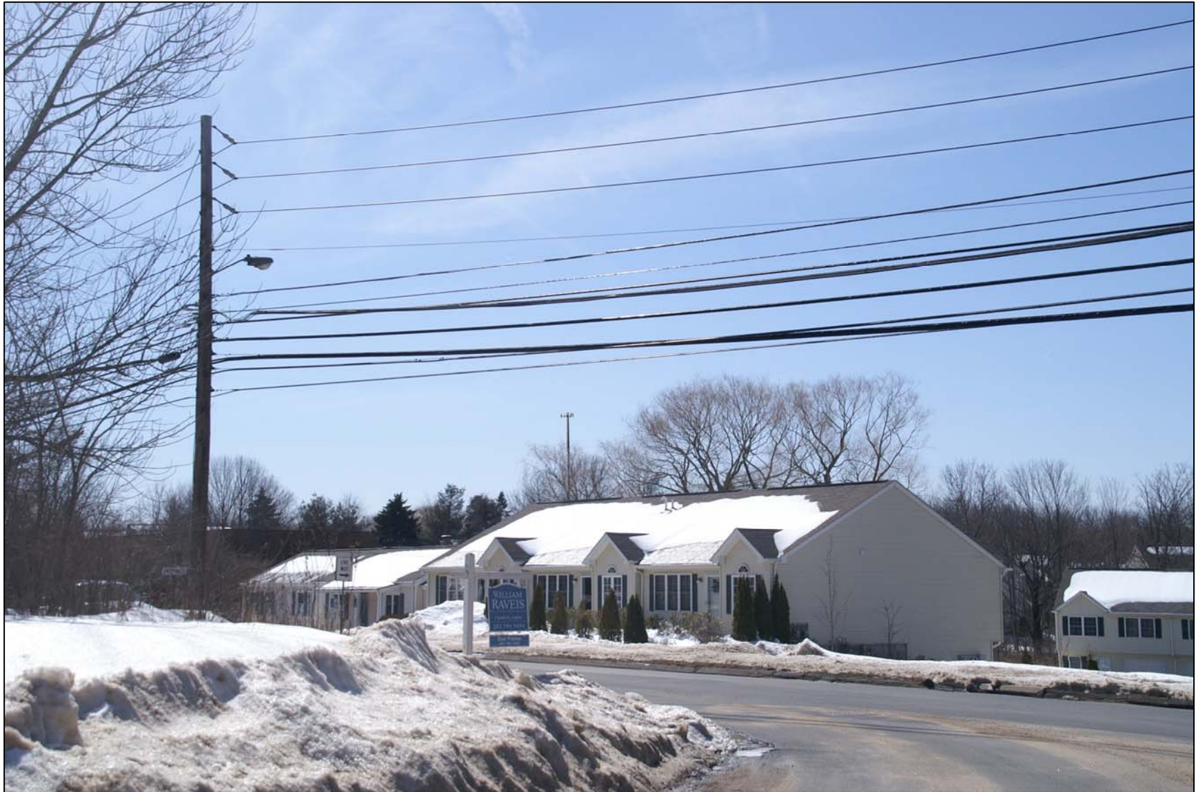
Photo Simulation 7 – View from the north corner of Bear Mountain Road and Pembroke Road, looking southwest. Distance to site is approximately 0.25 mile. Winter condition. Monopole is shown with one array of antennas.