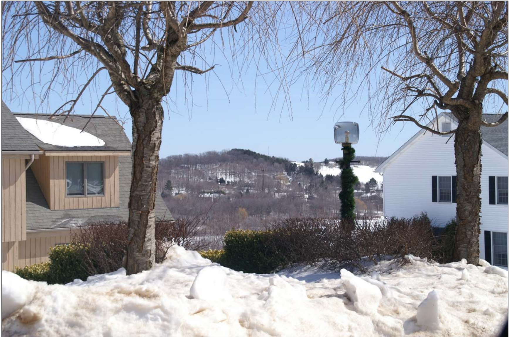
Photo Simulation 3 – View from the peak of Huntington Drive, looking southeast. Distance to site is approximately 0.59 mile. Winter condition. Monopole is shown with one array of antennas.