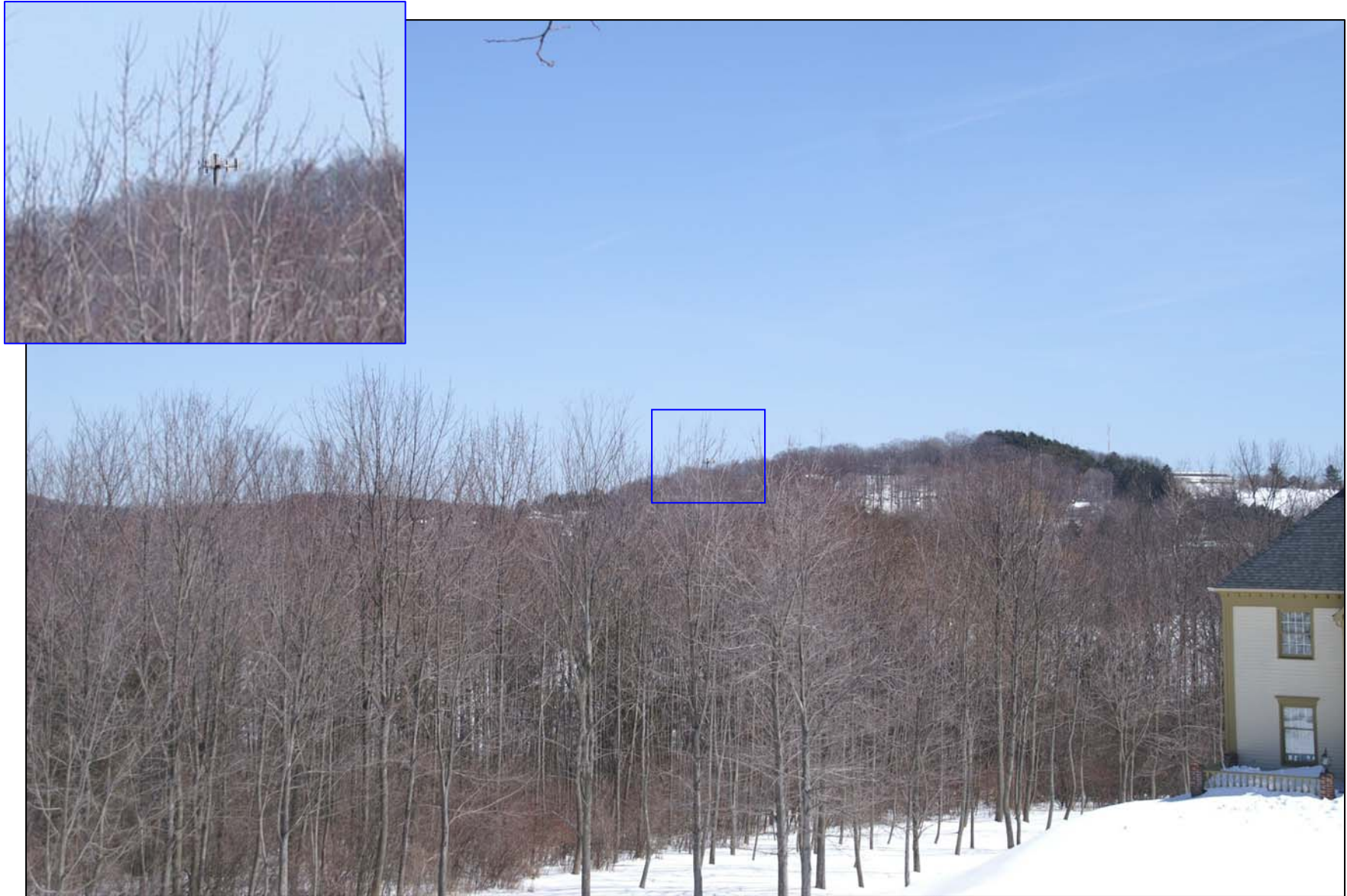
Photo Simulation 4 – View from Society Hill Road, between Barnum Road and Huntington Drive, looking east. Distance to site is approximately 0.43 mile. Winter condition. Monopole is shown with one array of antennas.