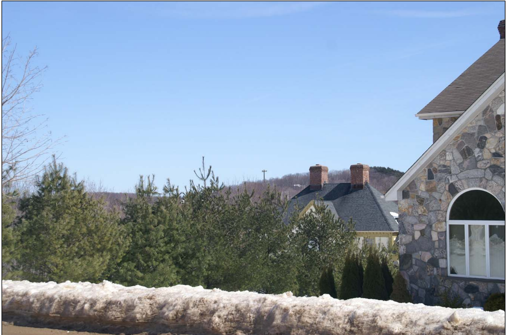
Photo Simulation 5 - View from Society Hill Road, looking east. Distance to site is approximately 0.41 mile. Winter condition. Monopole is shown with one array of antennas.