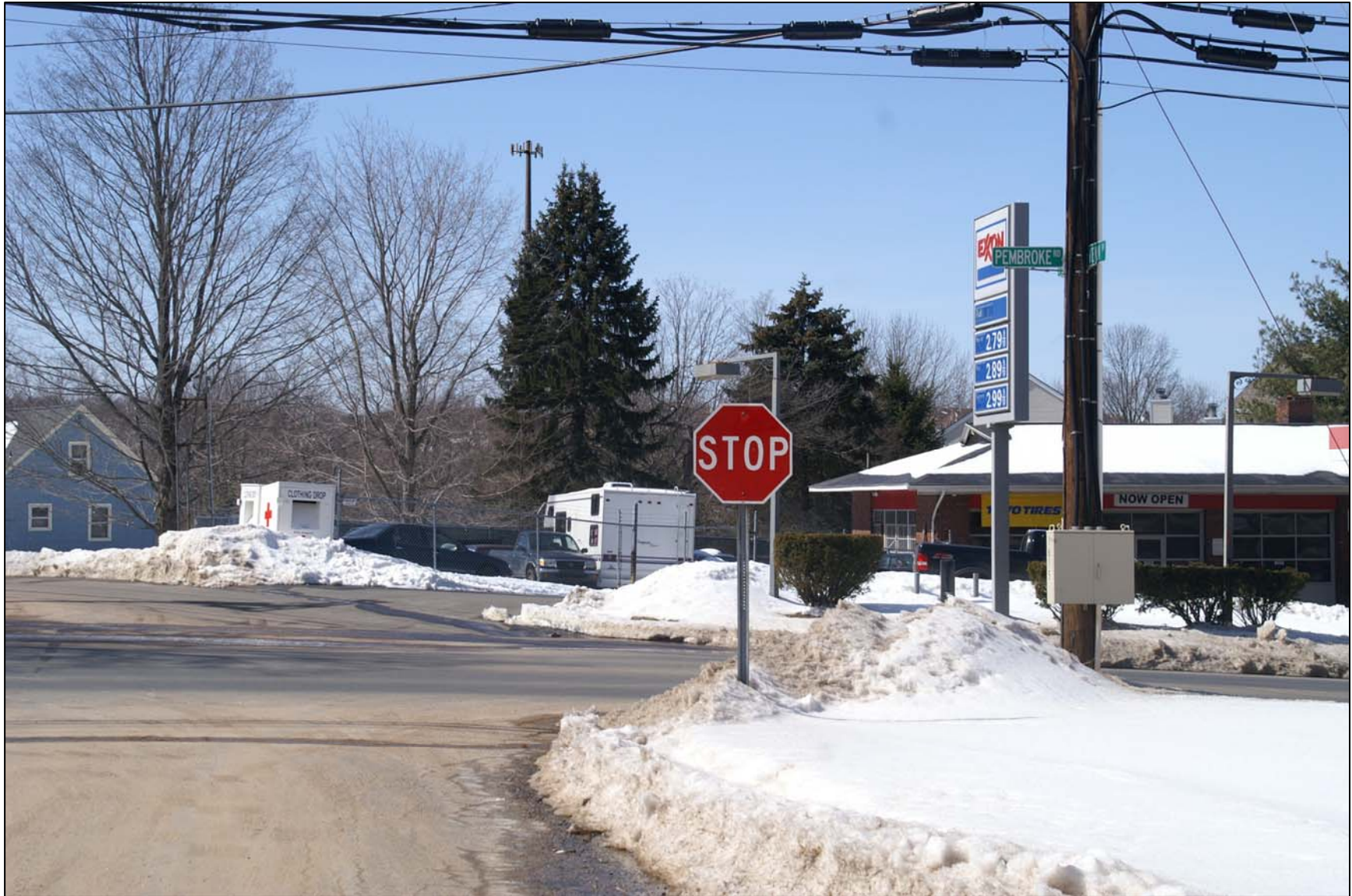
Photo Simulation 6 – View from the north corner of Kevin Drive and Pembroke Road, looking northwest. Distance to site is approximately 0.11 mile. Winter condition. Monopole is shown with one array of antennas.