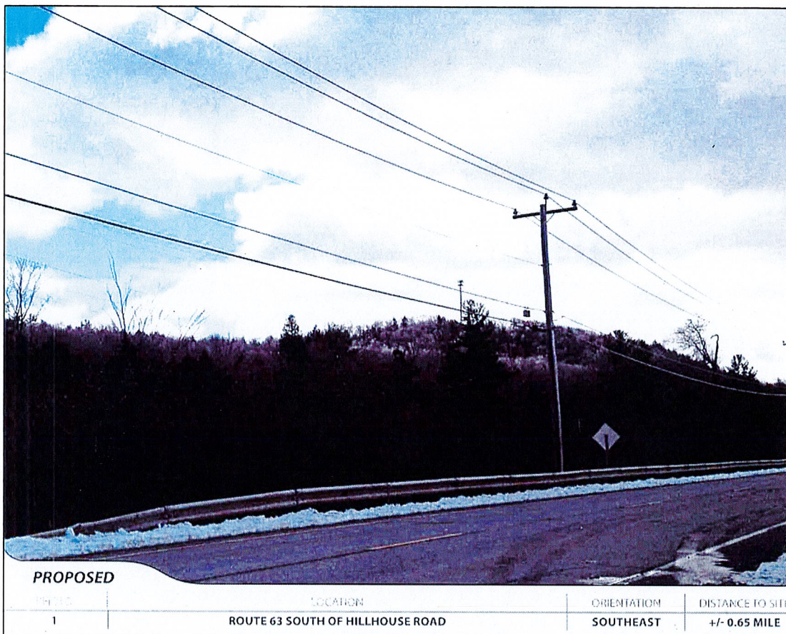
Photo simulation of Proposed T-Mobile installation with platform-mounted antennas