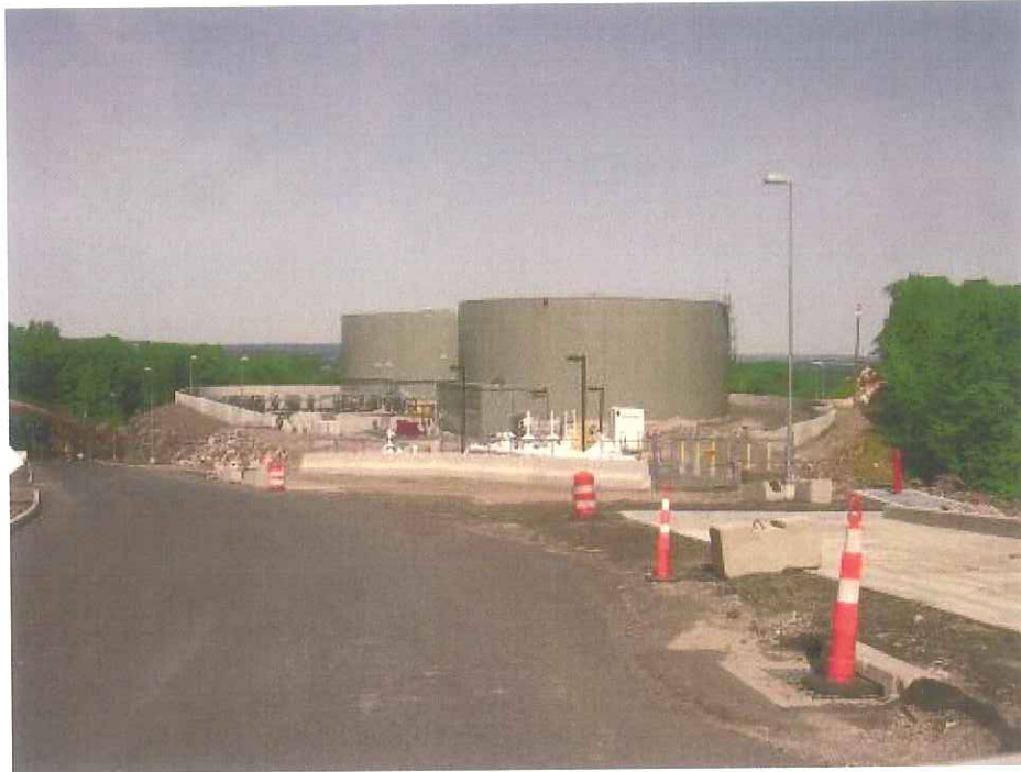
Kleen Energy oil tank farm facility