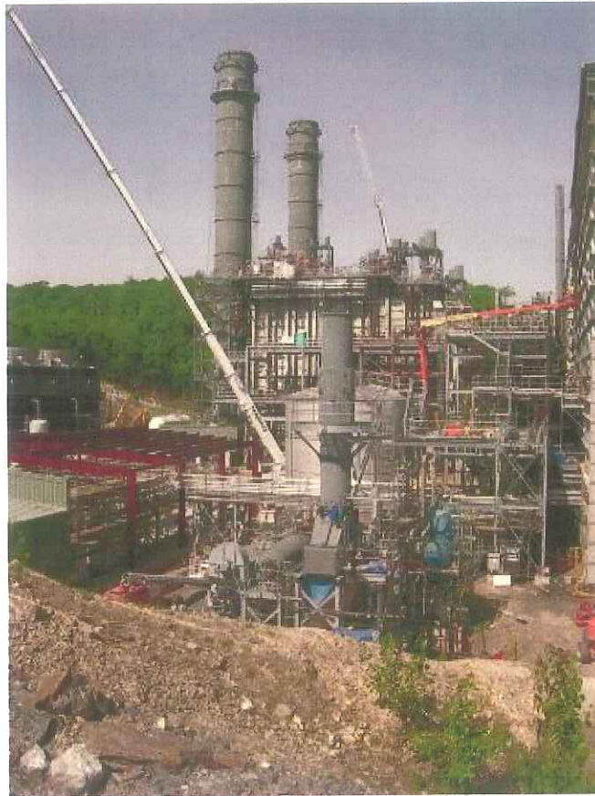
Kleen Energy auxiliary boiler system

The repair and restoration work at the Facility has been taking place since the February 7, 2010 incident, and significant progress has been made. In order for the Council to better understand the current status of the Kleen Energy Facility, this filing includes several pictures that were taken during the past two weeks that show the current status of the Facility.