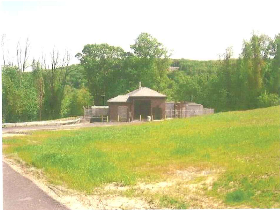
Kleen Energy water emergency generator facility