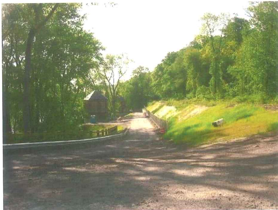
Kleen Energy water wells on Connecticut River