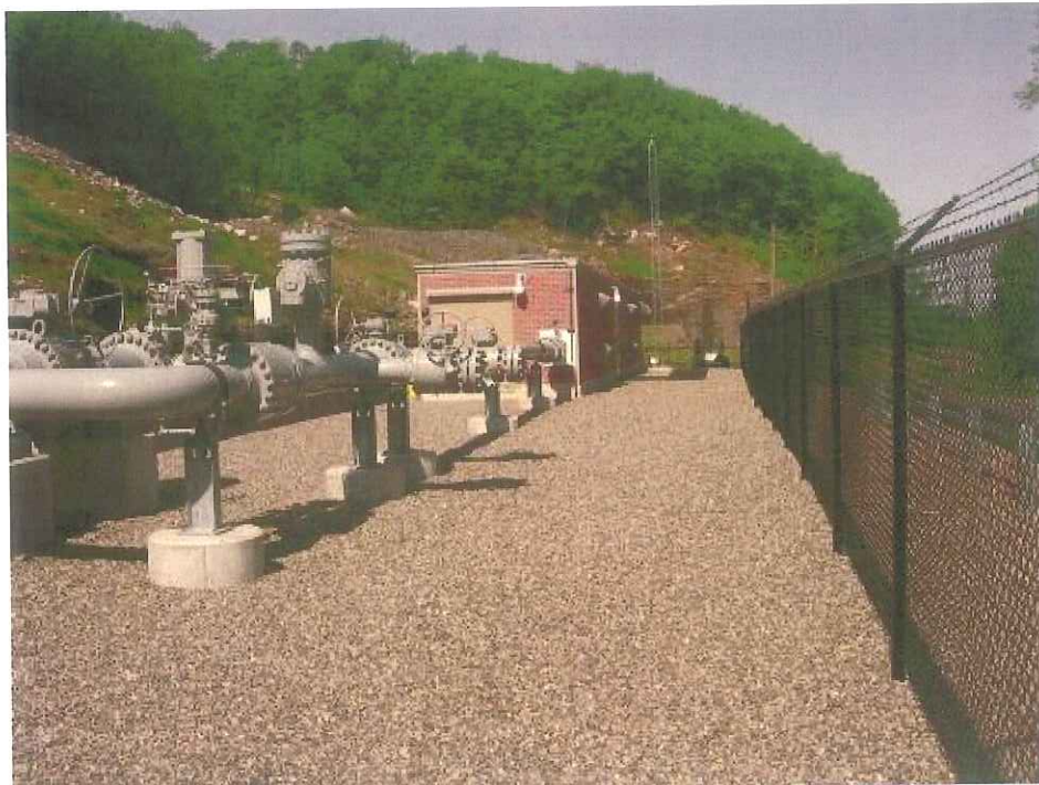
Kleen Energy – Algonquin natural gas facility off River Road