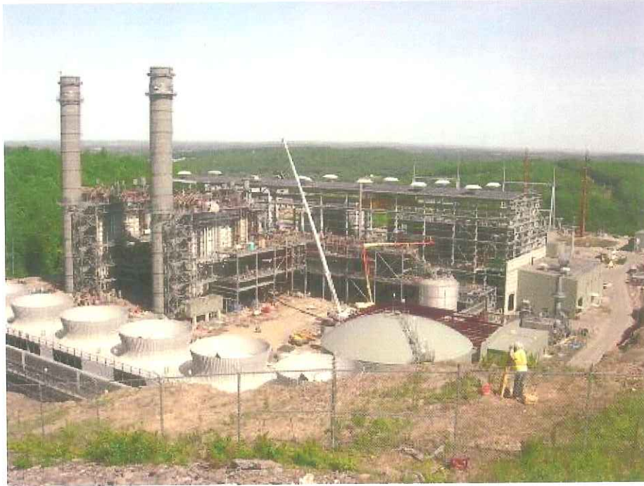
Kleen Energy power island