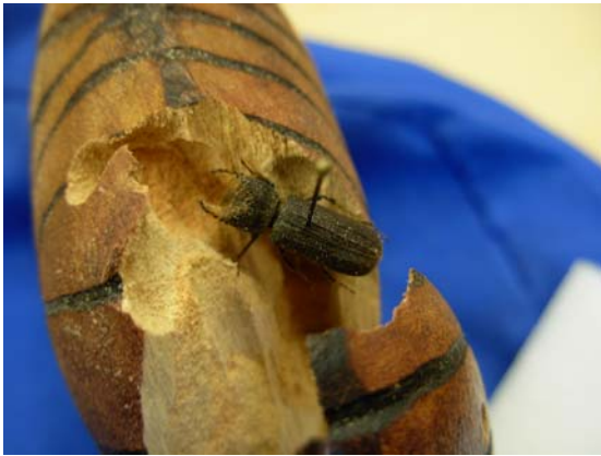
Auger beetle Bostrychoplites cornutus (Oliver). CAES collection.

four animal statues as gifts at a street market. Eighteen months later, a large adult beetle emerged from the haunch of the zebra (see photo below). It was identified as the Auger beetle Bostrychoplites cornutus (Oliver). The insect was put into the CAES insect collection.