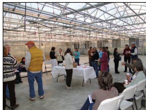
Figure 8. Reception at Geremia Greenhouses.