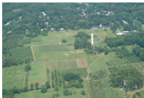
Lockwood Farm, Hamden