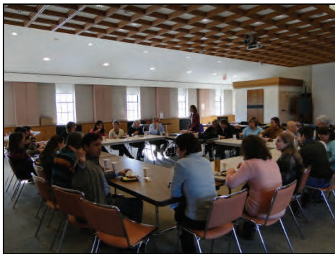
Figure 1. NEPDN meeting in Jones Auditorium.

THE CONNECTICUT AGRICULTURAL EXPERIMENT STATION