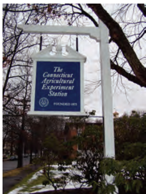
Entrance to The Connecticut Agricultural Experiment Station in New Haven on Huntington Street