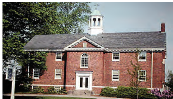
Valley Laboratory, Windsor