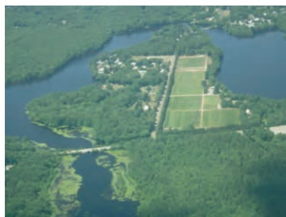
Griswold Research Center, Griswold