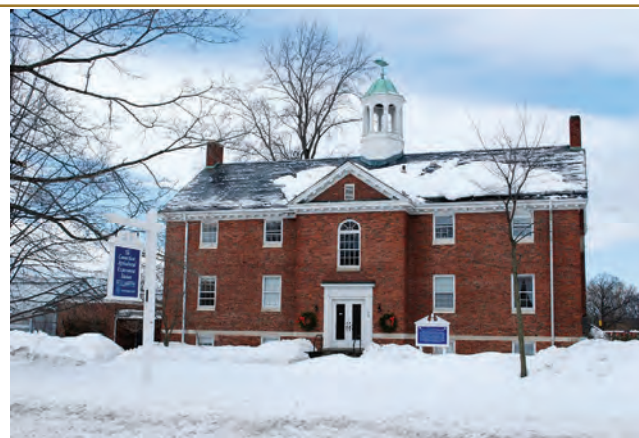
Valley Laboratory in Windsor, CT