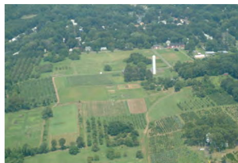
Lockwood Farm, Hamden