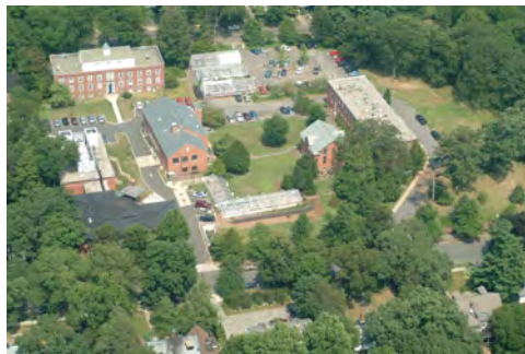
Main Laboratories, New Haven