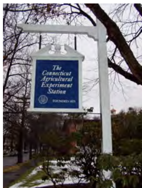
Entrance to The Connecticut Agricultural Experiment Station in New Haven on Huntington Street