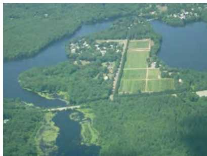
Griswold Research Center, Griswold