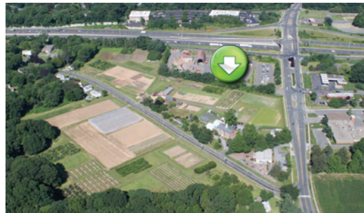
Valley Laboratory, Windsor