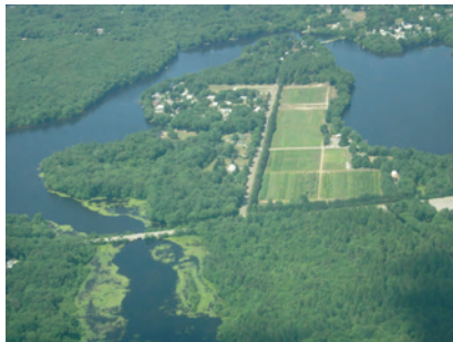
Griswold Research Center, Griswold