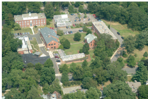
Main Laboratories, New Haven