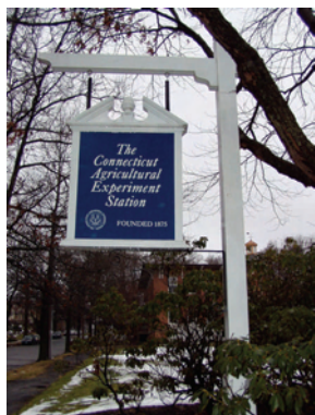
Entrance to The Connecticut Agricultural Experiment Station in New Haven on Huntington Street