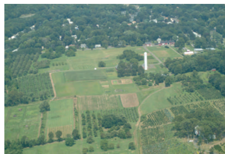
Lockwood Farm, Hamden