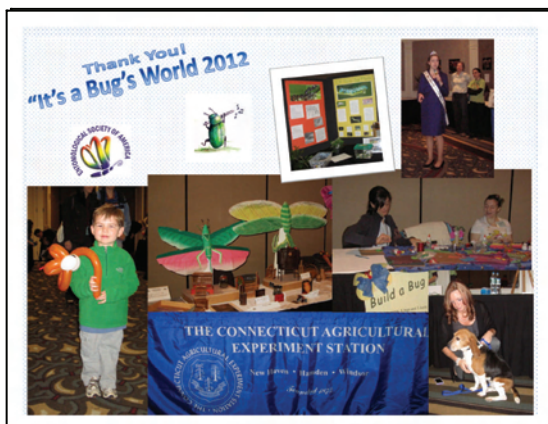
Collage of the "It's a Bug's World" public exhibit.

THE CONNECTICUT AGRICULTURAL EXPERIMENT STATION